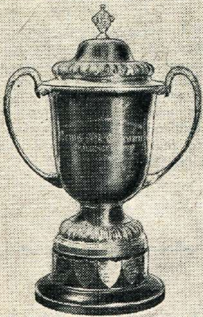
The "News Chronicle" Challenge Trophy The Premier Award in the Senior Cup Section

Cups. Clipstone Colliery Welfare Band won this cup at the Daily Herald Contest at Belle Vue, May 17th, 1952.