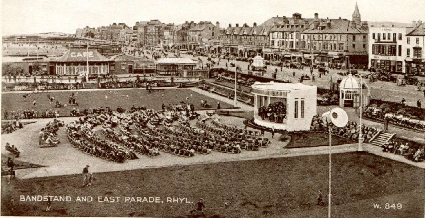
BANDSTAND AND EAST PARADE, RHYL.