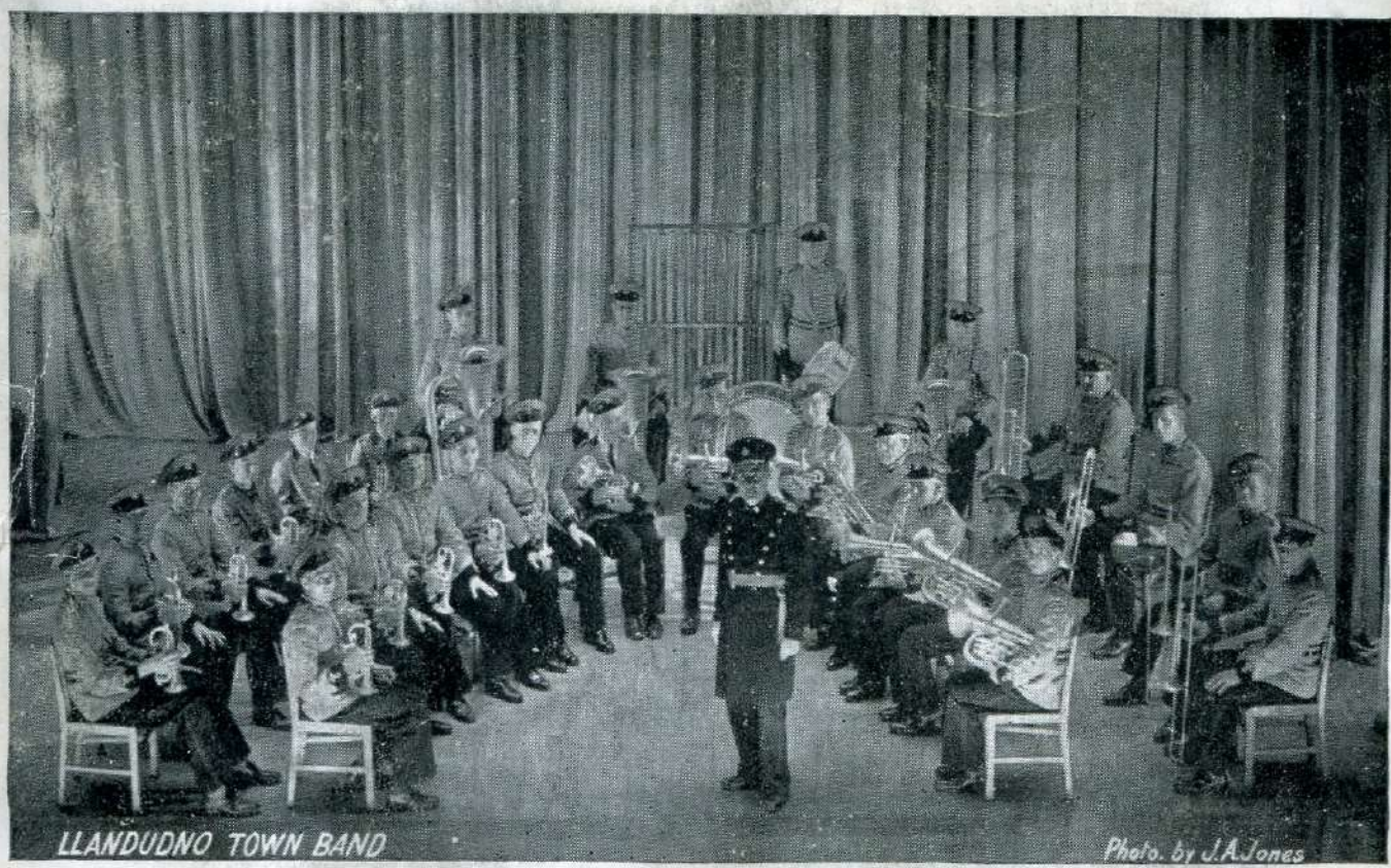
LLANDUDNO TOWN BAND