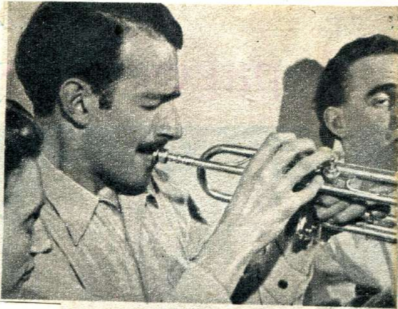
Humphrey Lyttelton, bandleader and trumpeter, has made a novel record