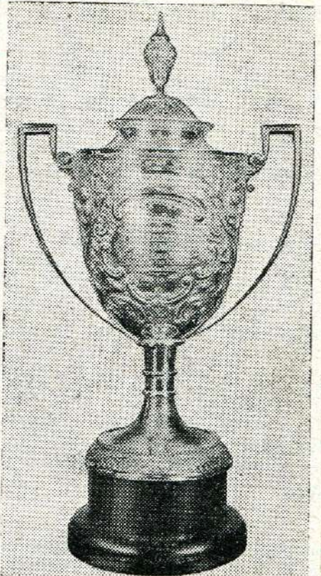
THE "DAILY DISPATCH" CHALLENGE CUP The Premier Award in the Senior Cup Section