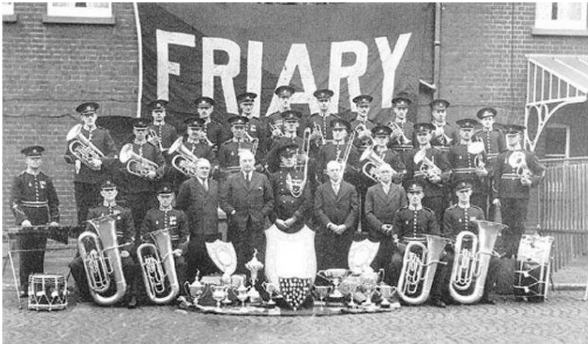
Friary Silver Band