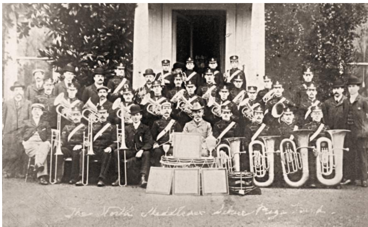
North Middlesex Silver Band