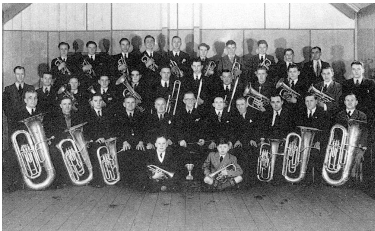
Tylorstown Workmen's Silver Prize Band, 1949