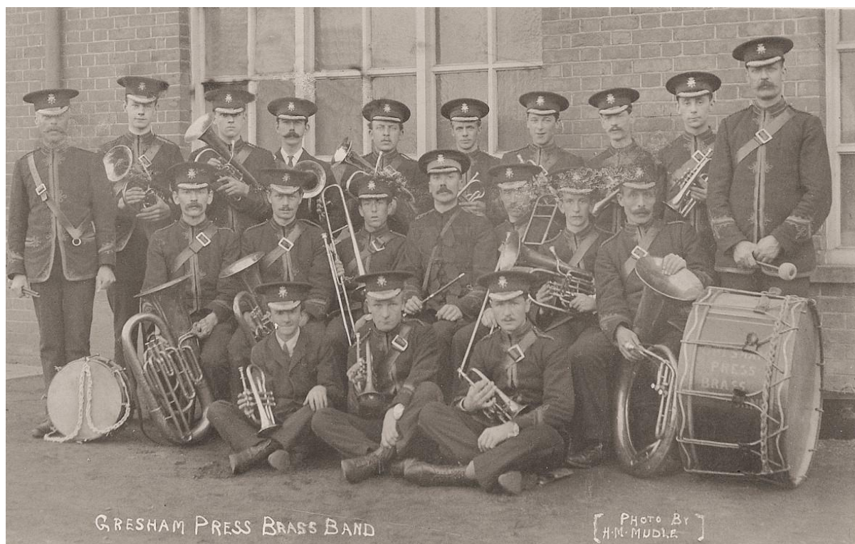
Gresham Press Brass Band