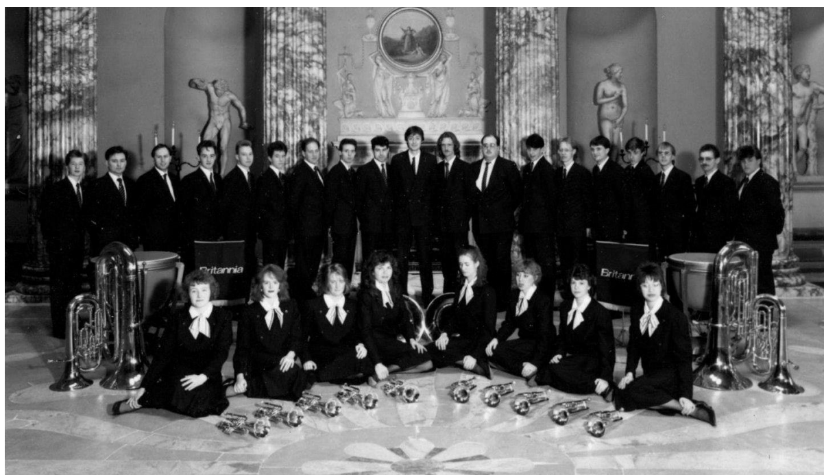
Britannia Airways Band

Aircraft Components Limited Band (Gloucestershire)