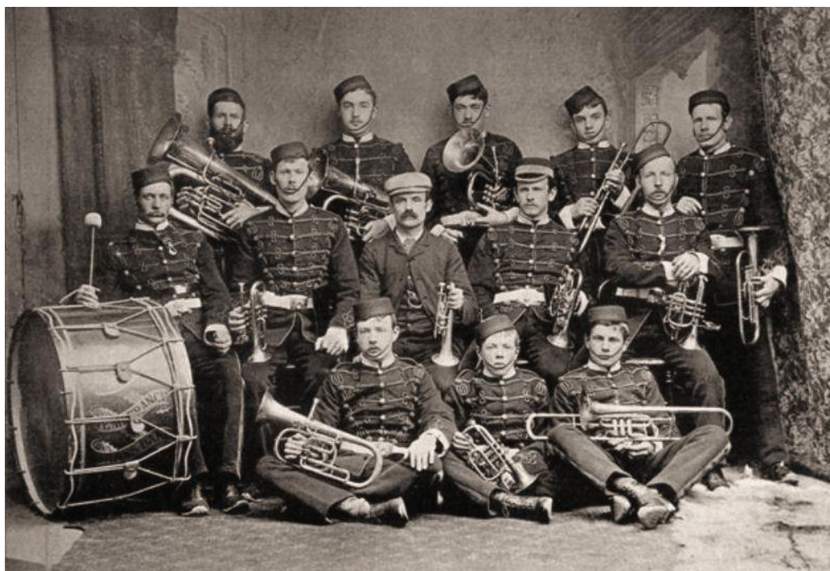
Threlkeld Granite Quarry Temperance Brass Band