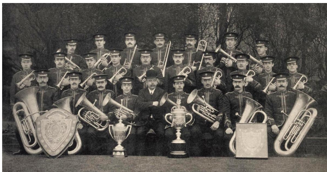
Perfection Soap Works Band