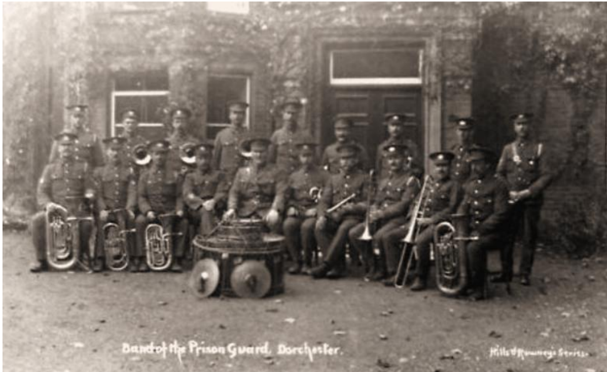
Band of the Prison Guard, Dorchester