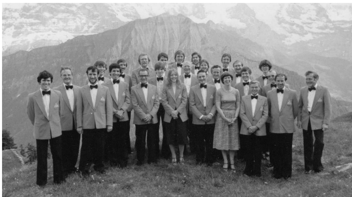
Hanwell (Roneo Vickers) Band