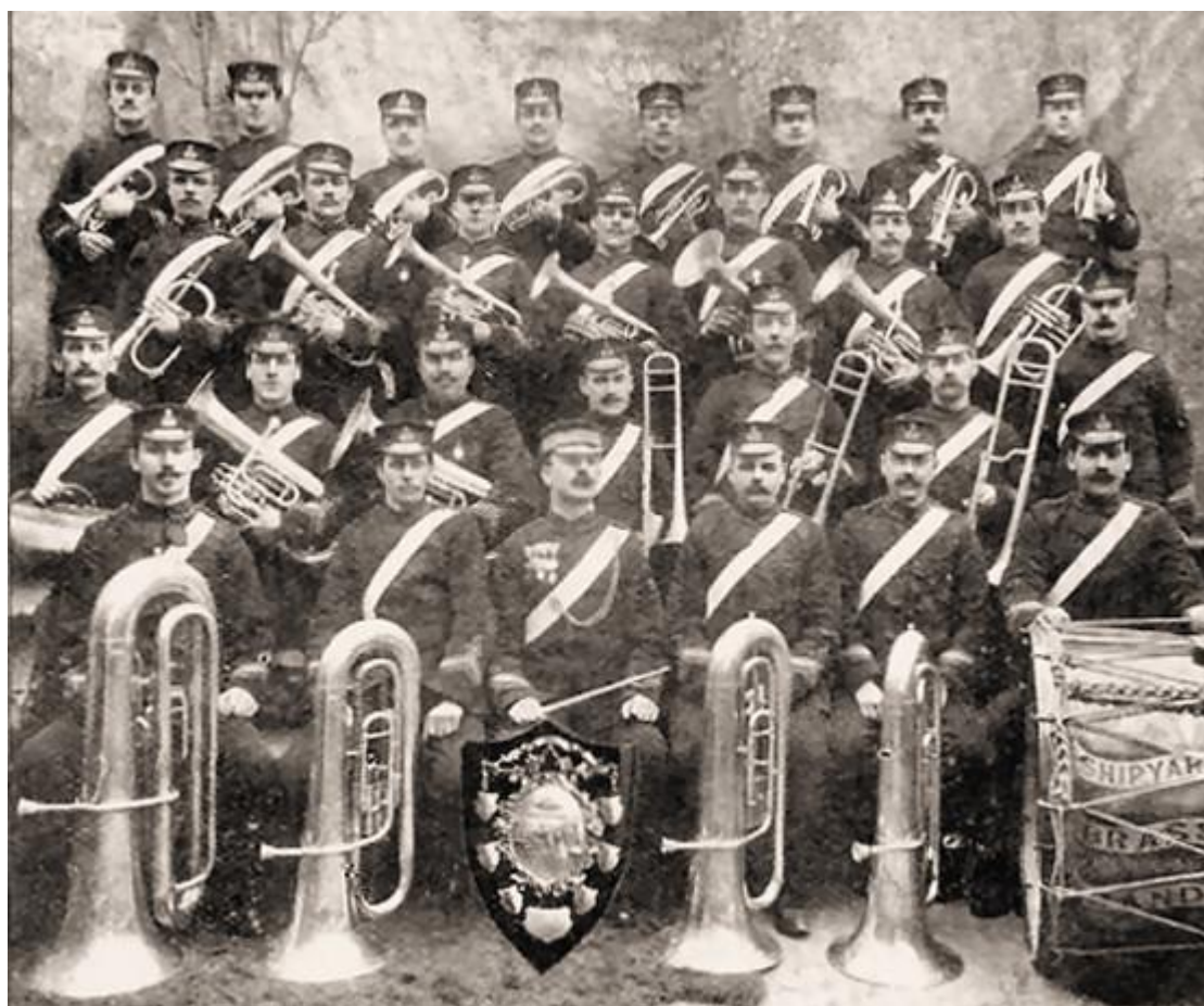
Barrow Shipyard Brass Band