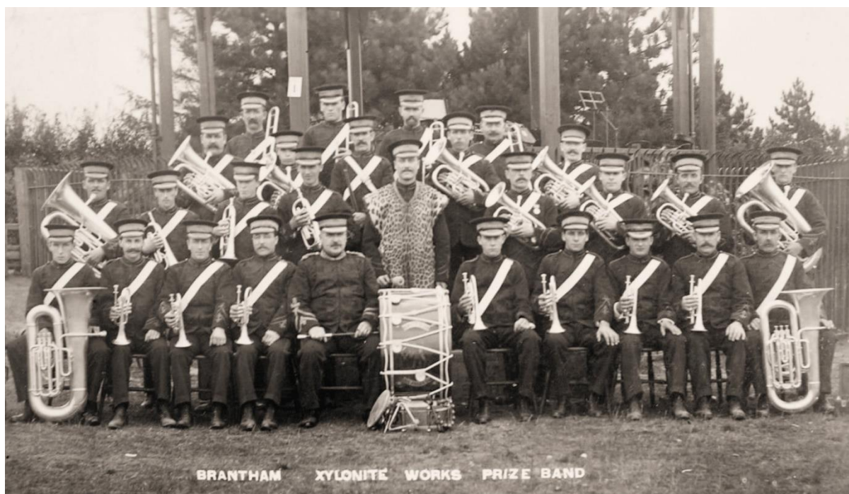
Brantham Xylonite Works Brass Band