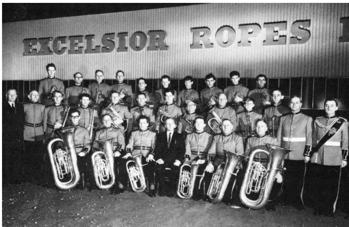
Excelsior Ropes Works Band