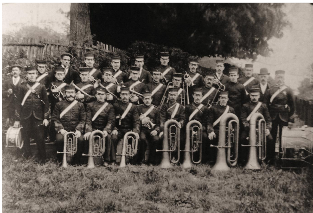
Barton Cycle Works Brass Band