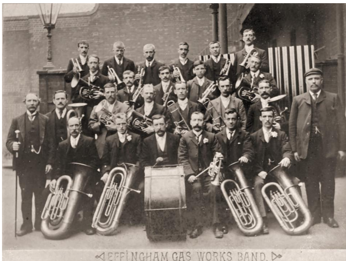
Effingham Gas Works Band