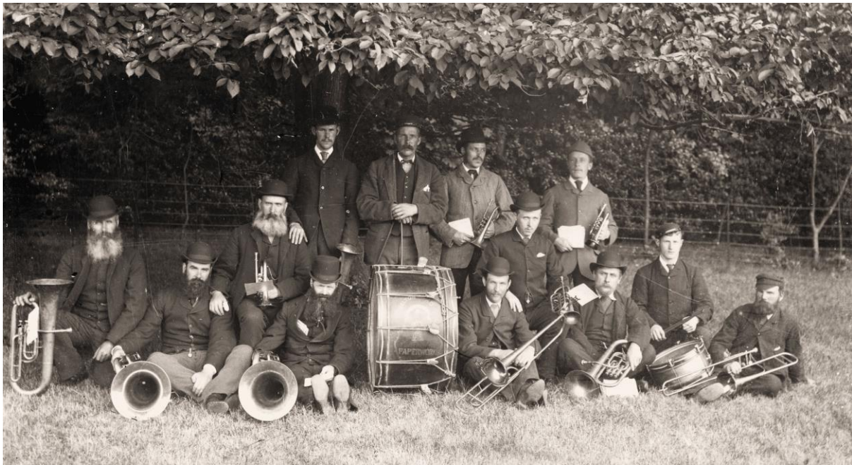
Beltonford Paperworks Brass Band