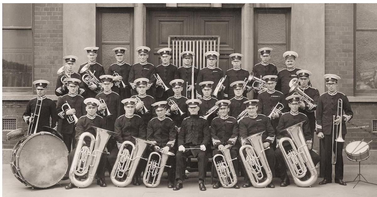
British Oil and Cake Mills Band

Aunt Bessie's East Yorkshire Brass Band (Hull, Yorkshire (East Riding)) [previous name of current band] - see: East Riding of Yorkshire Band