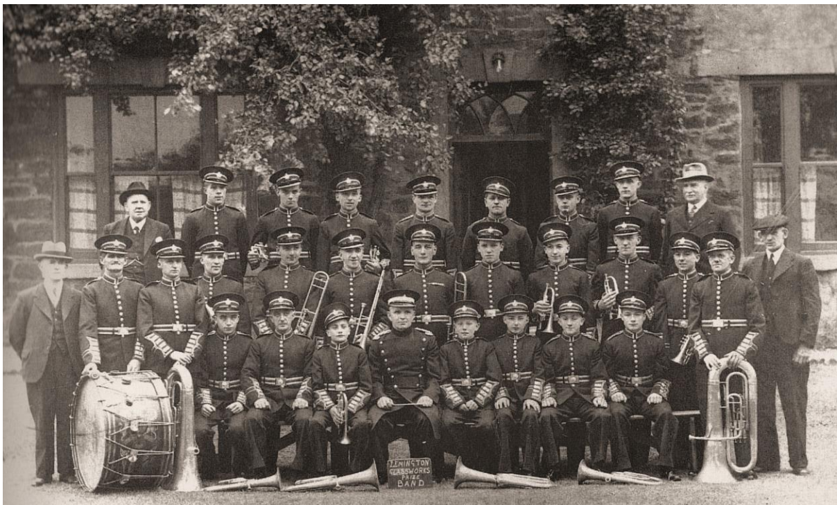
Lemington Glass Works Prize Band