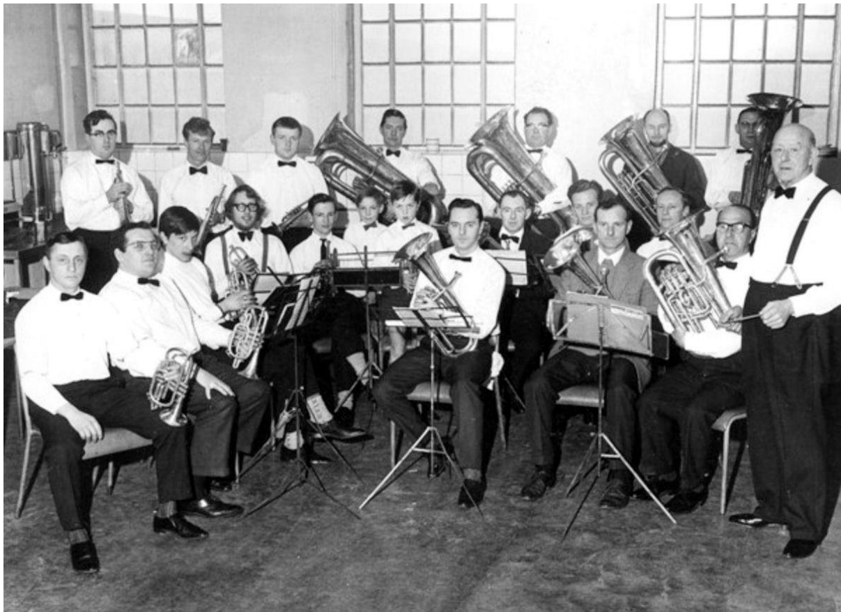
Stockport Telephone Band