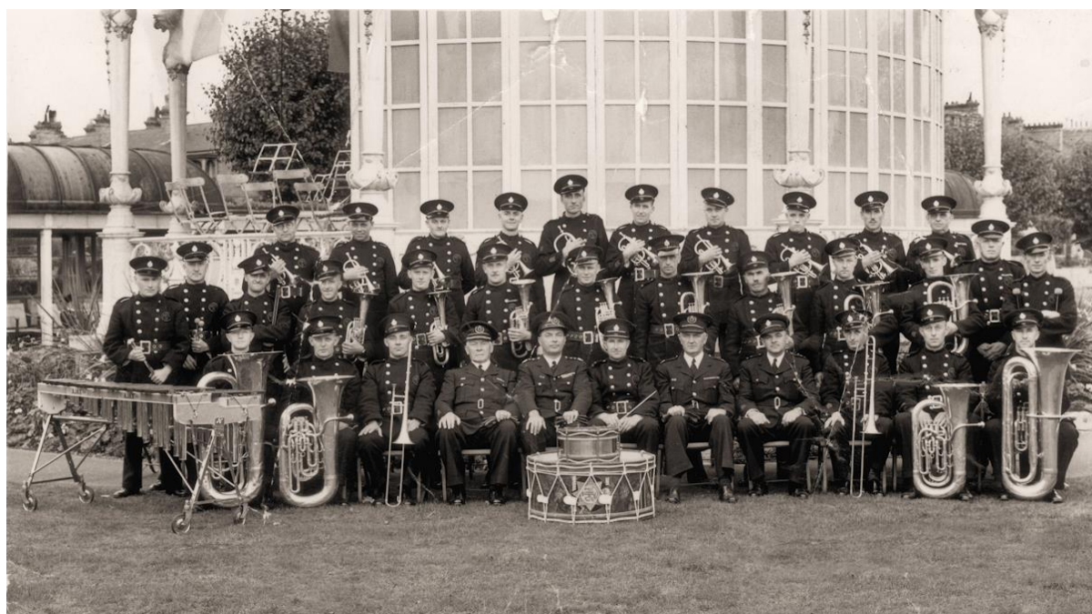
National Fire Service Band (11 Area, Southend)