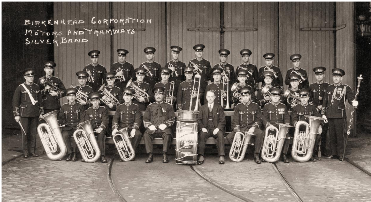
Birkenhead Corporation Motors and Tramways Silver Band