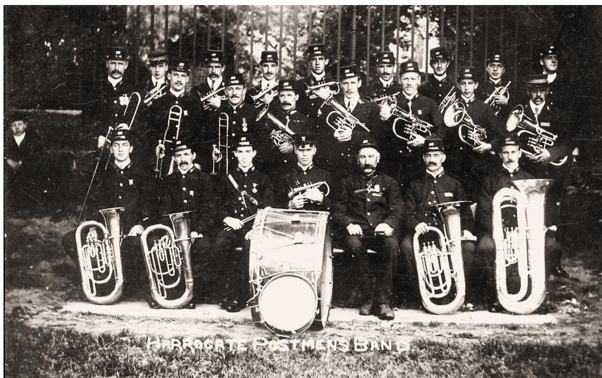
Harrogate Postmen's Band