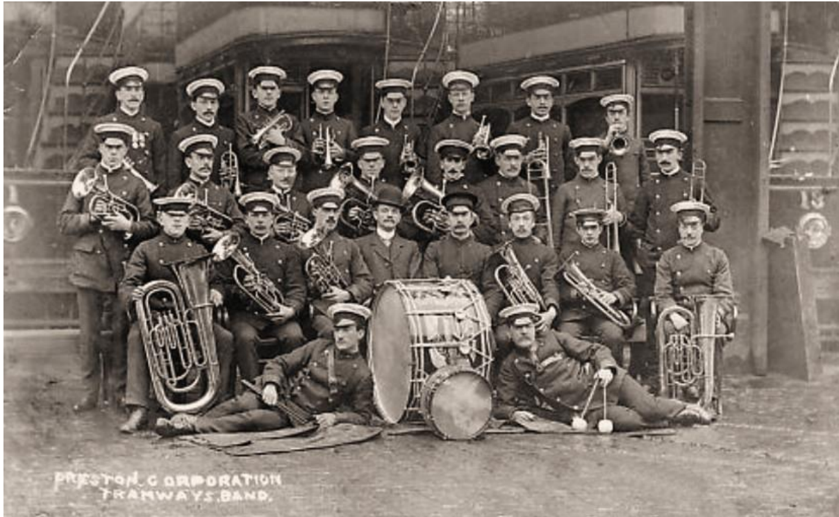
Preston Corporation Tramways Band, c. 1910

From the earliest days of brass bands in the British Isles, they have been supported at various times and to differing extents by businesses and their owners. In some cases this support has been purely philanthropic, but there was usually a quid pro quo involved where the sponsor received benefits – e.g. advertising, income from band engagements, entertainment for business events, a “worthwhile” pastime for their employees, corporate public relations and brand awareness - who would have heard of John Foster’s Mills outside of the Bradford area if it wasn’t for the Black Dyke Band?