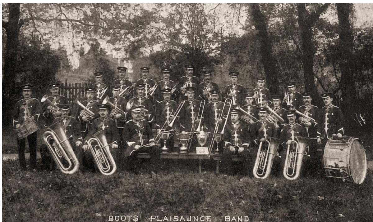
Boots Plaisaunce Band