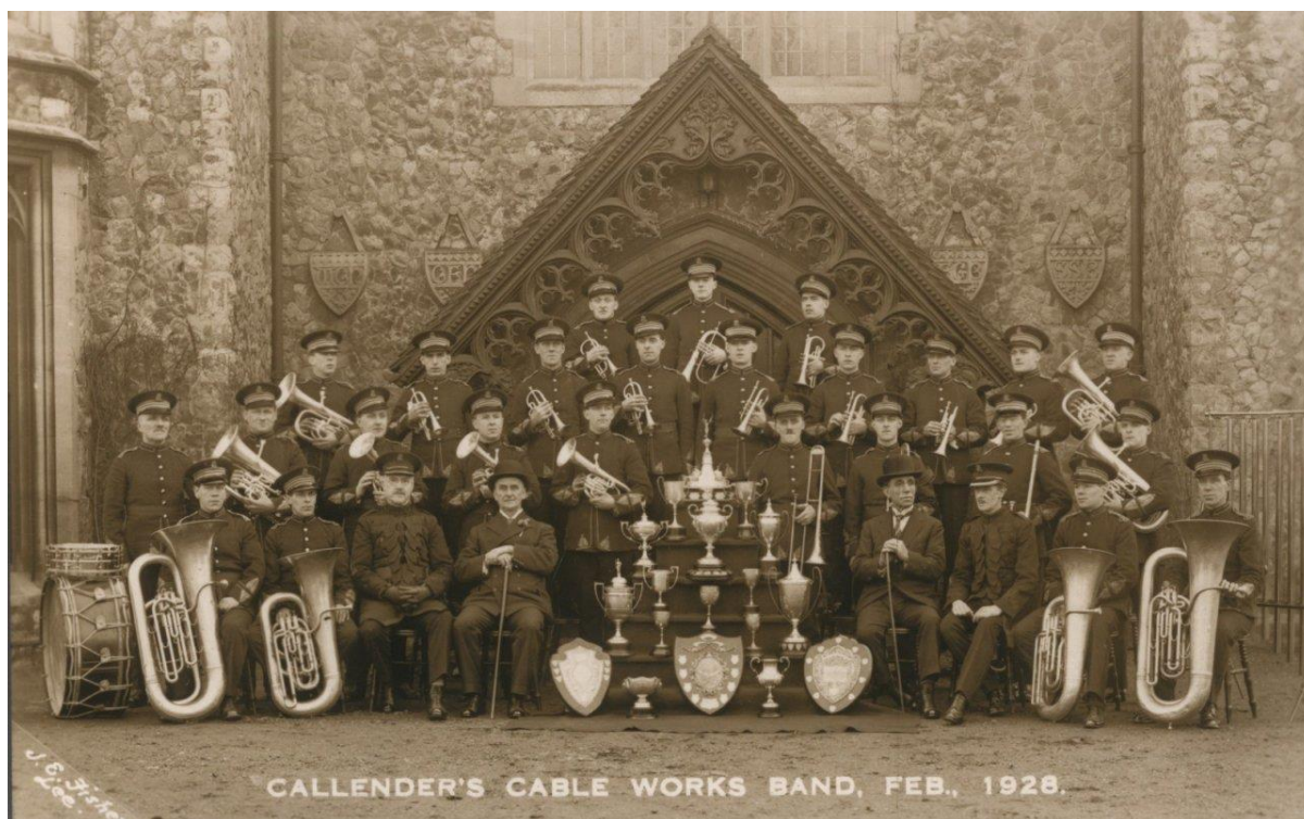
Callender's Cable Works Band

B.I.H.C. (British Insulated and Helsby Cables) Band (Prescot, Lancashire)