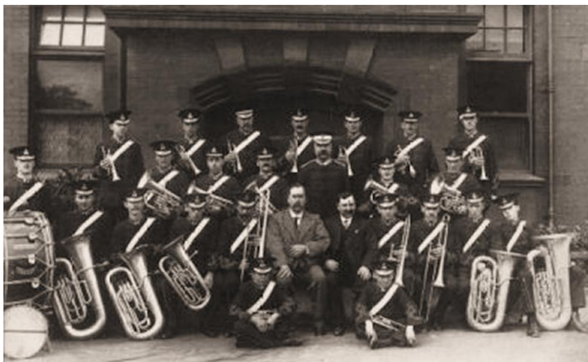
Vulcan Motor Works Brass Band