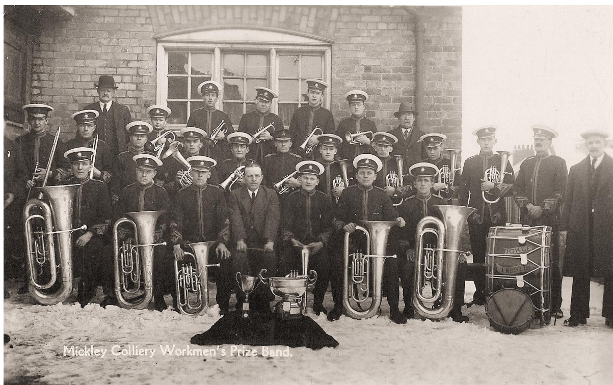
Mickley Colliery Workmen's Prize Band