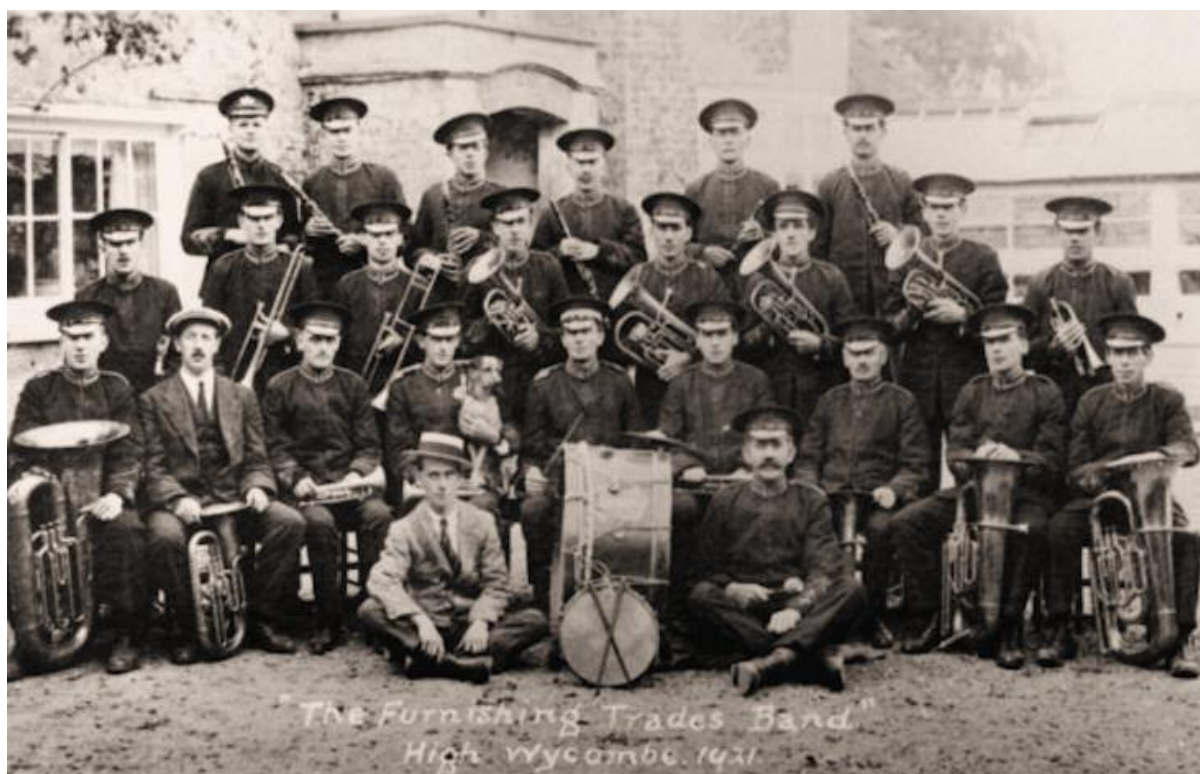
Ercol Furniture Company Band