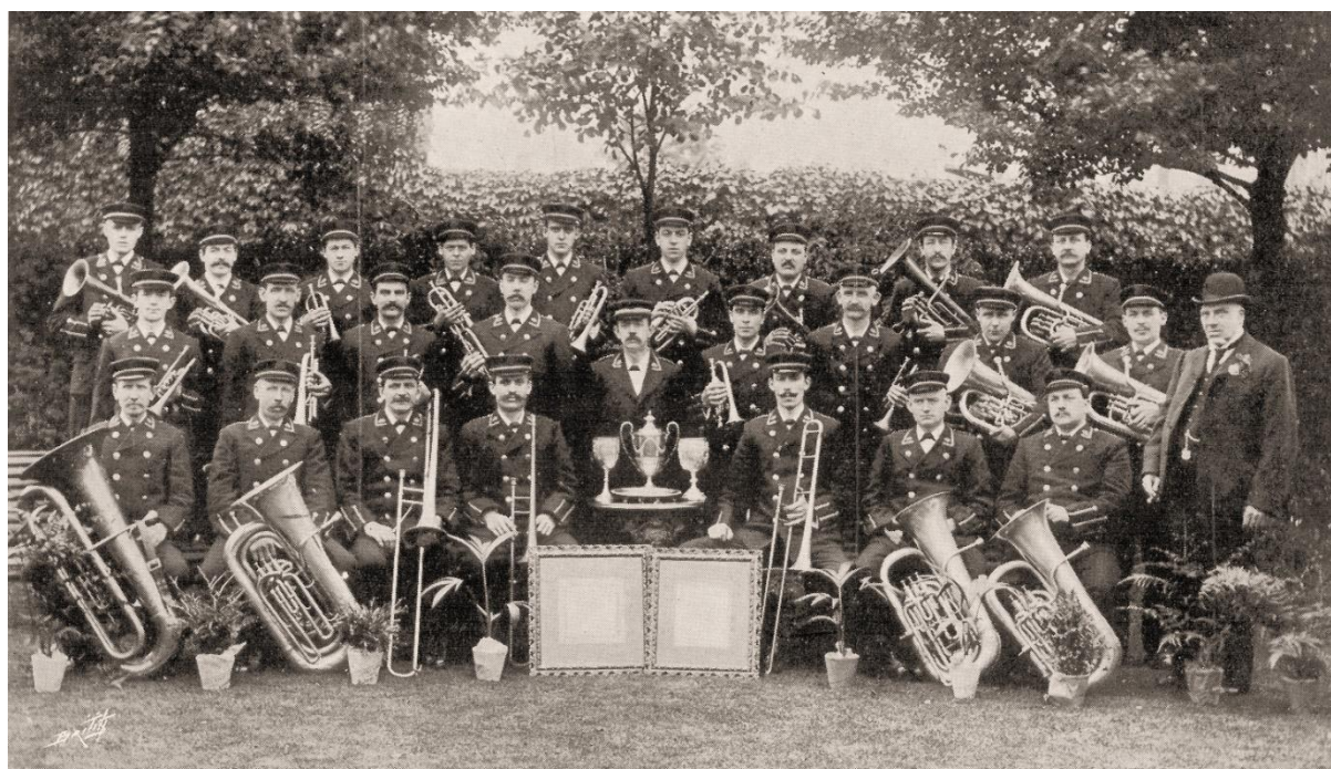
KETTERING TOWN PRIZE BRASS BAND.