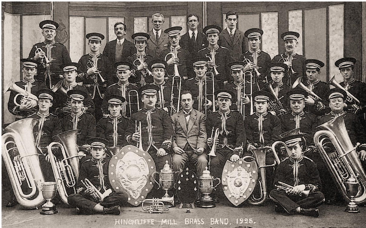
Hinchliffe Mill Brass Band

Akroyd's Brass Band (Halifax, Yorkshire (West Riding))