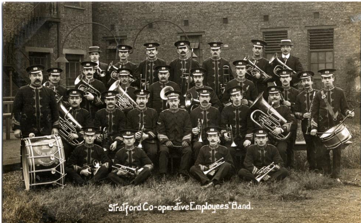
Stratford Co-operative Employees Band