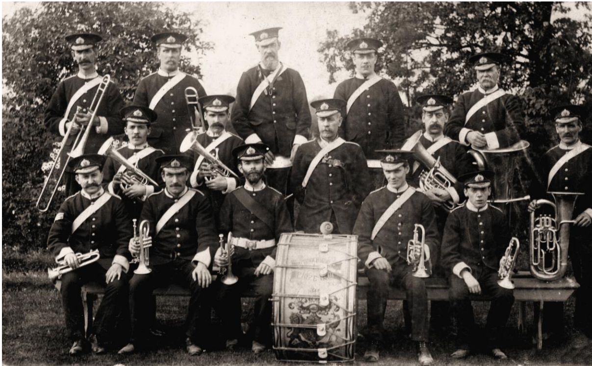
Verdin Adelaide Band, 1922