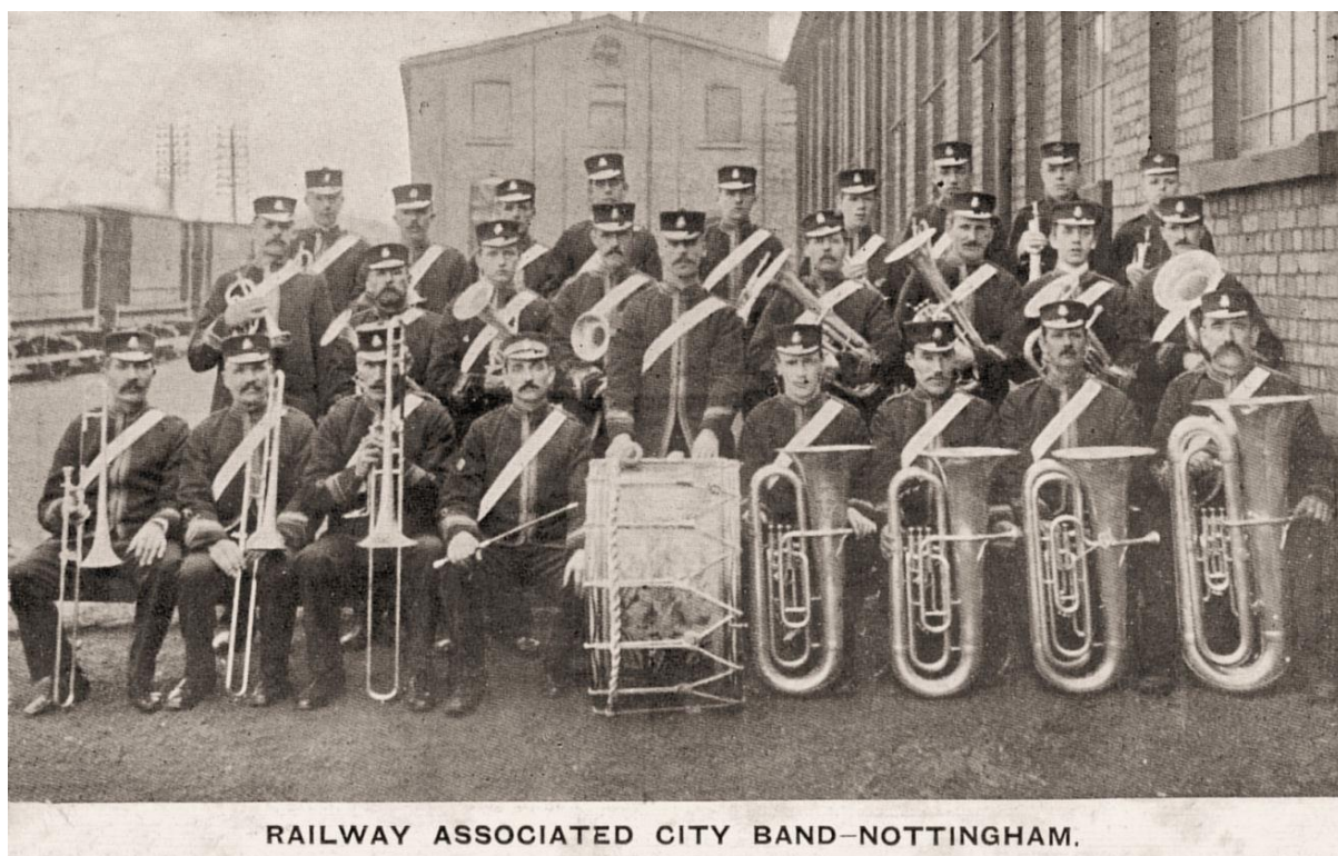
Railway Associated City Brass Band