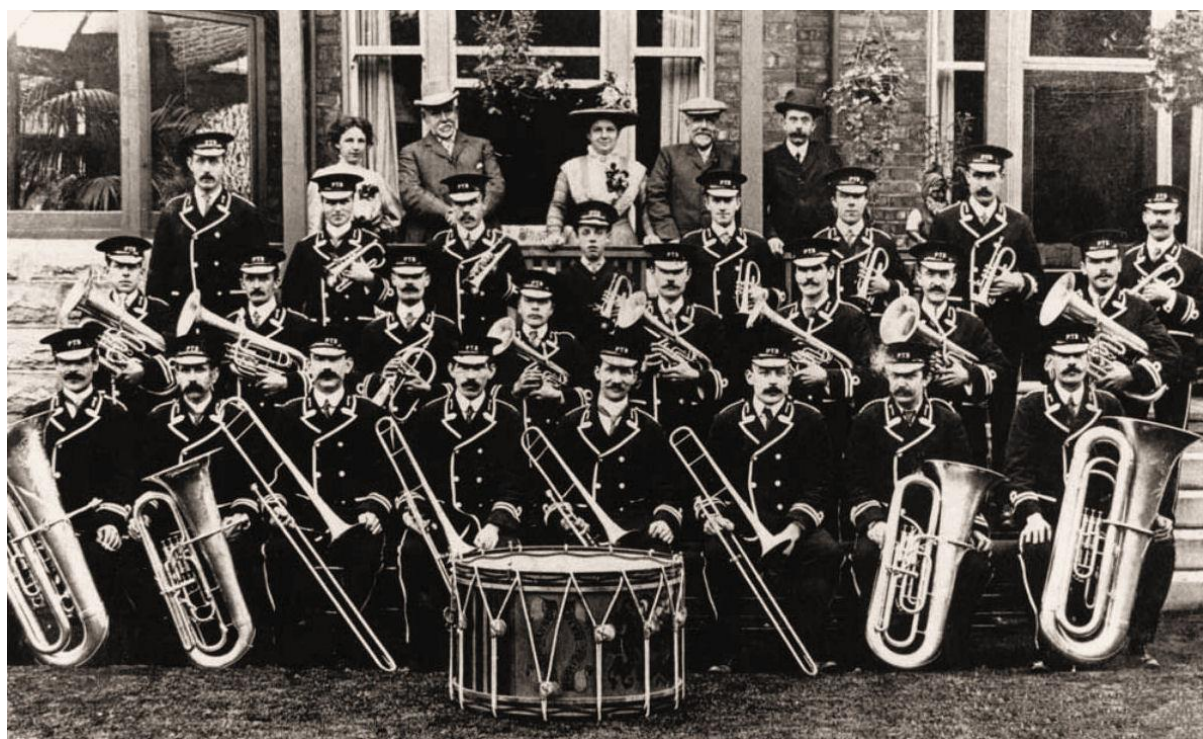
Unknown tannery brass band, Warrington