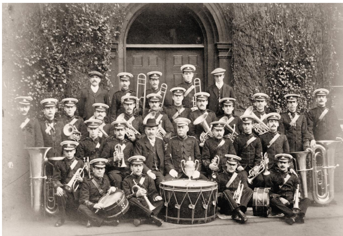
Ruston and Hornsby Band