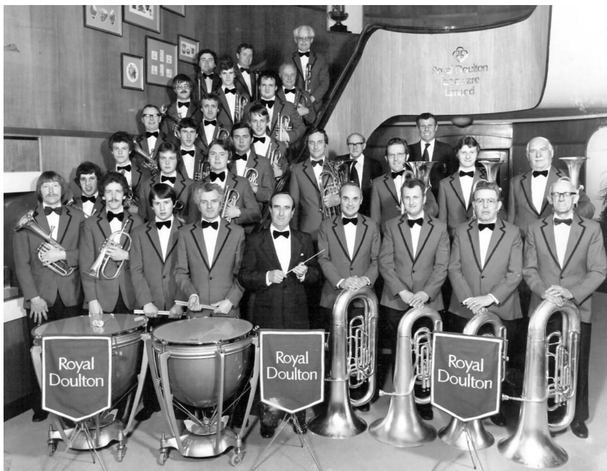
Royal Doulton Brass Band