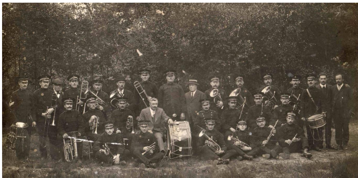
Tarrant's Brass Band