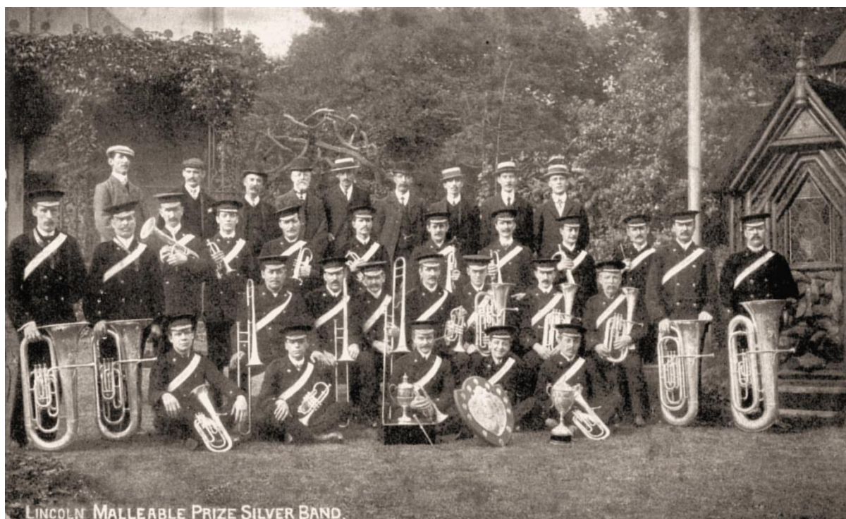
Lincoln Malleable Prize Silver Band