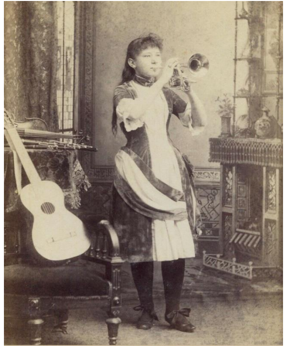
? - Concord, New Hampshire