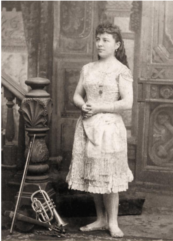
? - Concord, New Hampshire