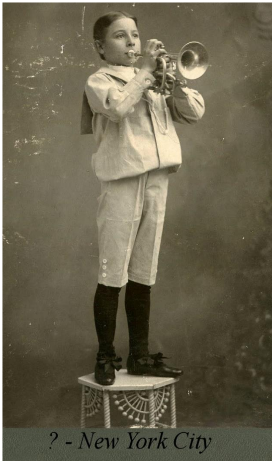
? - New York City