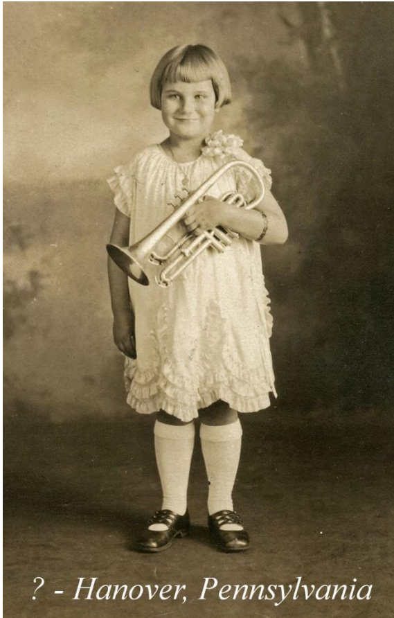
? - Hanover, Pennsylvania