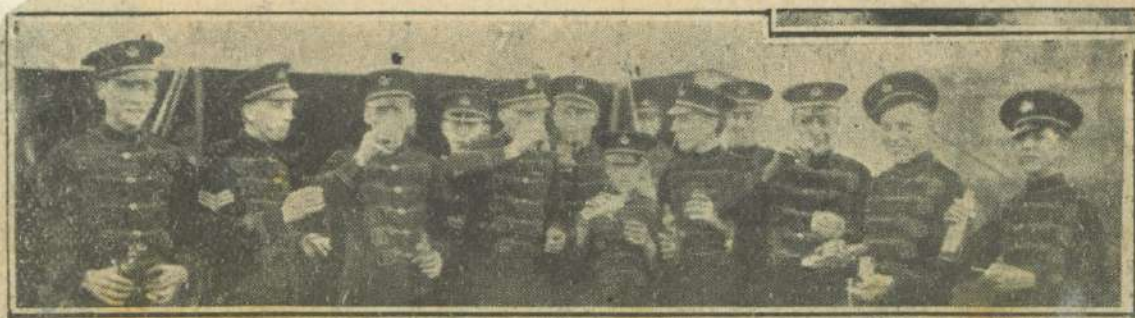
Two scenes at the Cambridge Co-operative Society's fête held on the Town Ground in August, and attended by 4,000 youngsters.

We had to play every time one pound was registered and as sixty one pounds was collected we played that amount of times. The bandmaster thought of one or two schemes to raise money such as throwing money on the drum etc. The affair terminated at nine o'clock, after an enjoyable evening.