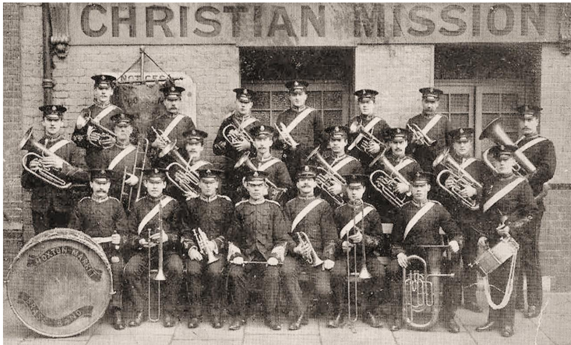
Hoxton Market Mission Brass Band