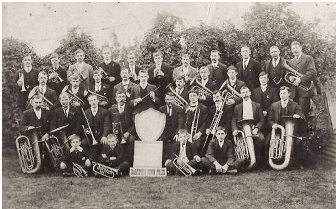
Dartford Town Band, c. 1910