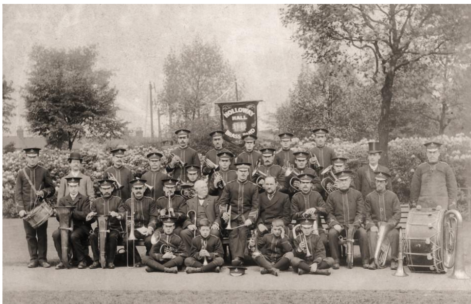
Holloway Hall Brass Band