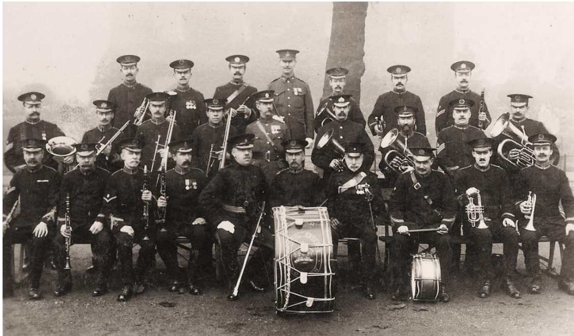
St Pancras National Reserve Band