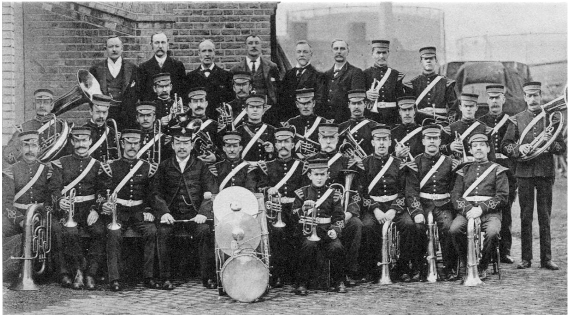
Wandsworth Borough Band