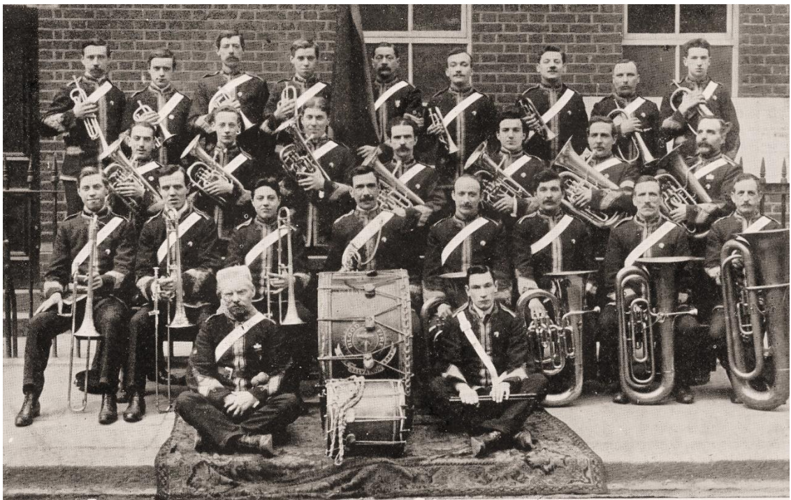
KILBURN I. SALVATION ARMY BAND.

No picture of Kilburn Gas Works Band – this is Kilburn Salvation Army Band