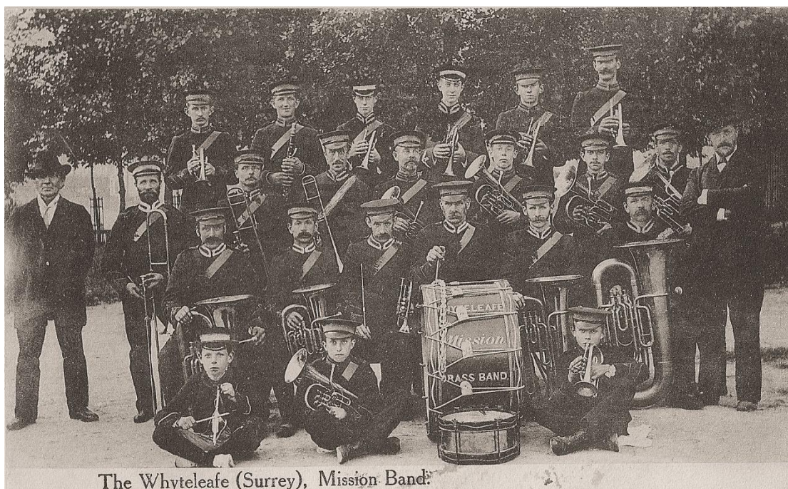
The Whyteleafe (Surrey), Mission Band: