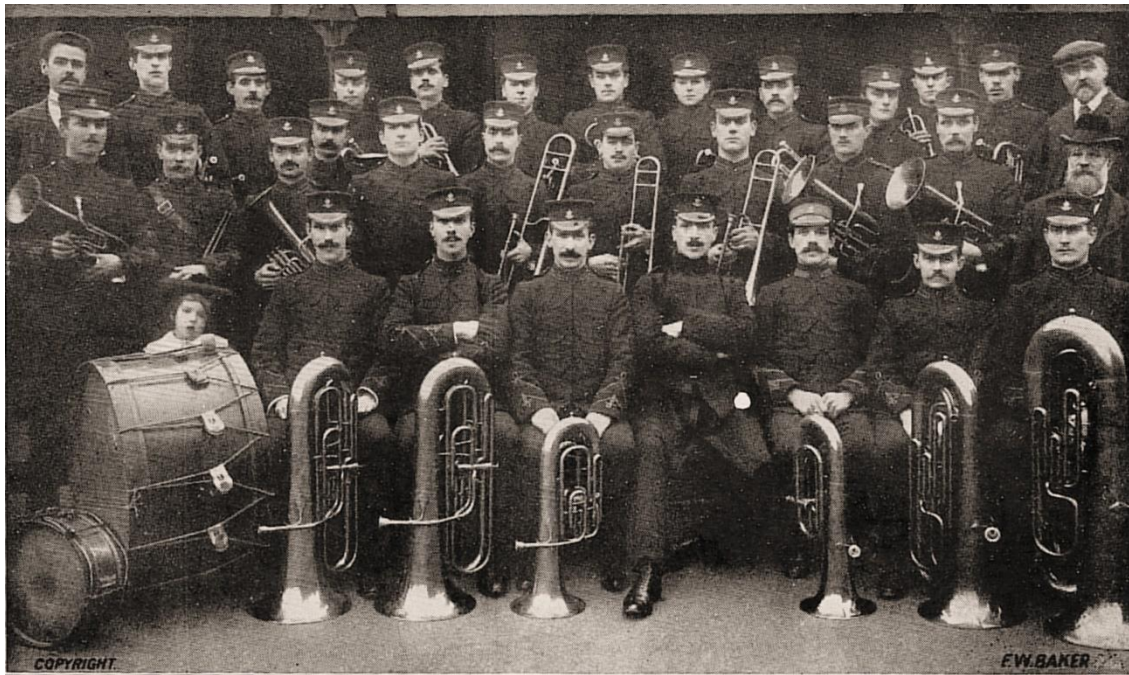
BATTERSEA BOROUGH PRIZE BAND.

No picture of Battersea Tent Band – this is Battersea Borough Band