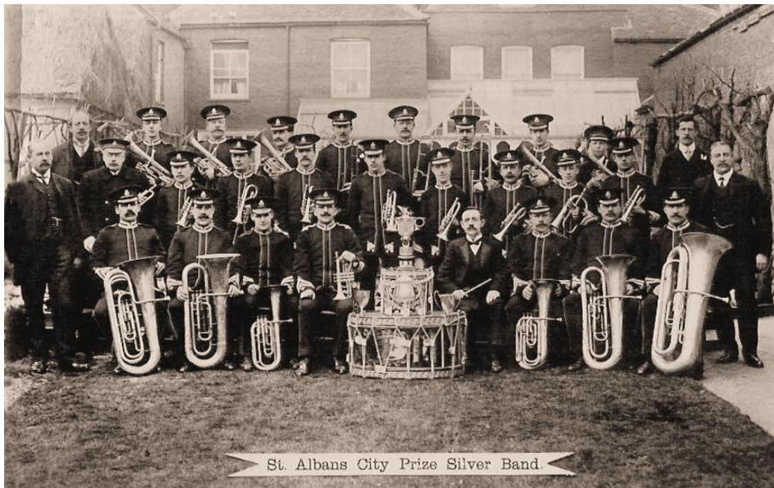
St Albans City Silver Band