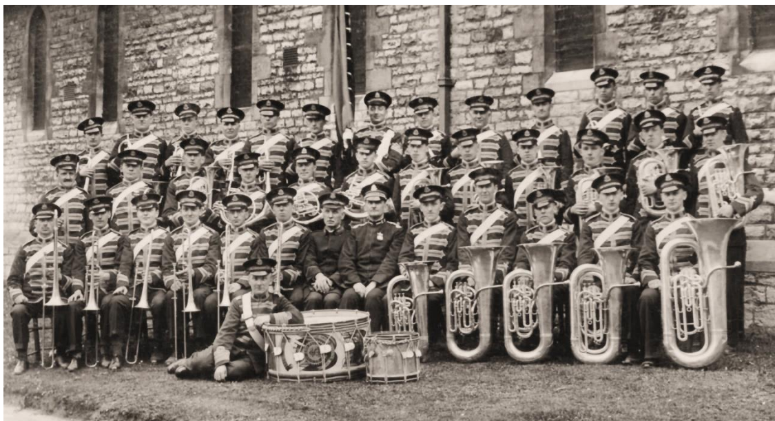
No picture of Ilford Horns Band – this is Ilford Salvation Army Band