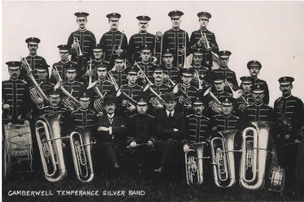
Camberwell Temperance Silver Band