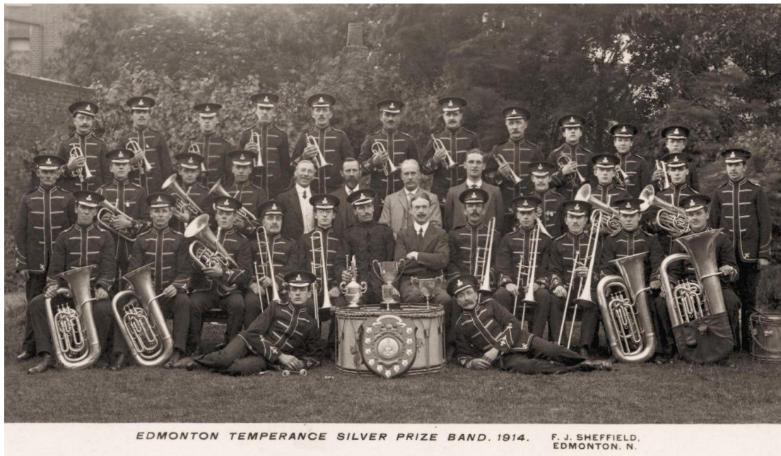
Edmonton Temperance Band