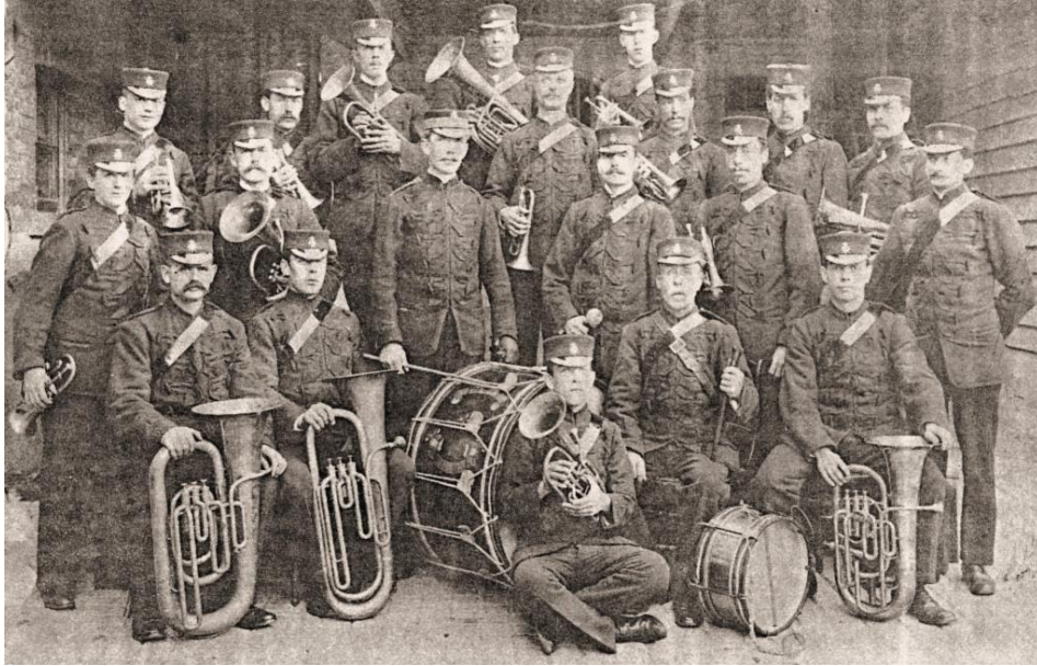
Hanwell Town Band, c. 1910