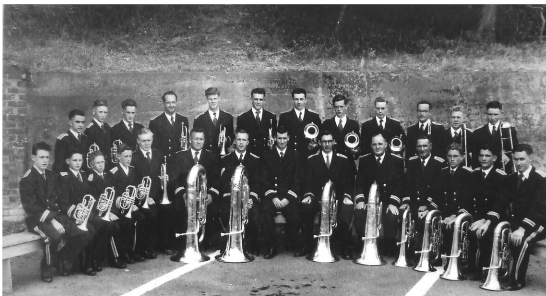
Ponsonby Boys' Brass Band – 1957