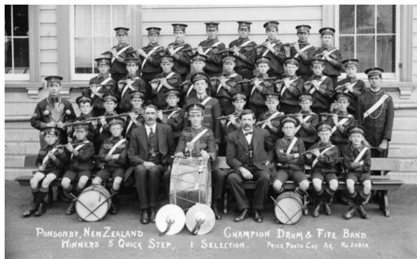
Ponsonby Drum & Fife Band