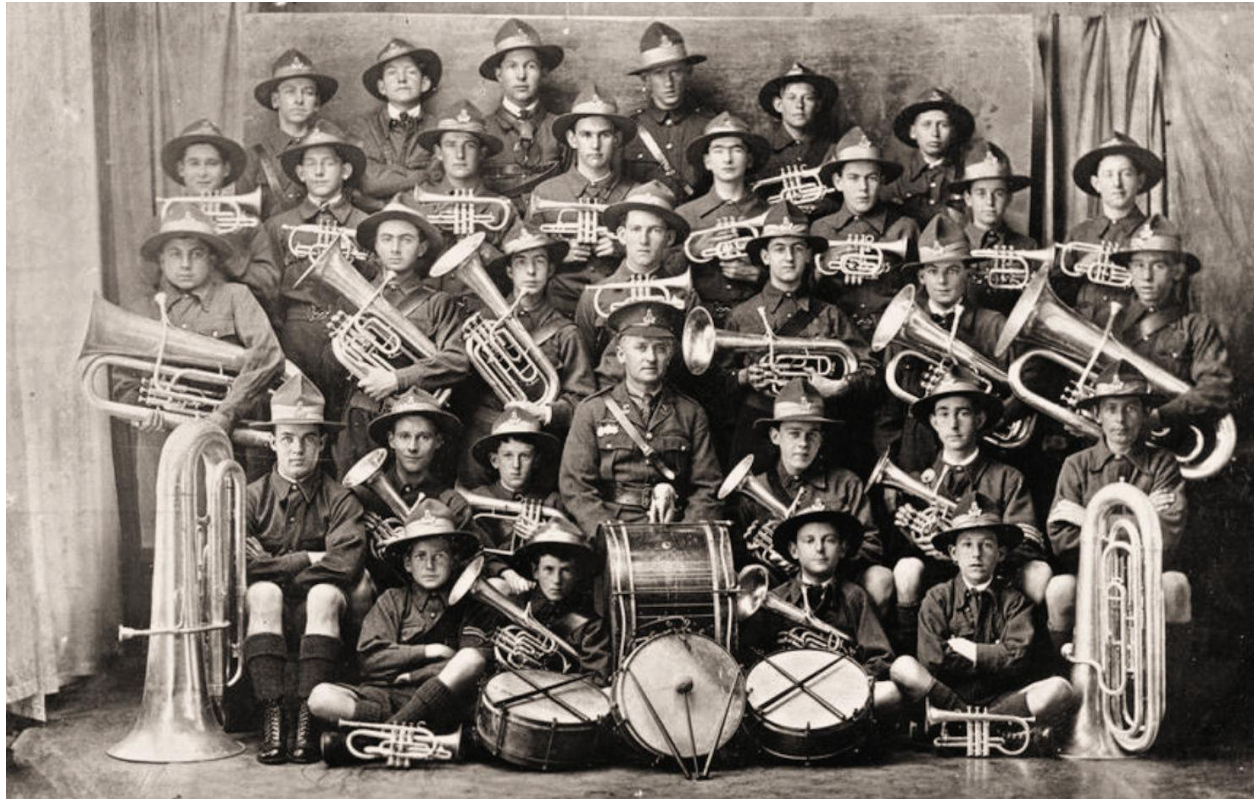
Ponsonby Boys' Brass Band – 1921/22