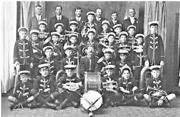
Ponsonby Boys' Brass Band - 1918