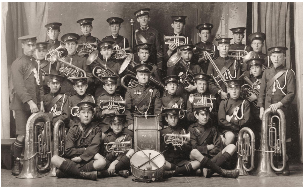
Ponsonby Boys' Brass Band – 1920/21

In the early 1920's the band carried out several tours around New Zealand, lasting two or three weeks, performing in various towns and cities.