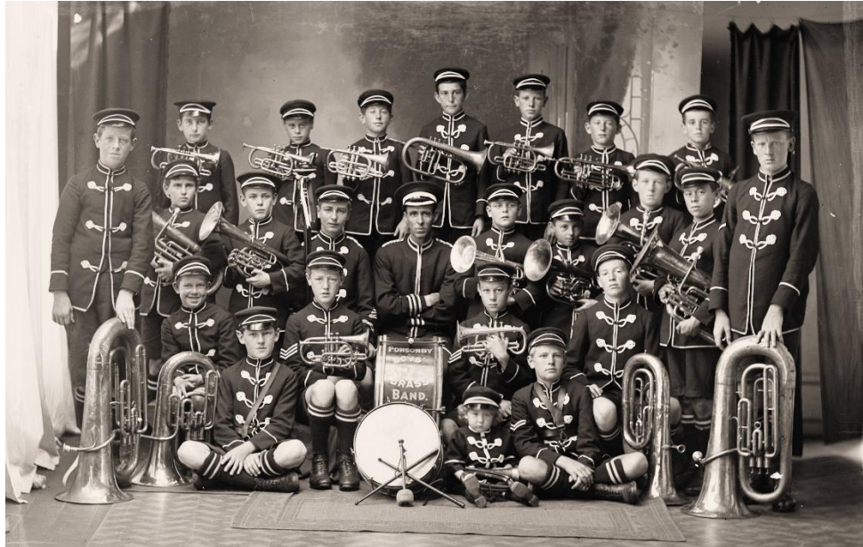
Ponsonby Boys Brass Band – unknown date