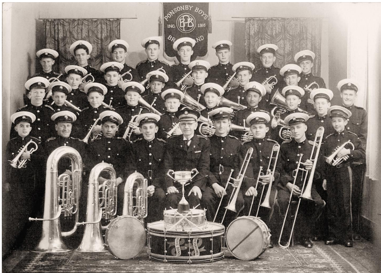
Ponsonby Boys' Brass Band – 1948

The Young Atarrana League bandsmen arrived today by the Marama. The lads were played ashore by the Ponsonby boys' band. The two bands then marched to the Town Hall, where the visitors were accorded a civic reception. A round of outings has been arranged.