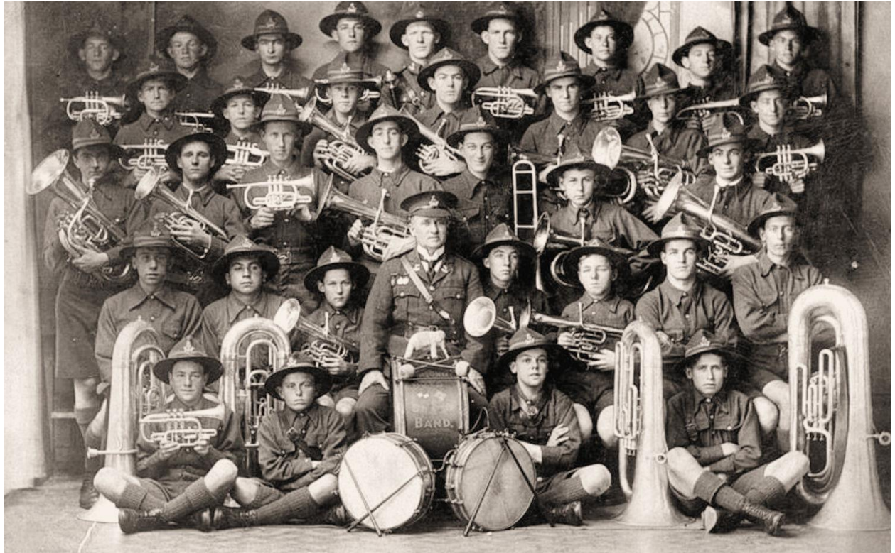
Ponsonby Boys' Brass Band – 1922/23