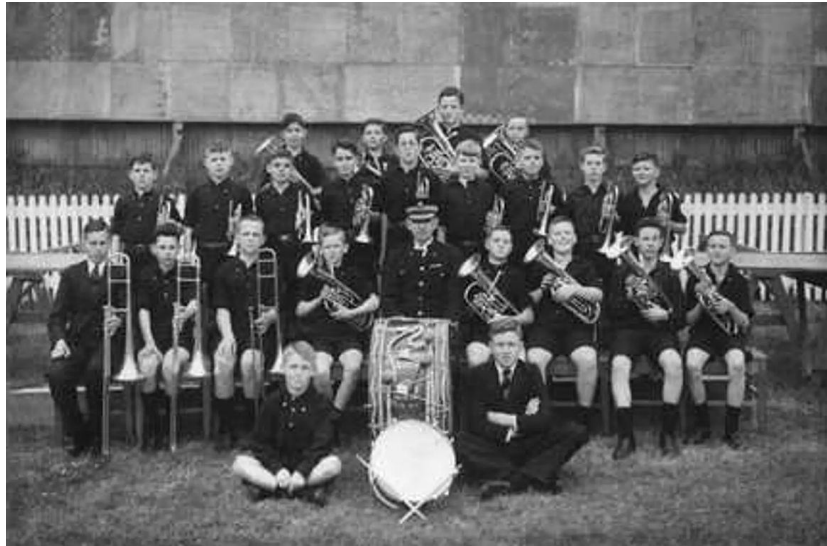
Ponsonby Boys' Brass Band – unknown date