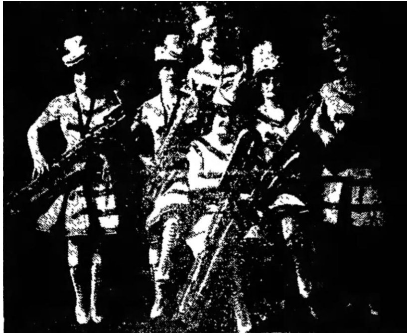
The Six Royal Hussars, January 1916