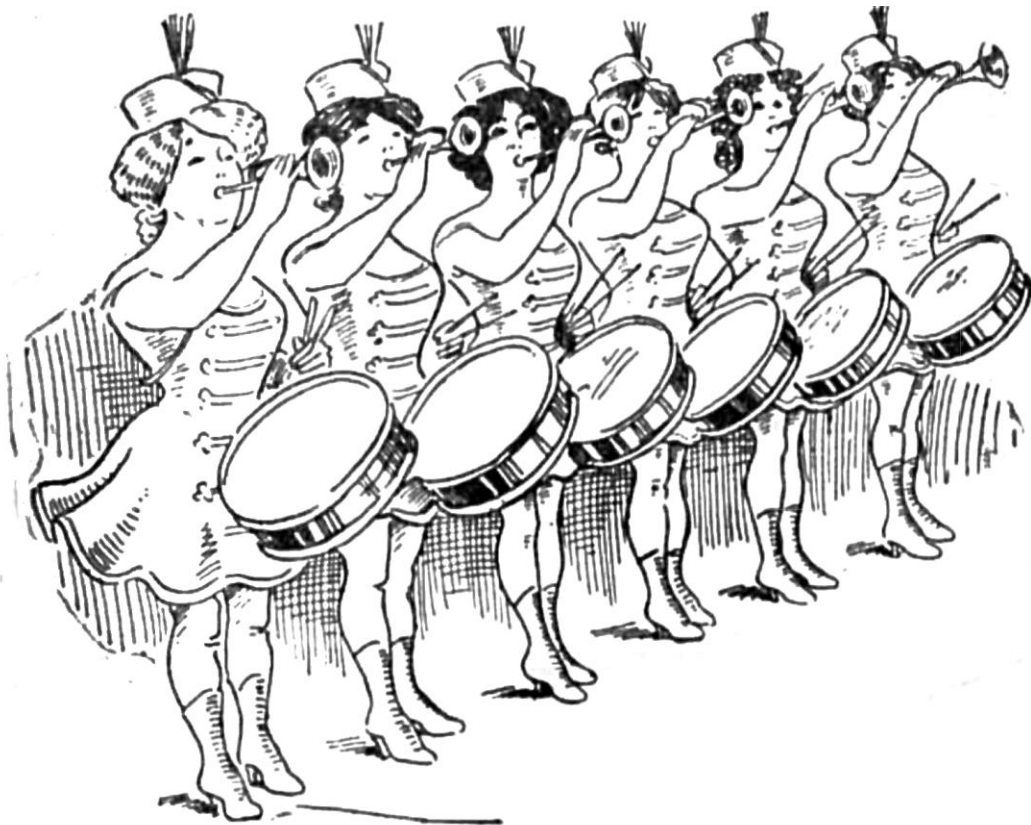
The Six Royal Hussars