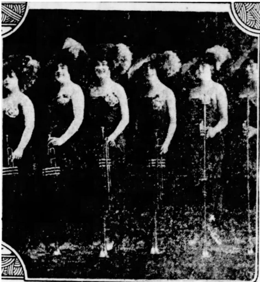
The Six Royal Hussars, August 1919