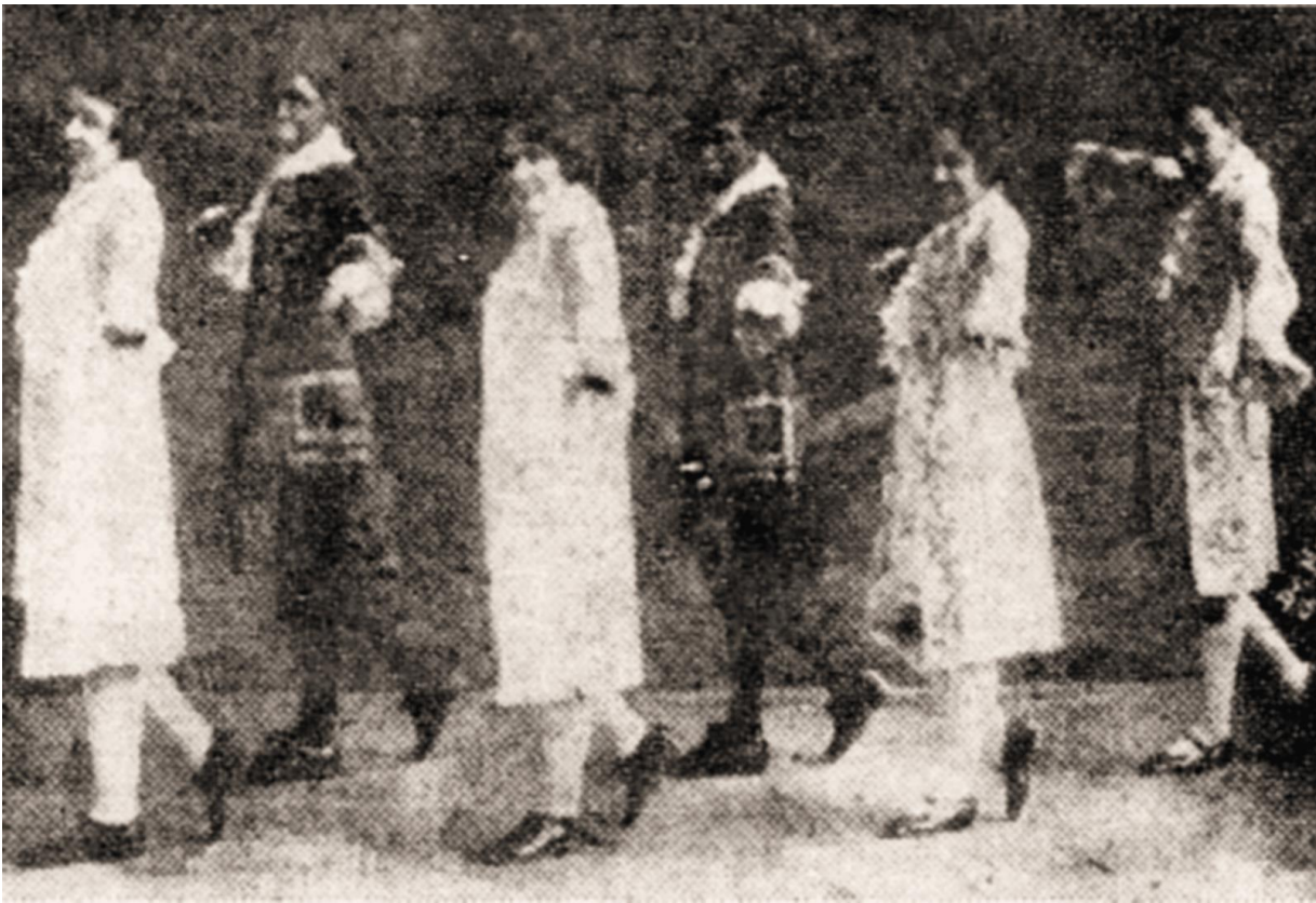
The last photo of the Six Royal Hussars, February 1921