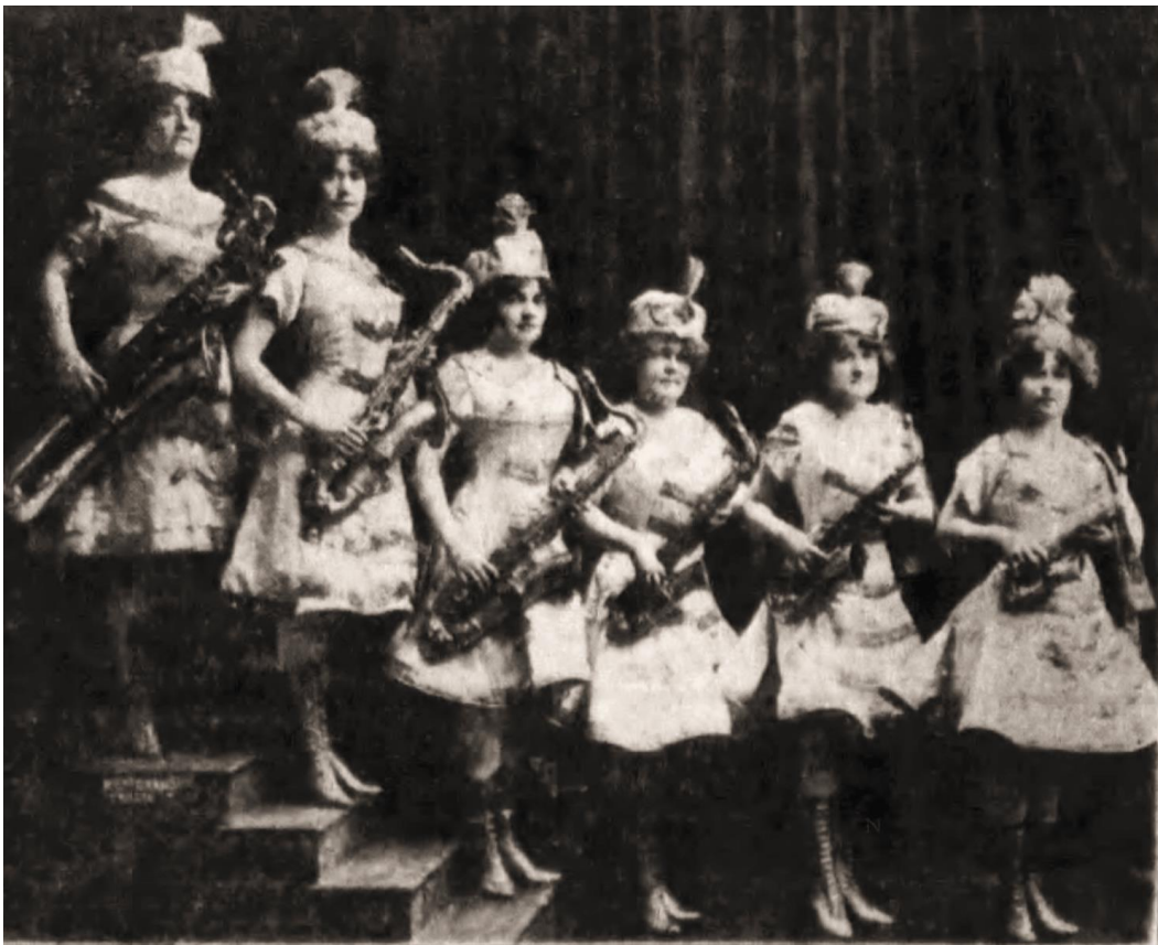
The Six Royal Hussars, October 1915