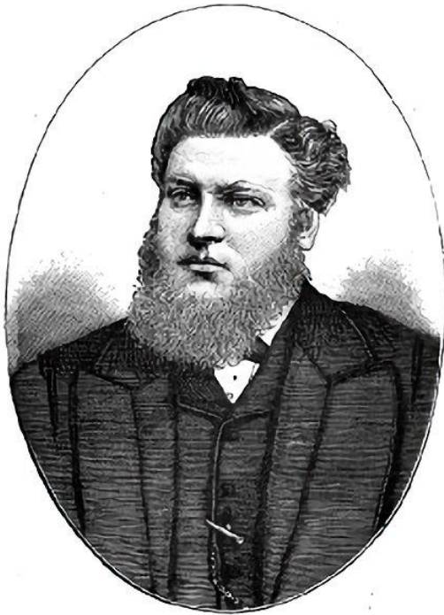
Joseph – illustration from “Stray Leaves”