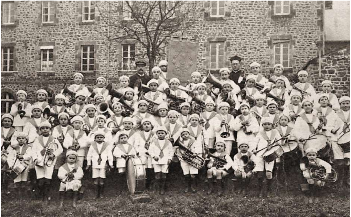
Note – these two photographs are slightly different from each other