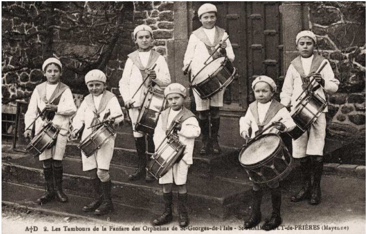
A+D 2. Les Tambours de la Fanfare des Orphelins de St-Georges-de-l'Isle - St-JAMES-BOLT-de-PRIÈRES (Mayer.ne)