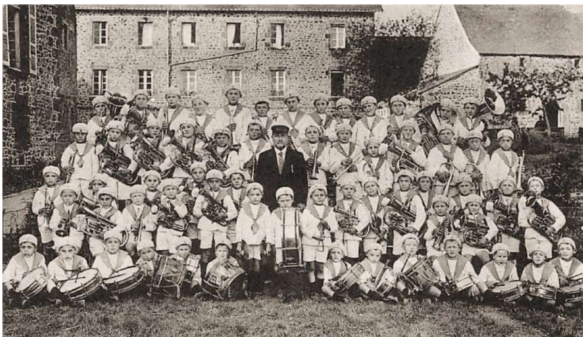
Fanfare des Petits Orphelins de St-Georges-de-Lisle à ST-FRAIMBAULT-de-PRIÈRES (Mayenne)