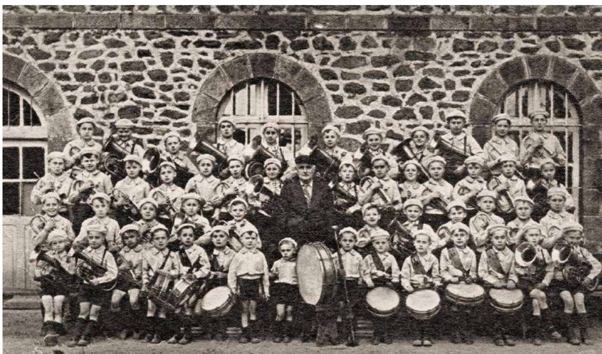
Fanfare des « Petits Orphelins de Saint-Georges-de-Lisle » (55 Enfants de 4 a 13 ans) à SAINT-FRAIMBAULT-de-PRIÈRES (La Mayenne)