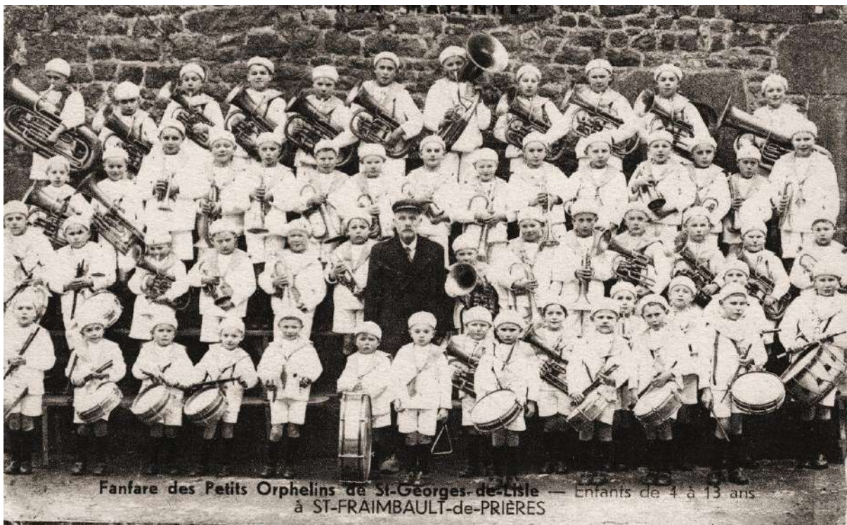
Fanfare des Petits Orphelins de St-Georges-de-Lisle — Enfants de 4 à 13 ans à ST-FRAIMBAULT-de-PRIÈRES