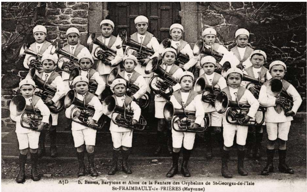
A†D B. Basses, Barytons et Altos de la Fantare des Orpheins de St-Georges-de-l'Isle St-FRAIMBAULT-de-PRIÈRES (Mayenne)