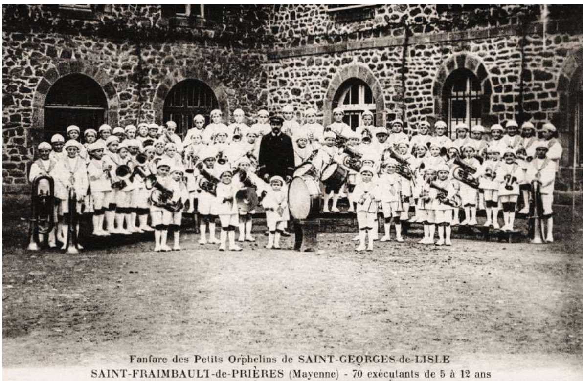
Fanfare des Petits Orphelins de SAINT-GEORGES-de-LISLE SAINT-FRAIMBAULT-de-PRIÈRES (Mayenne) - 70 exécutants de 5 à 12 ans