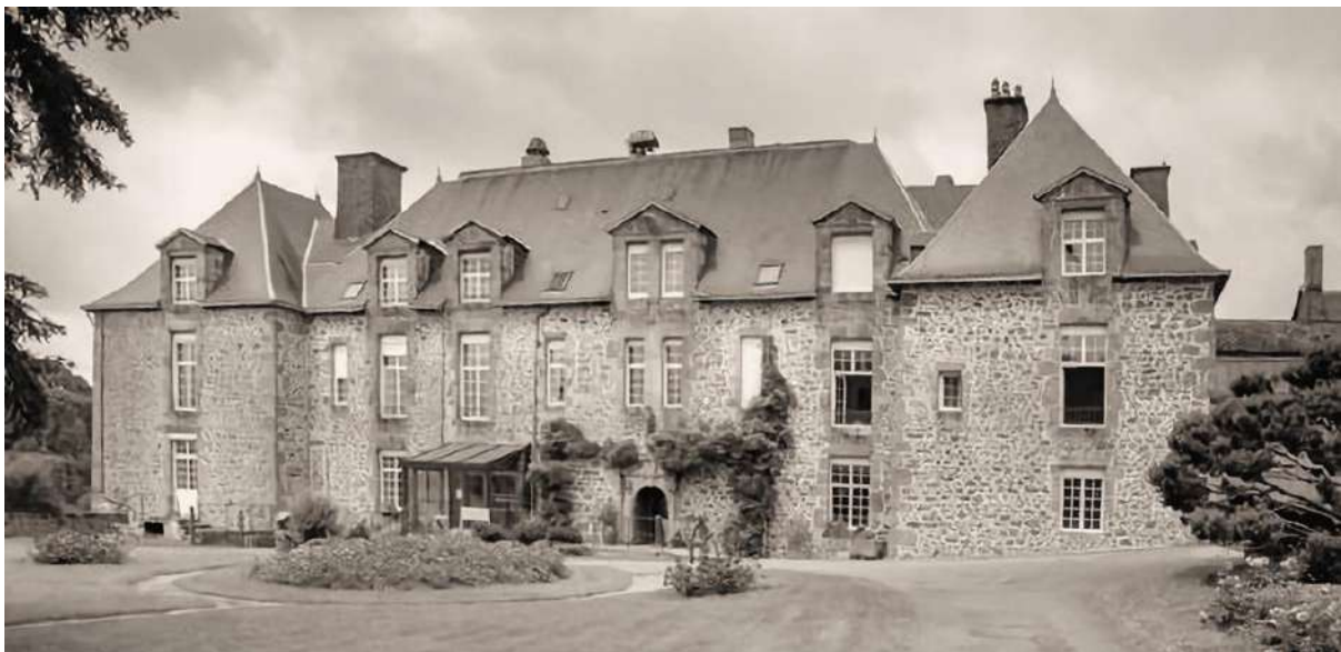
Château de l'Isle

The band disbanded following the death of Pierre Jouanne in 1957, but over a thousand boys had been trained by him over the previous 32 years.