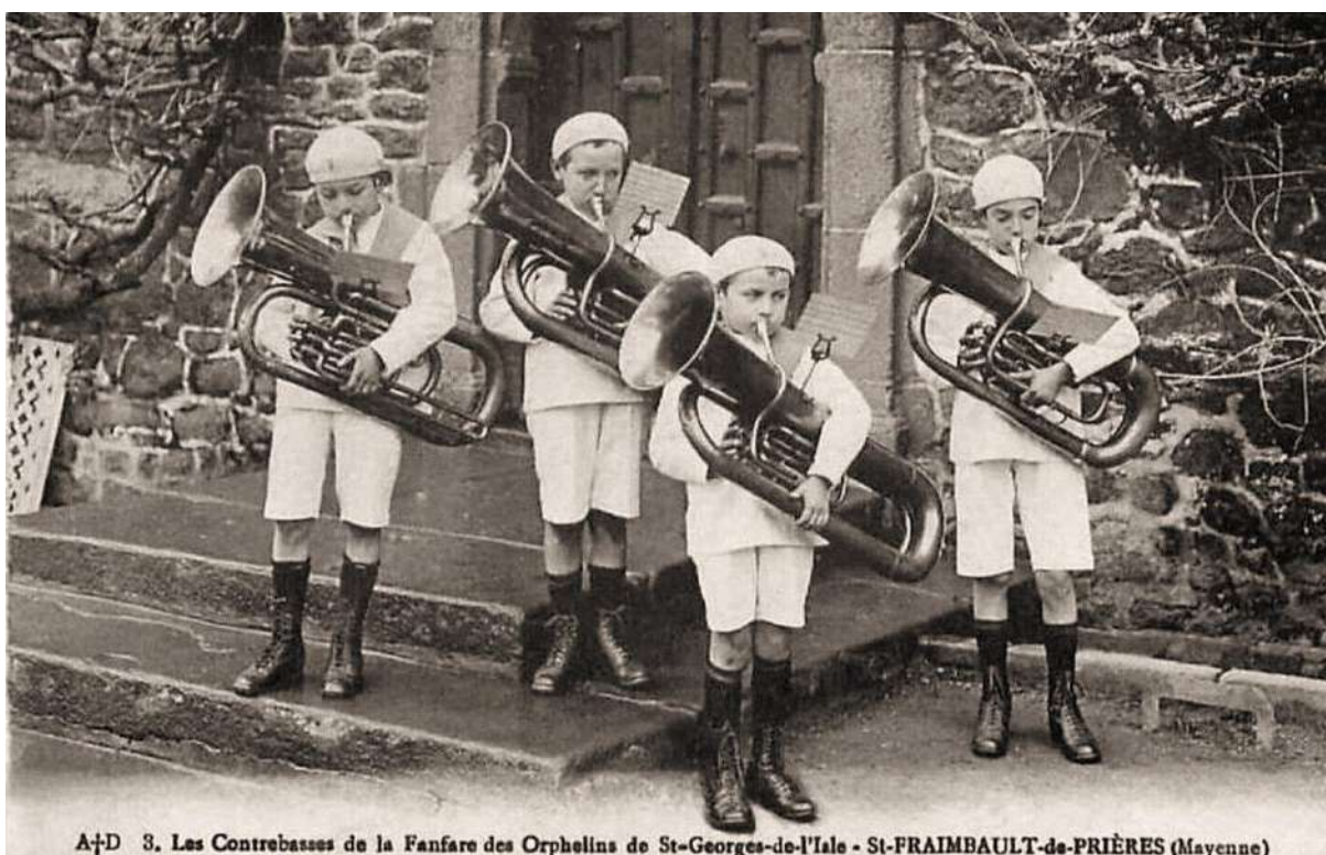
A+D 3. Les Contrebasses de la Fanfare des Orphelins de St-Georges-de-l'Isle - St-FRAIMBAULT-de-PRIÈRES (Mayenne)