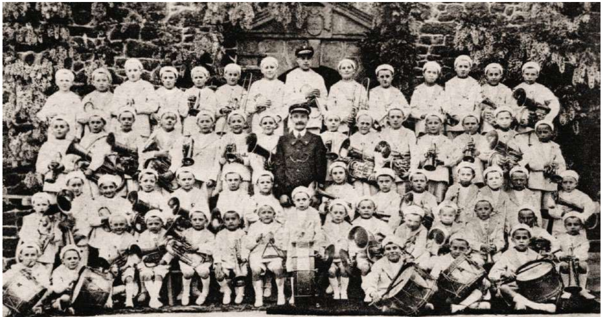
La Fanfare des Petits Orphelins de St-Georges-de-Lisle - St-FRAIMBAULT-de-PRIÈRES (Mayenne)