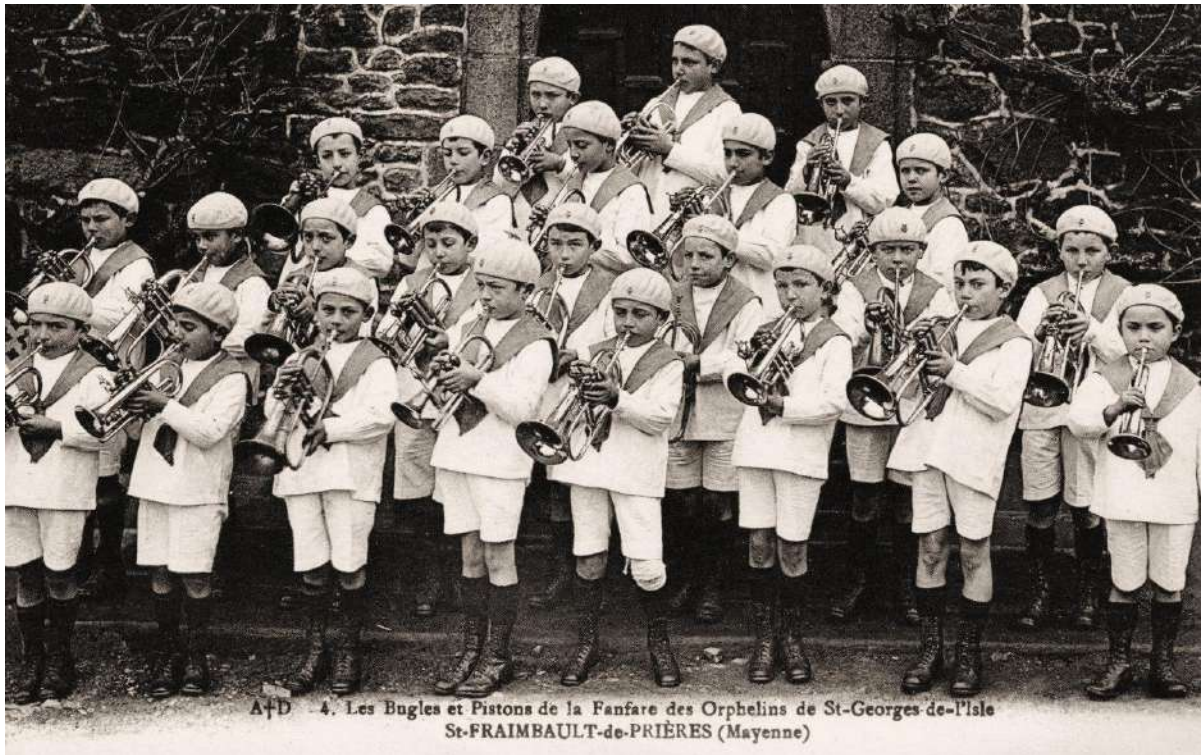
A+D -4. Les Bugles et Pistons de la Fanfare des Orphelins de St-Georges-de-l'Isle St-FRAIMBAULT-de-PRIÈRES (Mayenne)