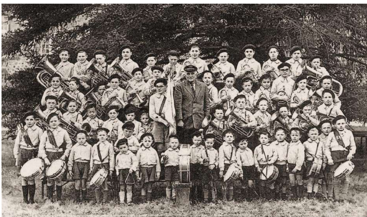
« Fanfare des Orphelins de St-Georges de Lisle » — SAINT-FRAIMBAULT DE PRIÈRES (Mayenne) 55 exécutants de 4 à 14 ans