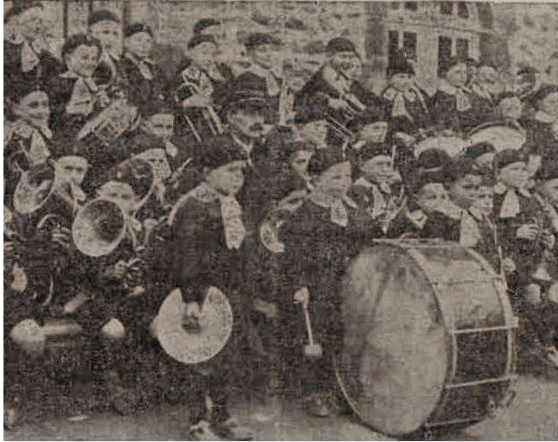
The band at Saumur, June 1932

The band played a wide range of music including the finale of Beethoven's 9 th Symphony; the March, Prayer and Chorus from Mozart's Magic Flute; Gluck's March of Alceste; etc.