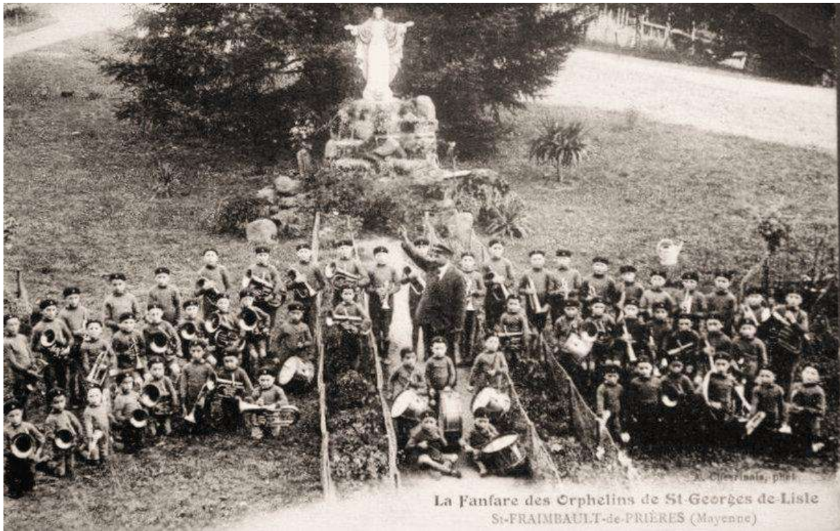
A. Chevrinols, 1911 La Fanfare des Orphelins de St-Georges de Lisle St-FRAIMBAULT-de-PRIÈRES (Mayenne)