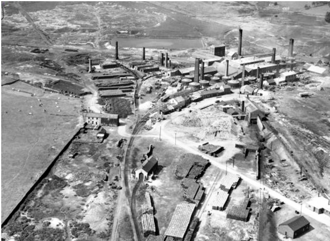
The iron works site from the air in 1947