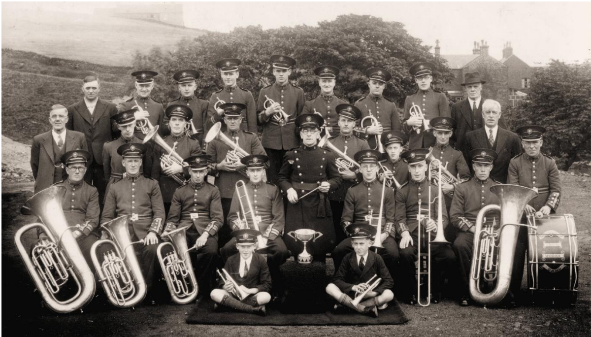
Hepworth Ironworks Band, 1950 – shortly before its end