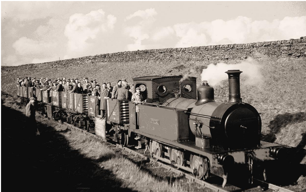
One of the excursion trains to/from the ironworks