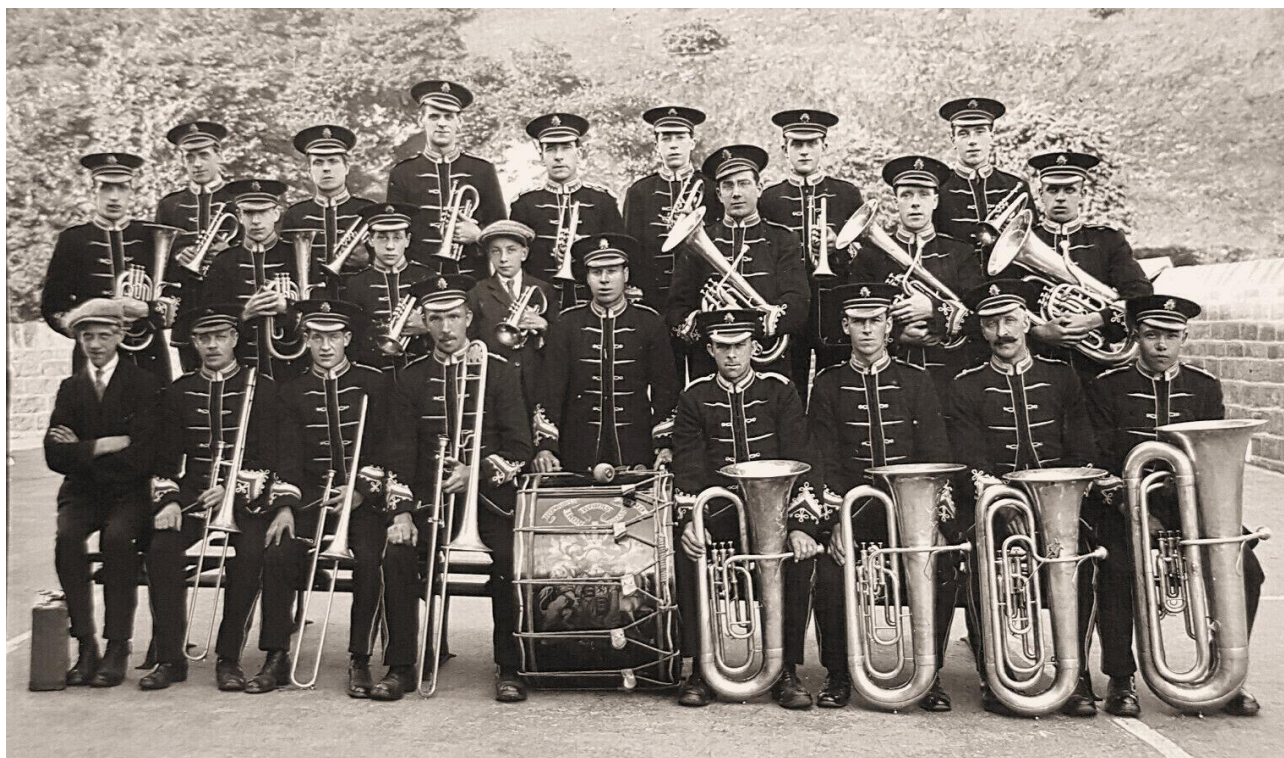
Hepworth Ironworks Band, c. 1915

The Hepworth Ironworks Band disbanded in 1950.