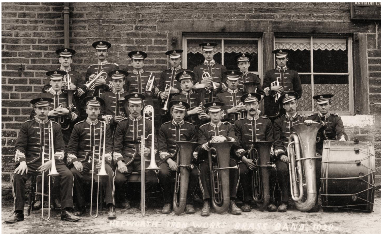
Hepworth Ironworks Band, 1920