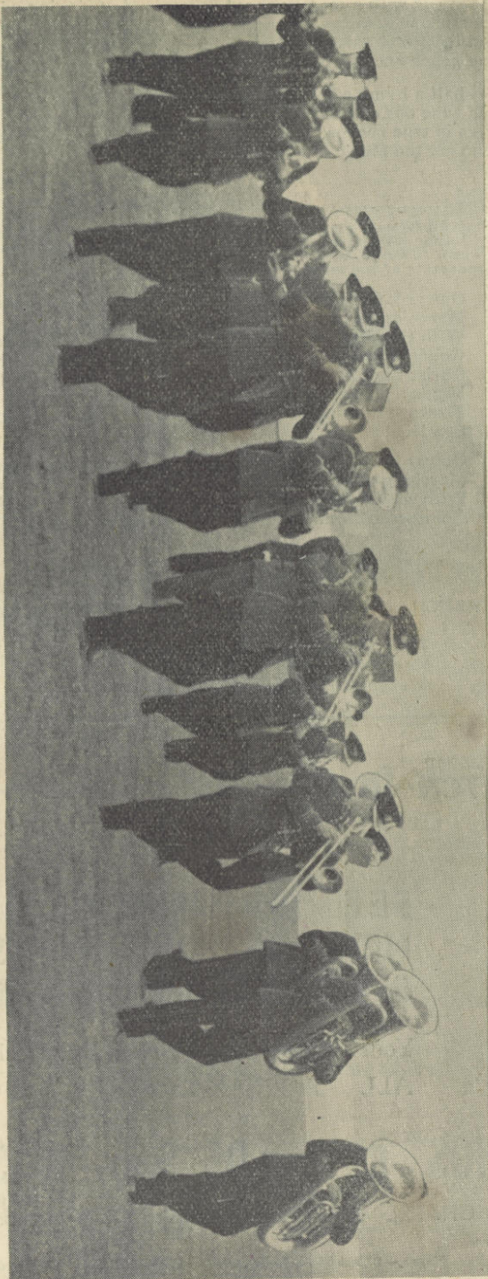
A Competing Band in the Belle Vue Marching Contest.

THE Brass Bands of Britain are a national institution — in entertainment, duty, and ceremony — in gladness or sorrow, or in the cause of charity. They are composed almost entirely of working men, who regard the playing of an instrument as a sacred hobby. The progress of Brass Bands, particularly during the past twenty years, has been one of continual advancement, and a very high standard of musicianship has been attained.