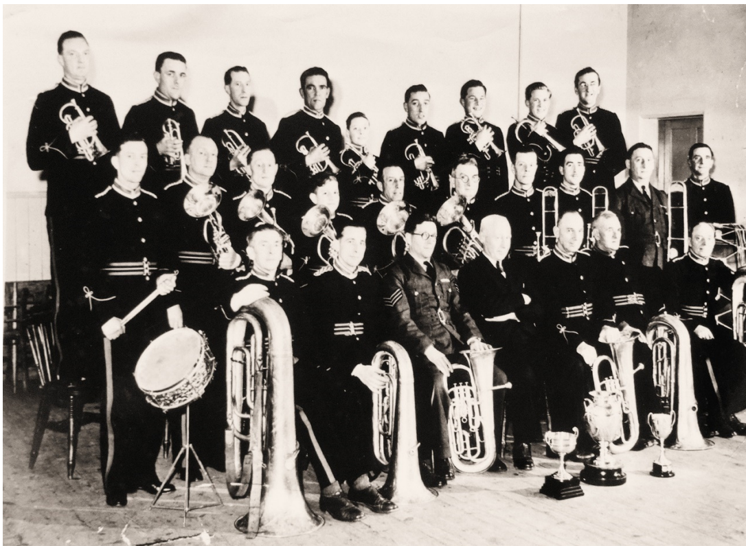
Cottingham Brass Band – 1946