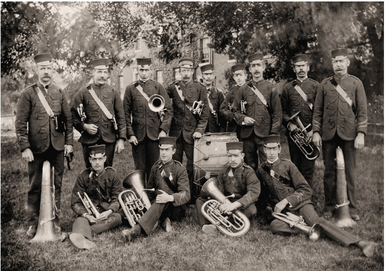
Cottingham Model Brass Band – 1902