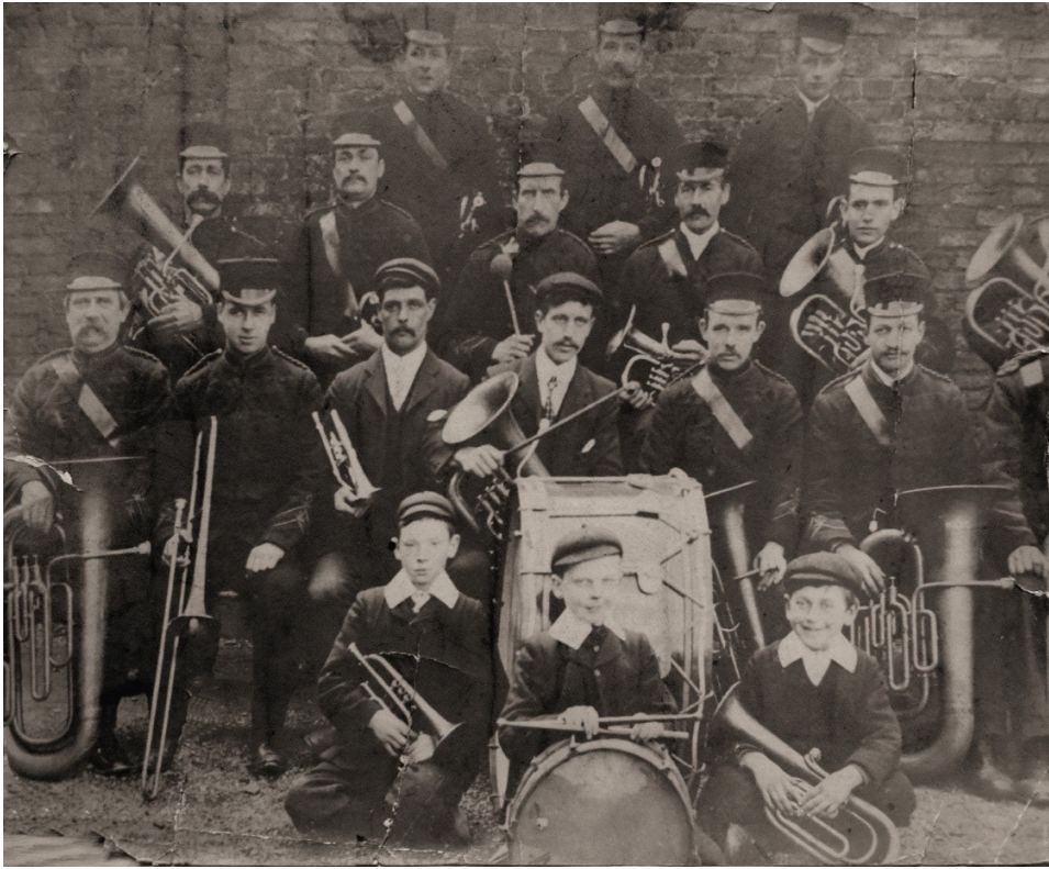
Cottingham Brass Band