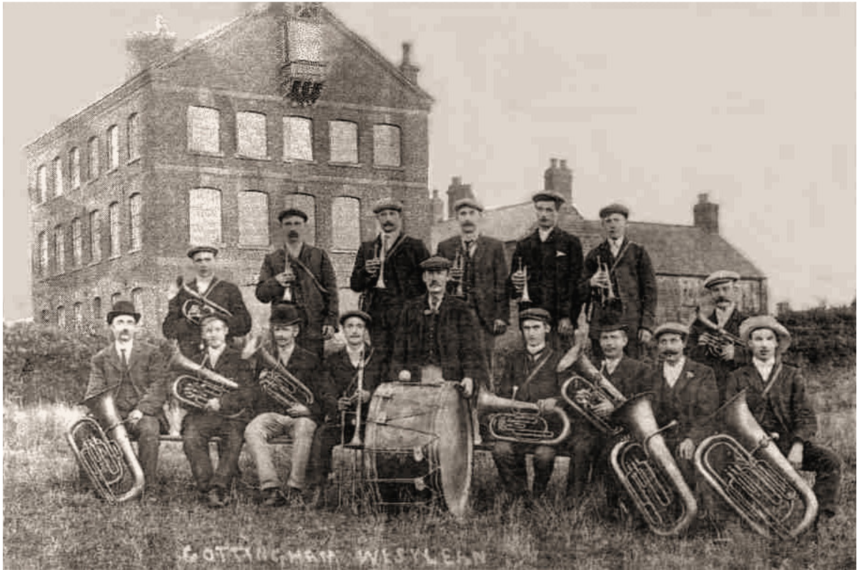
Cottingham Wesleyan Brass Band – in front of Wallis & Linnell's Clothing Factory