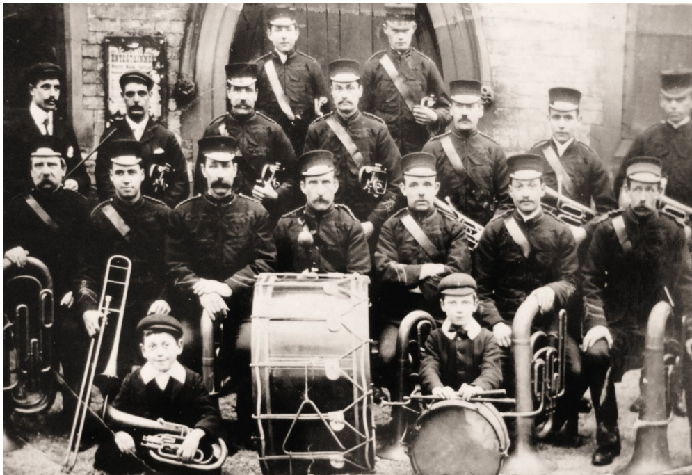
Cottingham Brass Band