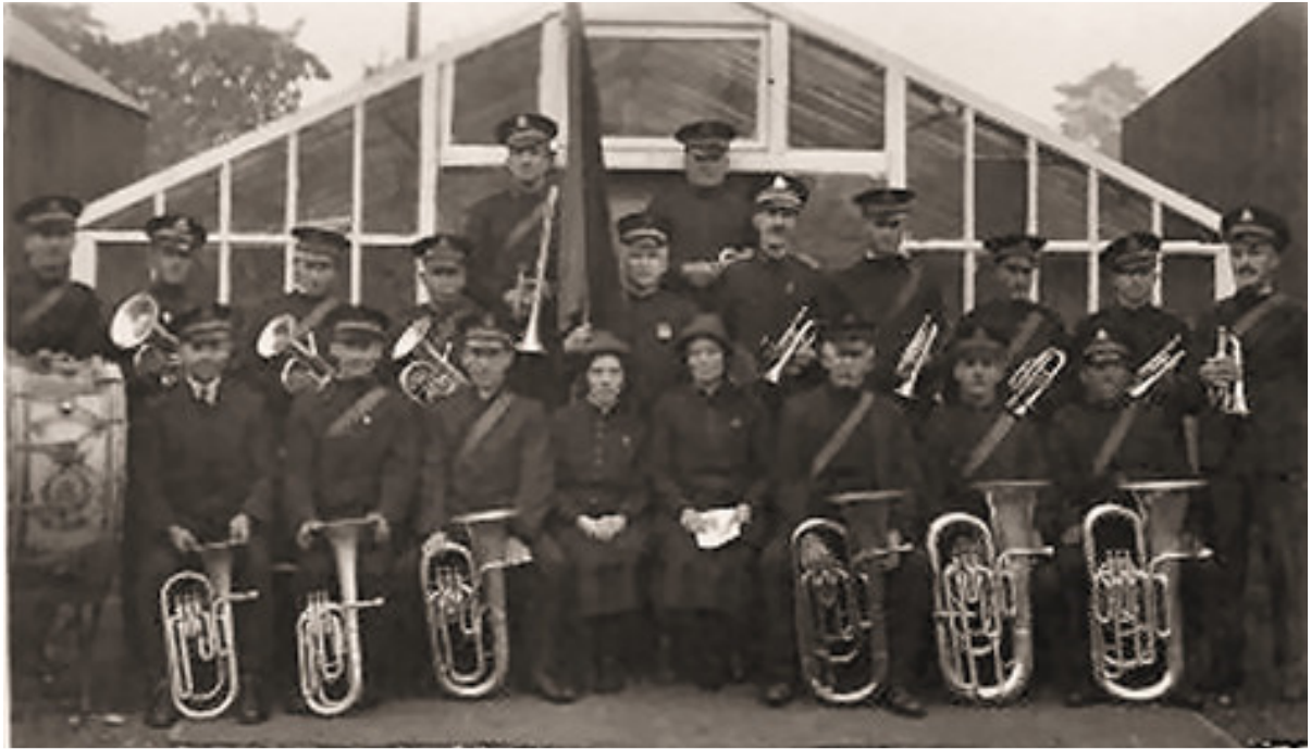
Cottingham Salvation Army Brass Band – 1931