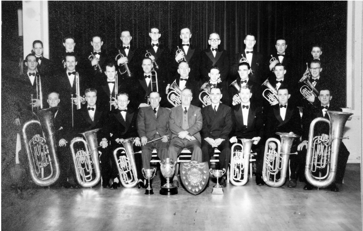
Cottingham Brass Band – 1959