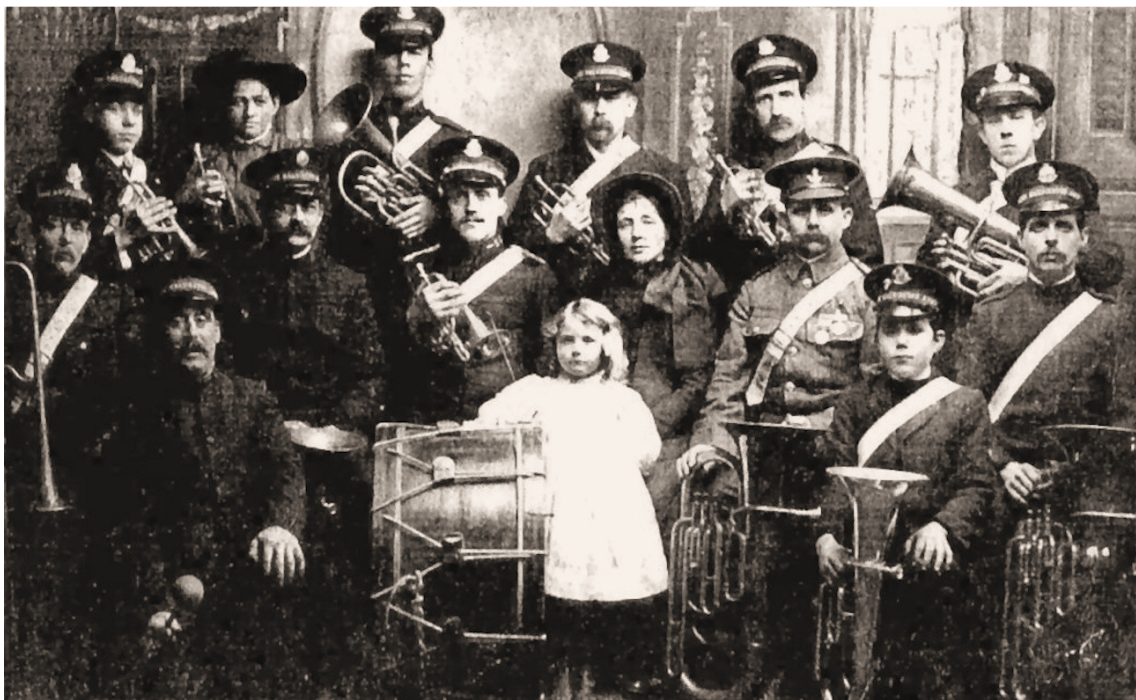
Cottingham Salvation Army Brass Band – 1915