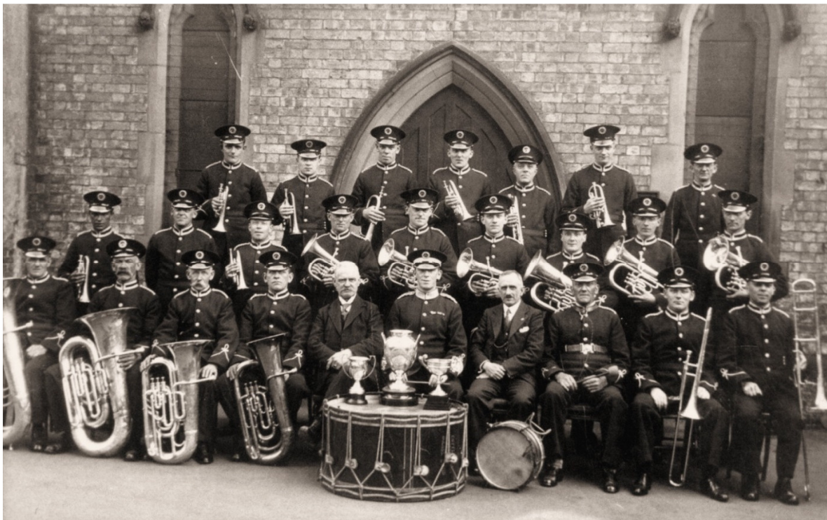
Cottingham Brass Band