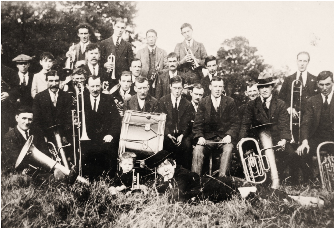
Cottingham Brass Band – 1928