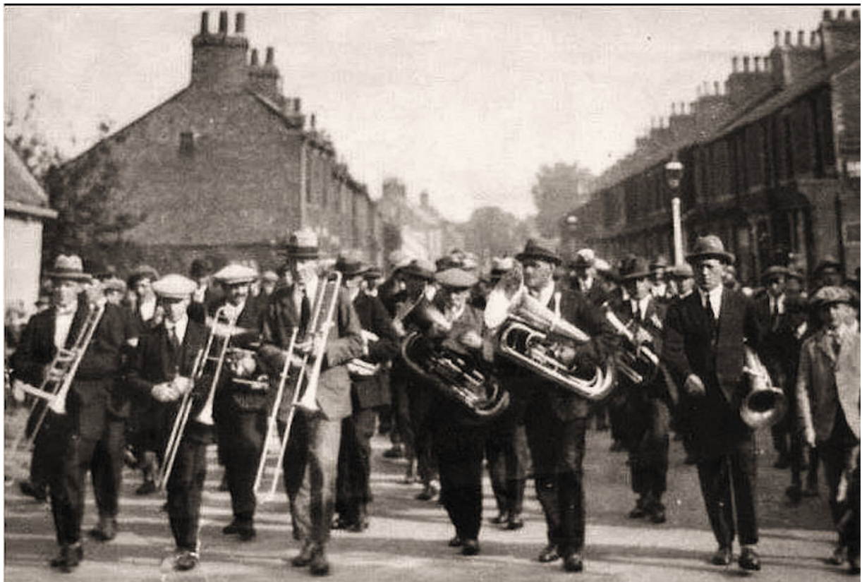
Cottingham Brass Band – 1922