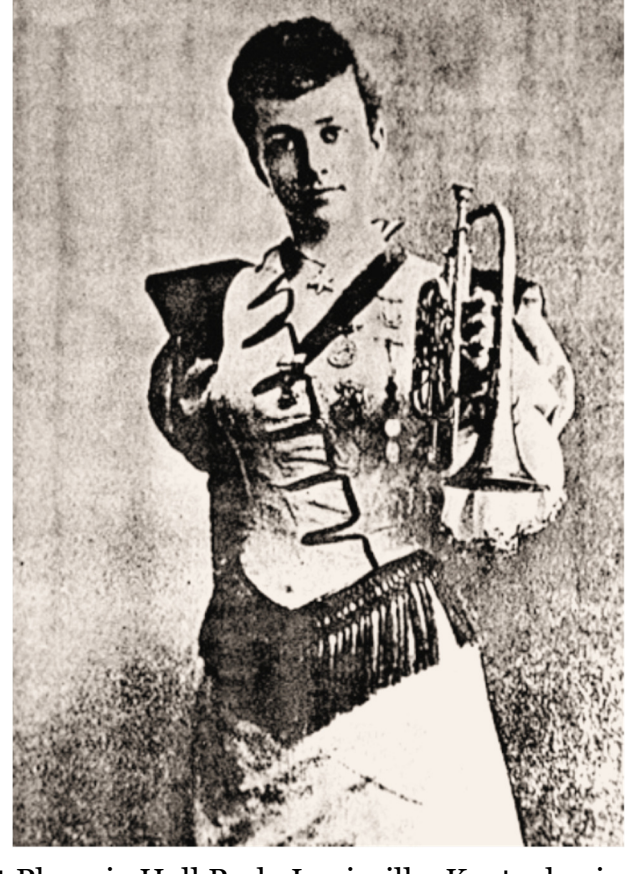
at Phoenix Hall Park, Louisville, Kentucky, in July 1889; Point of Pines, Massachusetts, in August 1890; the Opera House, Maysville,