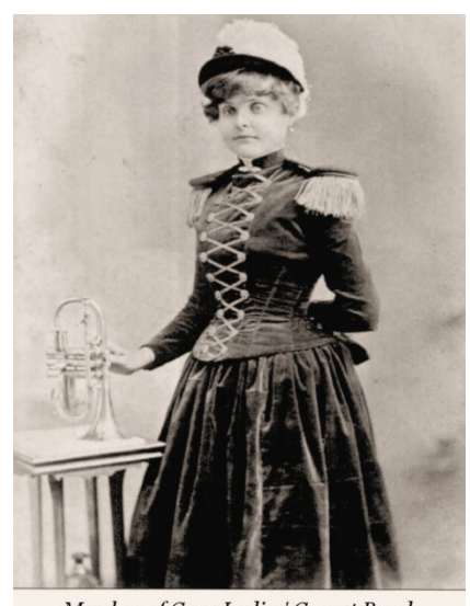
Member of Caro Ladies' Cornet Band