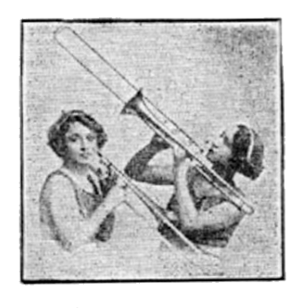
Trumpets, Trombones, Cornets, Saxophone, Euphonium, Posthorns, Accordeons, Aerobatic and Classical Dancing.