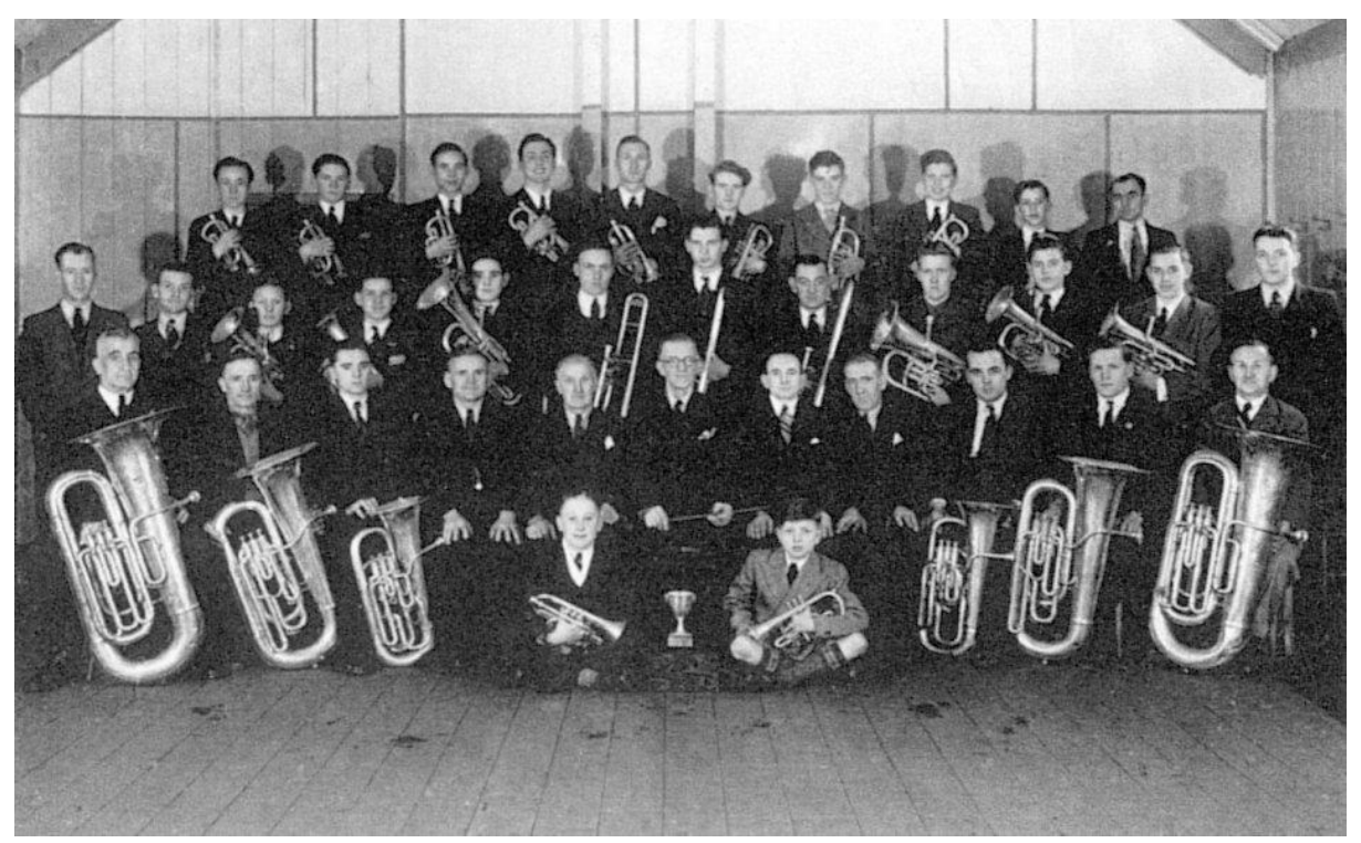
Tylorstown Workmen's Silver Prize Band, 1949