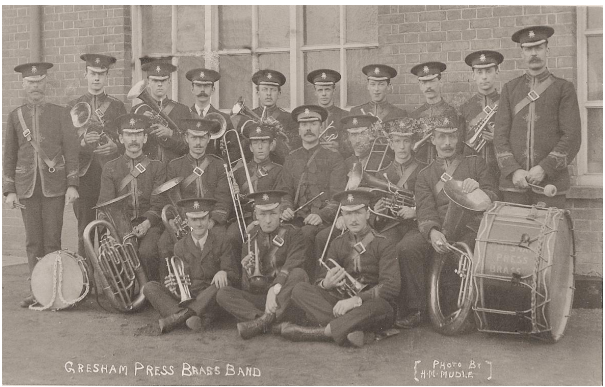
Gresham Press Brass Band