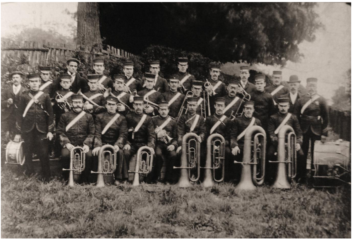
Barton Cycle Works Brass Band