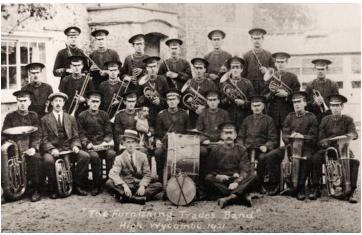
Ercol Furniture Company Band