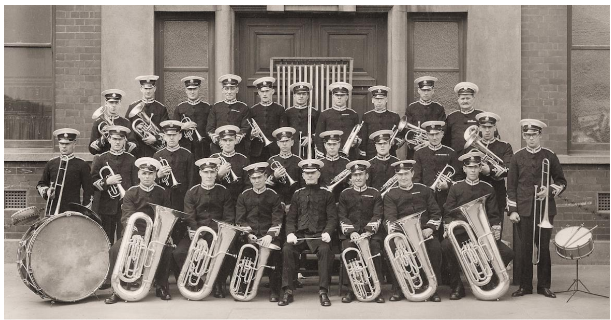
British Oil and Cake Mills Band

Aunt Bessie's East Yorkshire Brass Band (Hull, Yorkshire (East Riding))