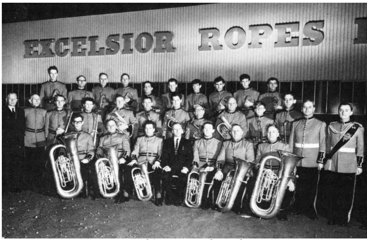
Excelsior Ropes Works Band