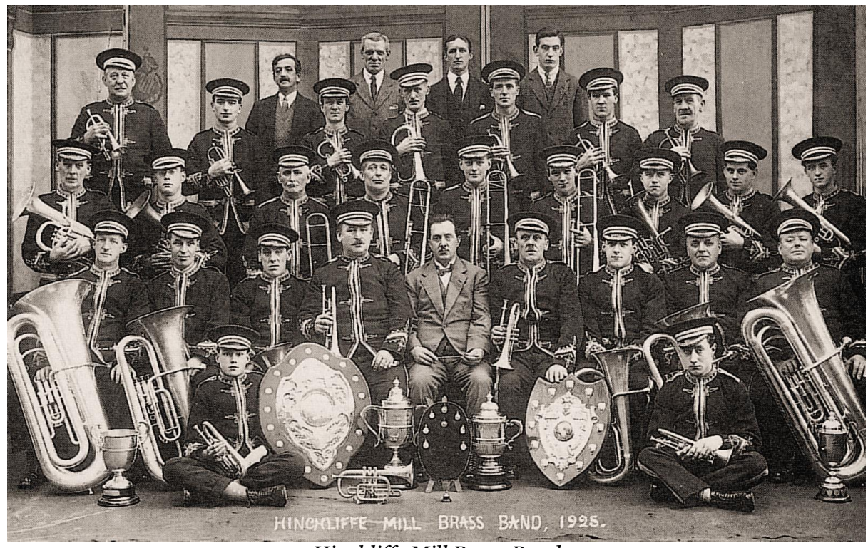
Hinchliffe Mill Brass Band

Akroyd's Brass Band (Halifax, Yorkshire (West Riding))