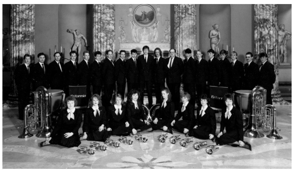
Britannia Airways Band