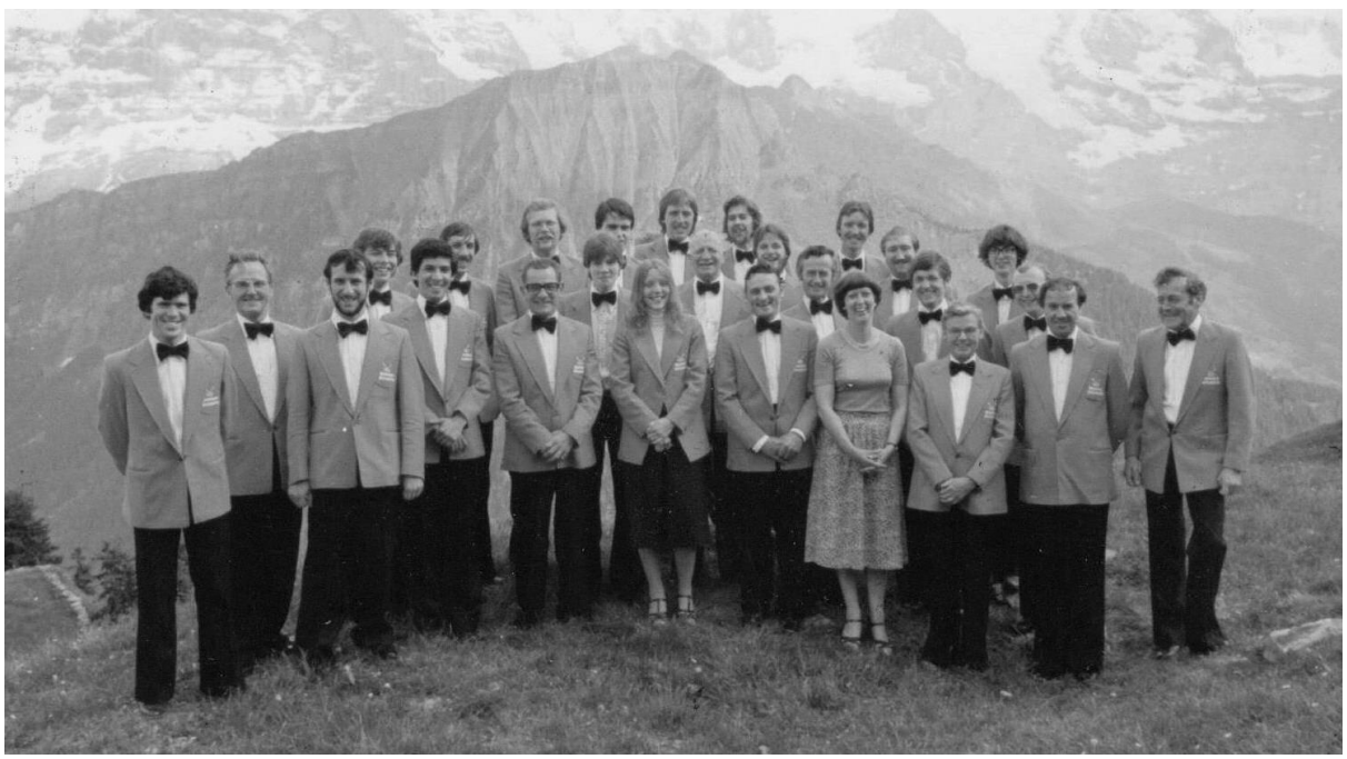
Hanwell (Roneo Vickers) Band