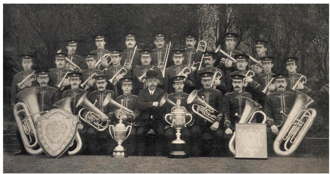
Perfection Soap Works Band