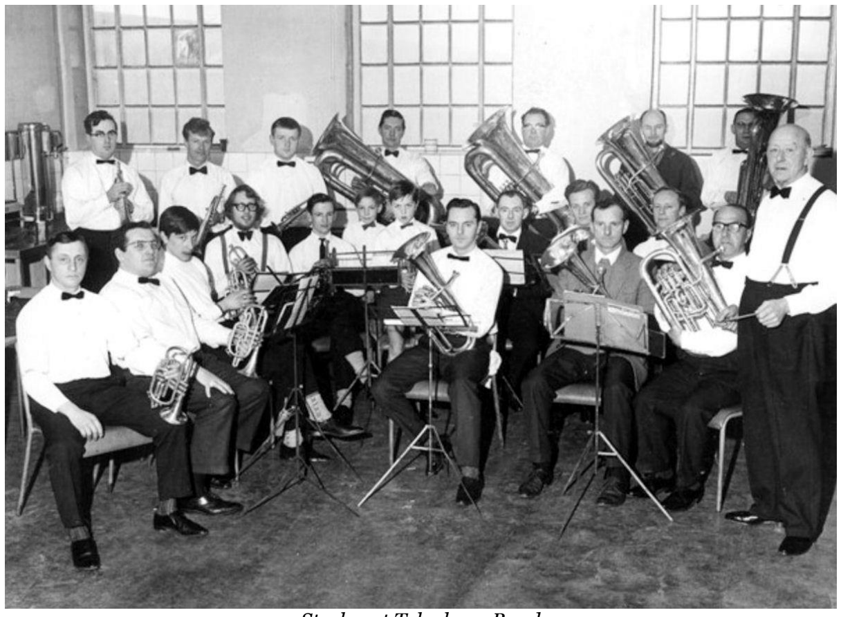
Stockport Telephone Band