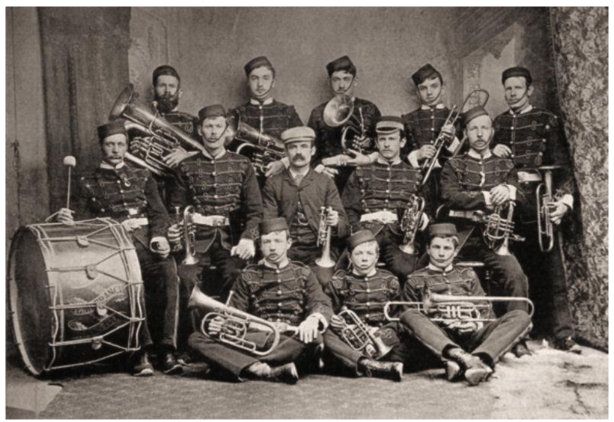
Threlkeld Granite Quarry Temperance Brass Band