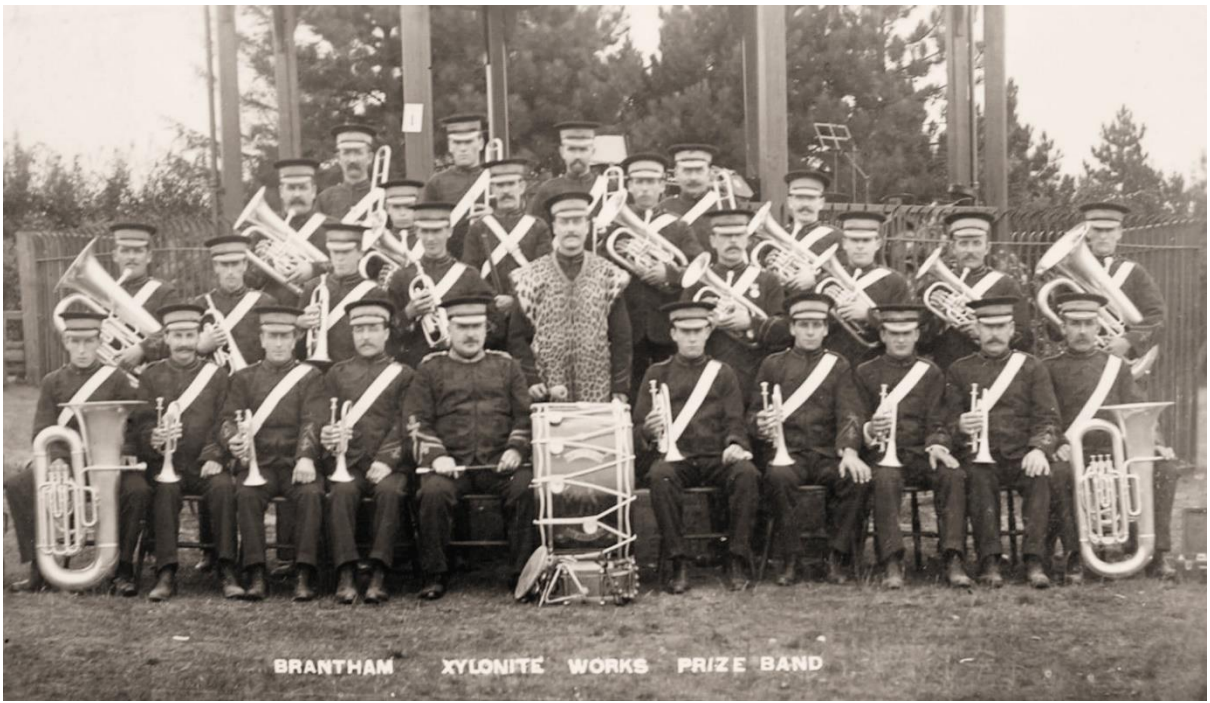
Brantham Xylonite Works Brass Band