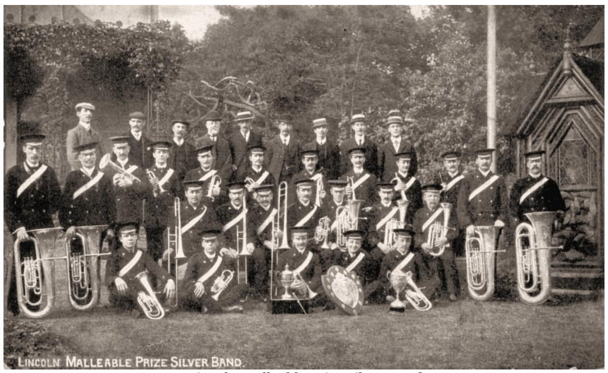
Lincoln Malleable Prize Silver Band