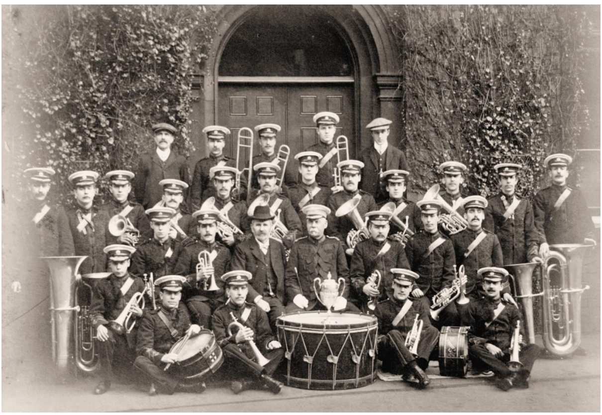
Ruston and Hornsby Band