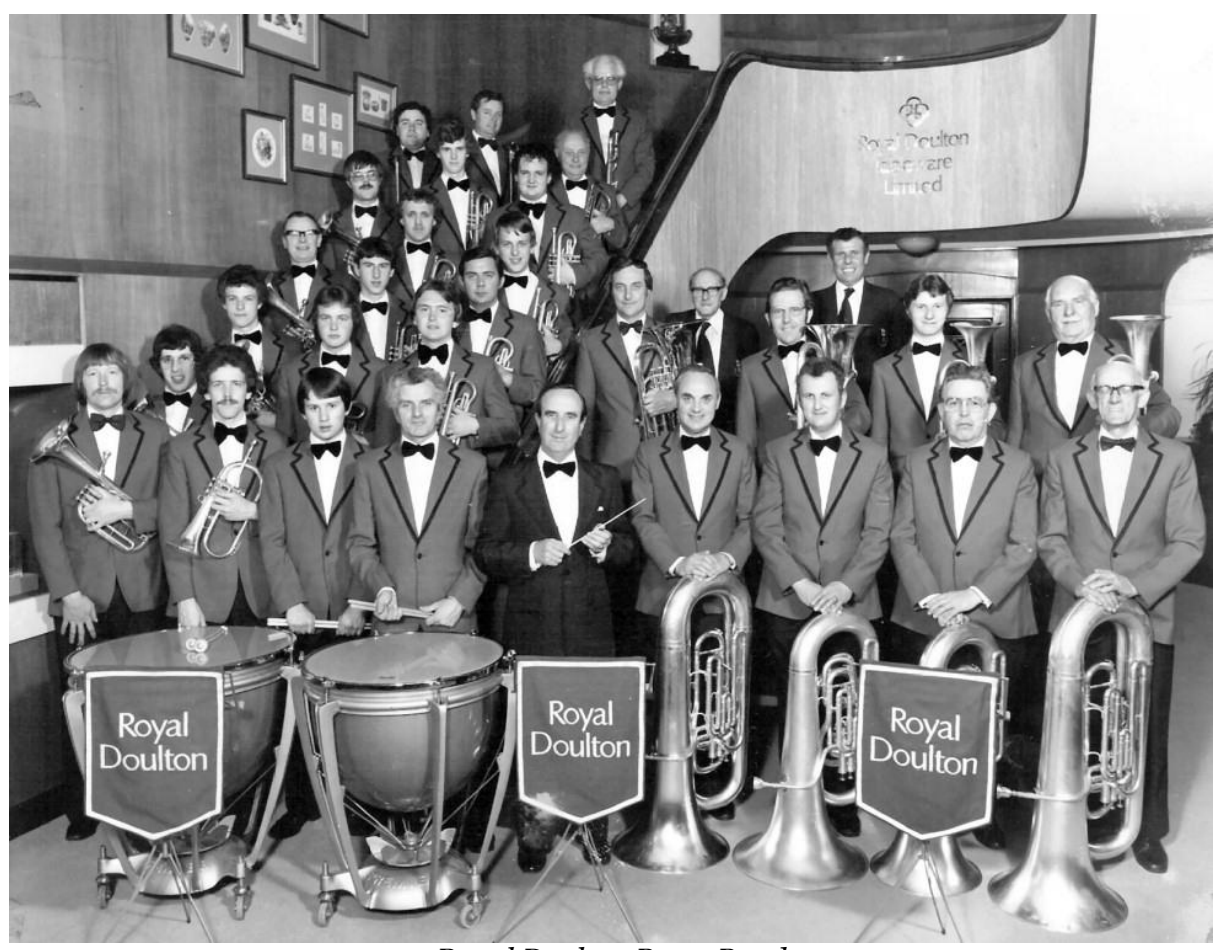
Royal Doulton Brass Band