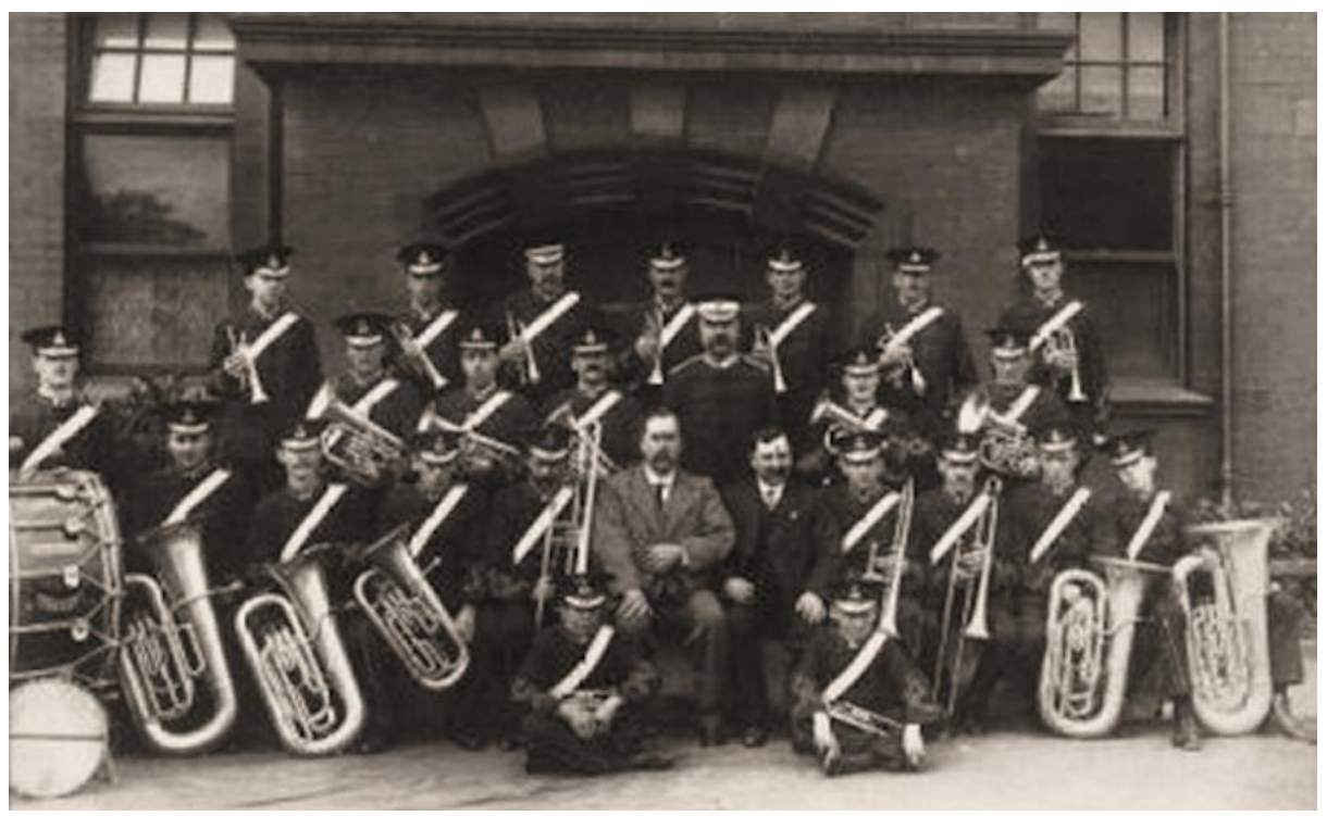
Vulcan Motor Works Brass Band