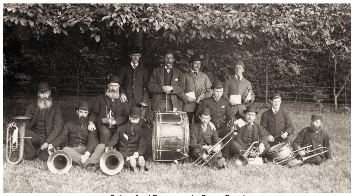
Beltonford Paperworks Brass Band

Apsley Mills Brass Band (1) (Hemel Hempstead, Hertfordshire)