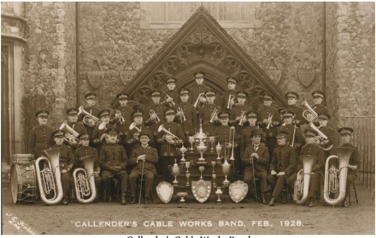
Callender's Cable Works Band