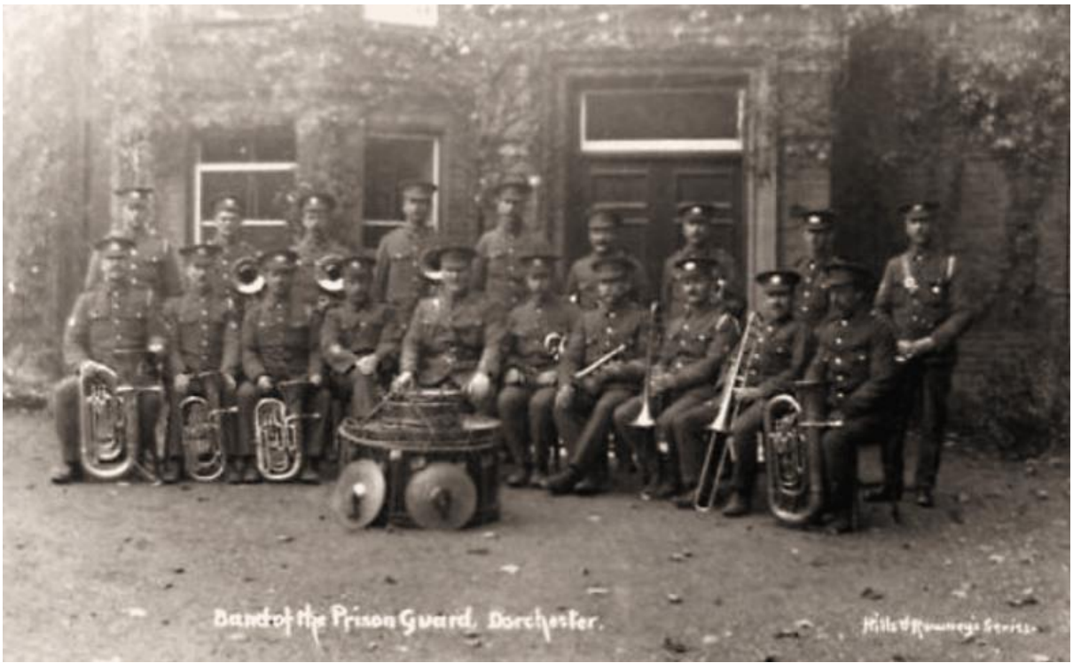
Band of the Prison Guard, Dorchester