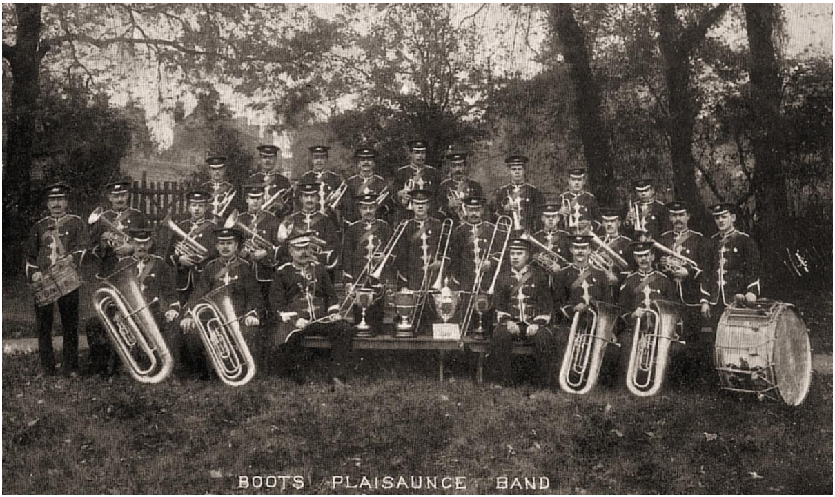
Boots Plaisaunce Band