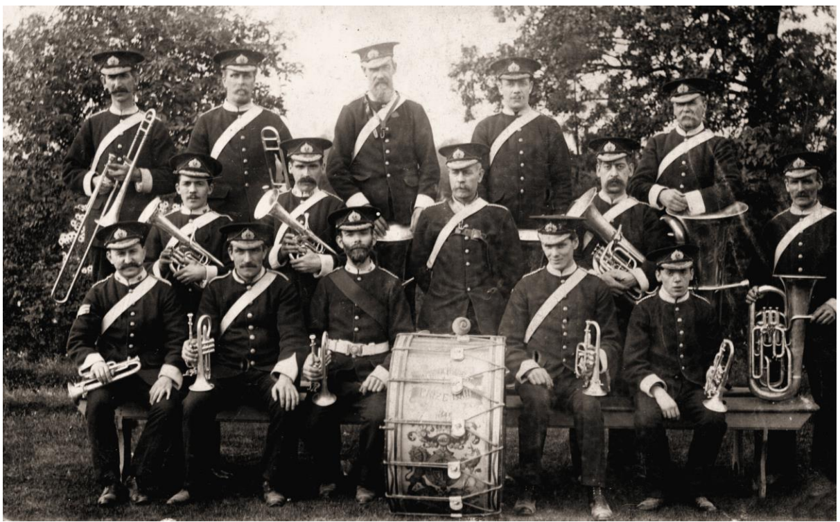
Verdin Adelaide Band, 1922