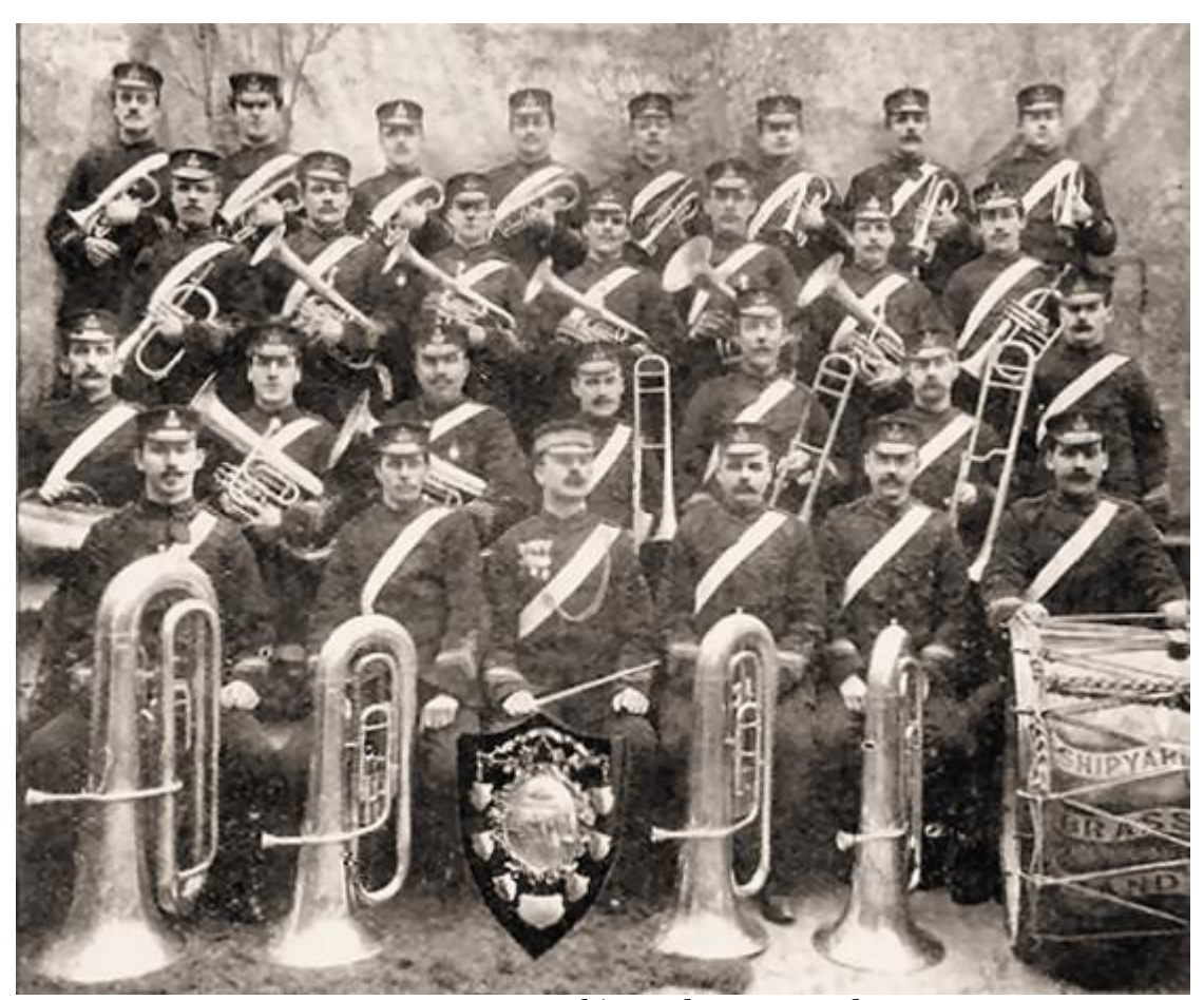
Barrow Shipyard Brass Band