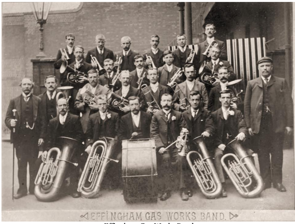
Effingham Gas Works Band

Adderley Street Gas Works Brass Band (Birmingham, Warwickshire)