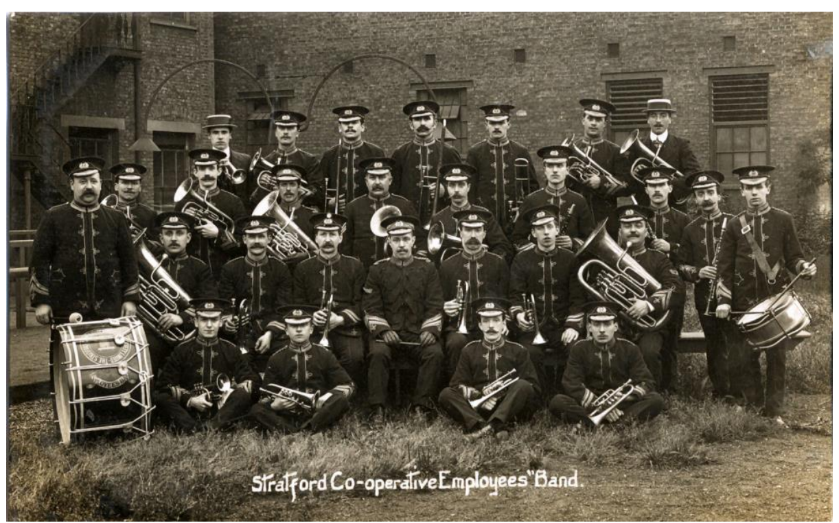
Stratford Co-operative Employees Band

Barnsley Co-operative Society Band (Yorkshire (West Riding))