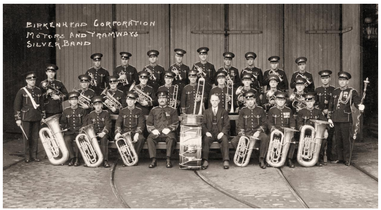
Birkenhead Corporation Motors and Tramways Silver Band