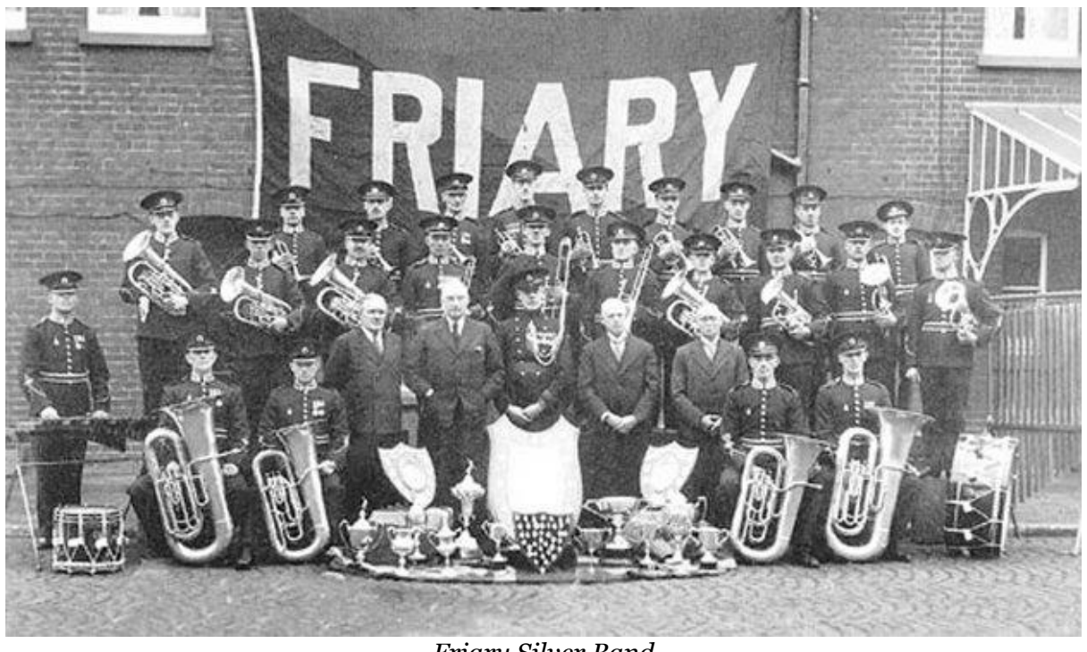
Friary Silver Band