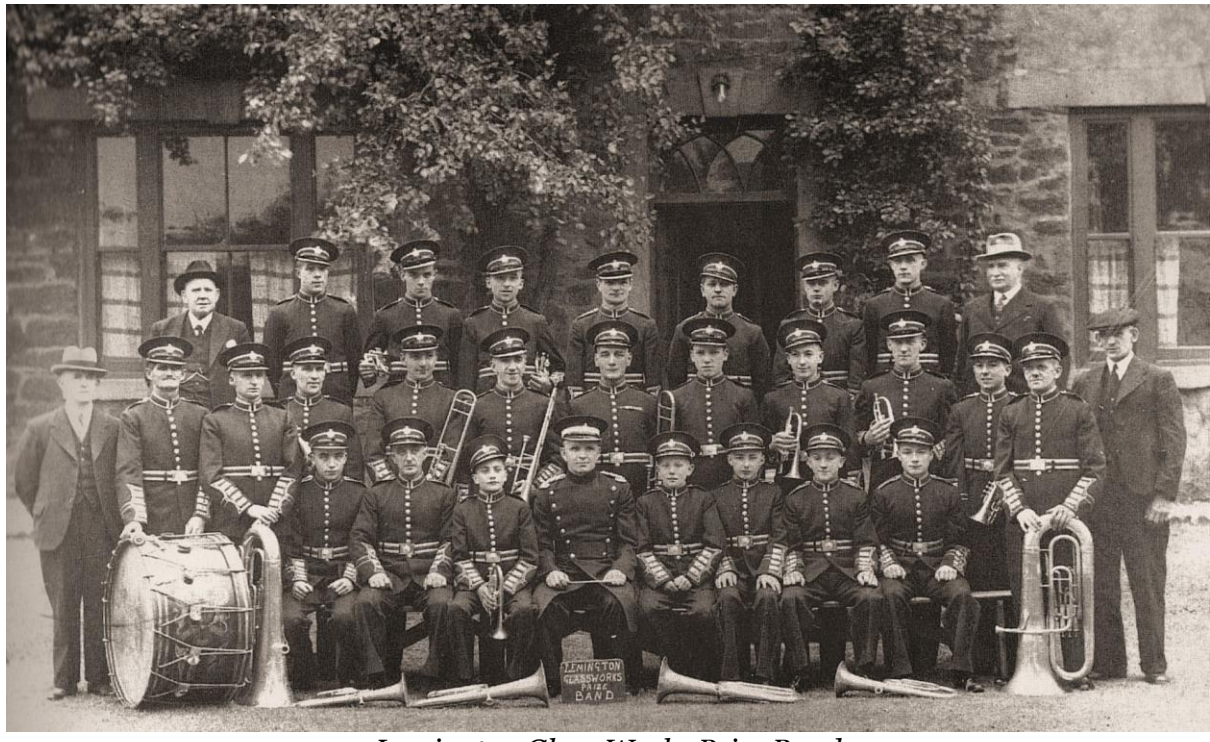
Lemington Glass Works Prize Band

Bagley's (Bottle Works) Brass Band (Yorkshire (West Riding))