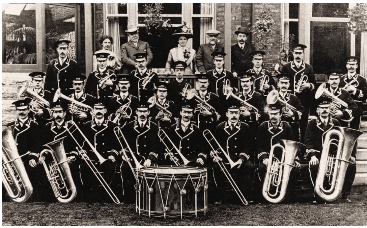
Unknown tannery brass band, Warrington