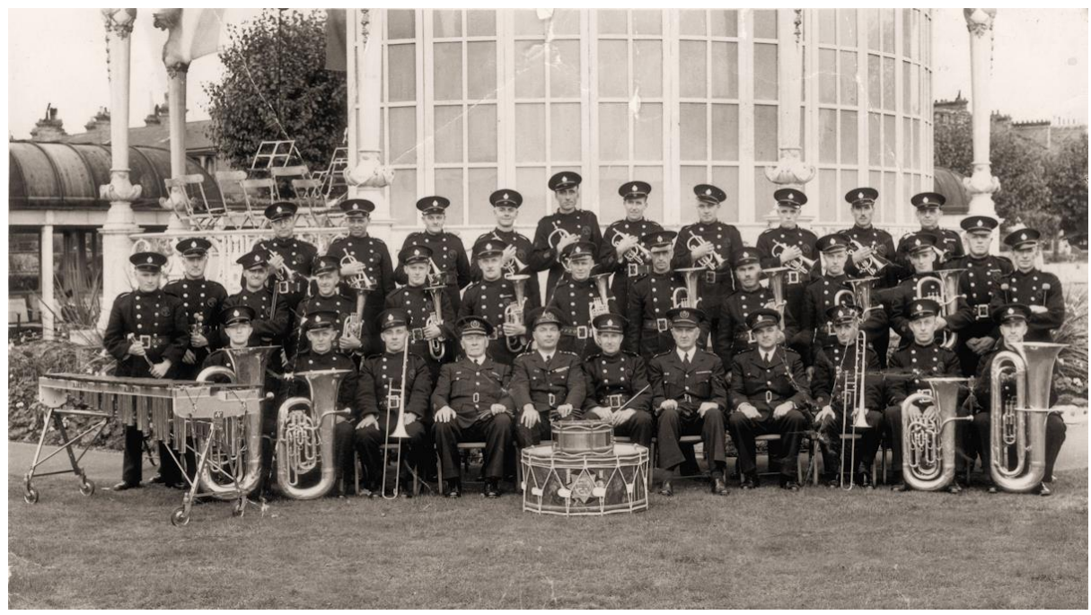
National Fire Service Band (11 Area, Southend)