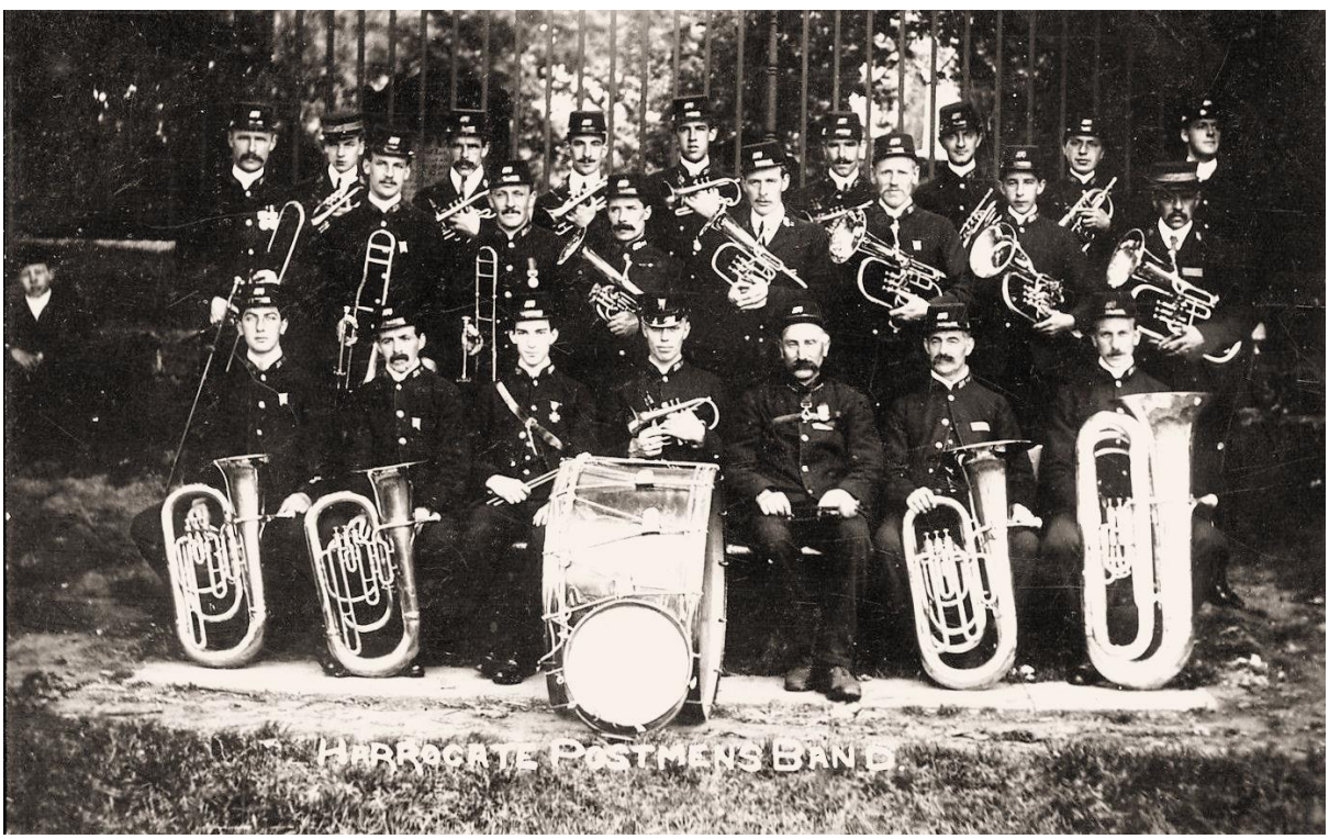
Harrogate Postmen's Band