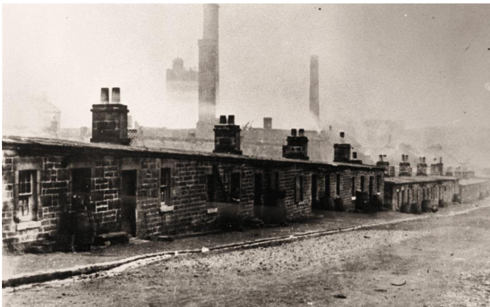
Workers' cottages in Flat Row behind the iron works