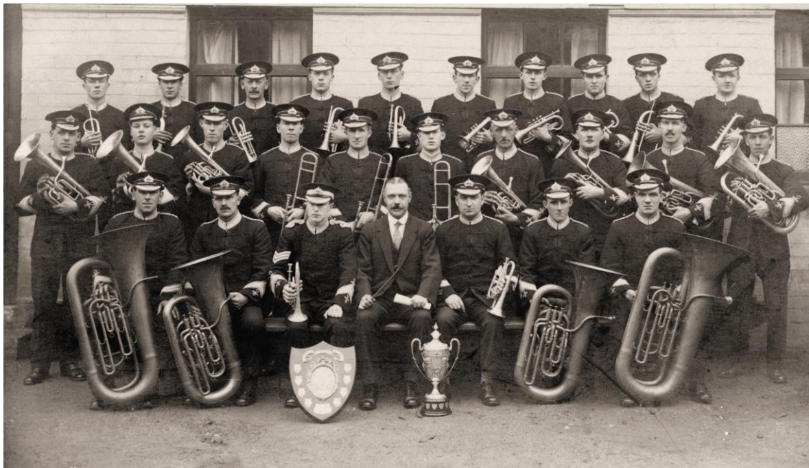
Shotts Foundry Brass Band

The Shotts Iron Works was established in 1801. Large amounts of coal, ironstone and lime in the Shotts area enabled the mass production of pig iron. The iron works and associated mines were the main source of industry in Shotts for over 150 years.