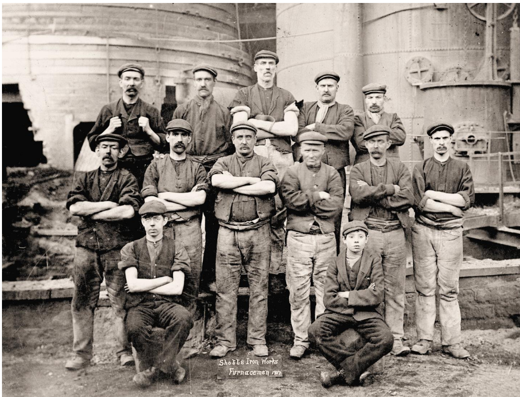
Shotts Iron Works Furnacemen, 1907