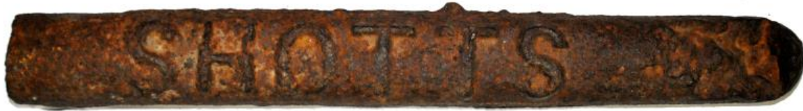
An ingot of Shotts pig iron

The Shotts Foundry Brass Band was founded in June 1829, with workers from the iron works. It acquired its first sheet music and band instruments from the Orbiston Community – six clarionets, a bag of flutes, two serpents, two bassoons, two keyed bugles, two French horns, a trumpet, a bass horn, a trombone and a drum. The Owenite co-operative community at Orbiston was the result of an experiment in social and utopian communities according to co-operative principles – following the philosophy of Robert Owen.