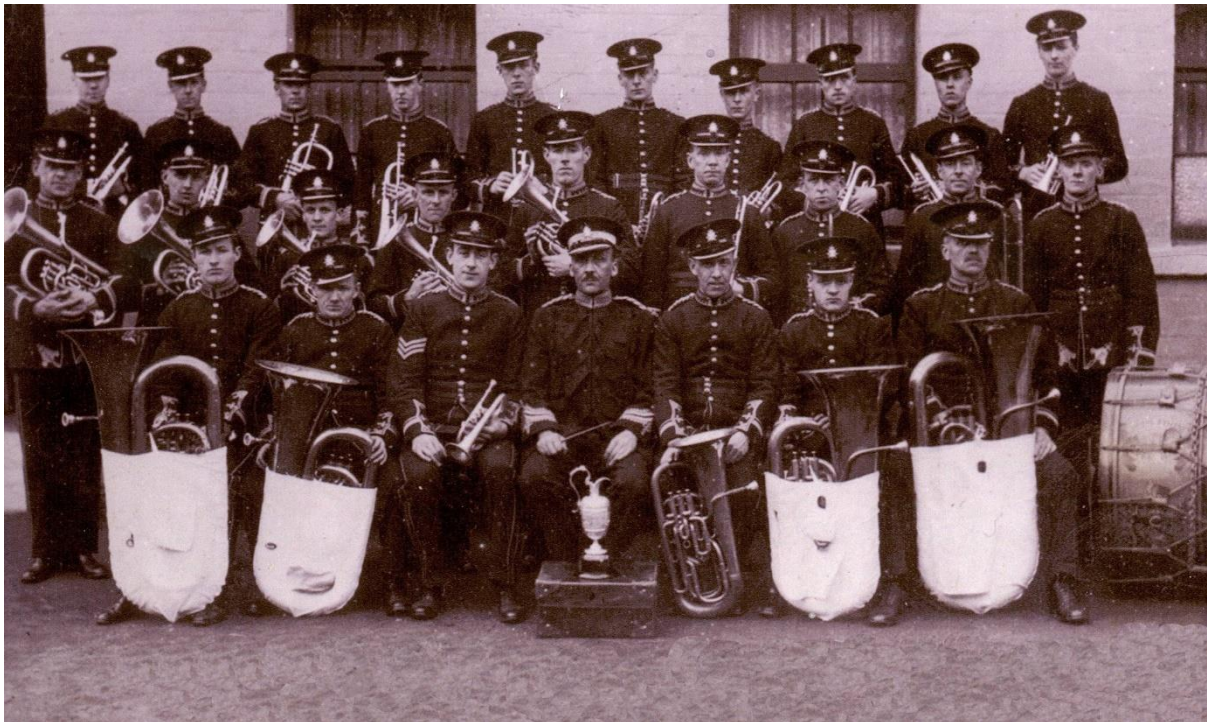
Shotts Foundry Band, 1933