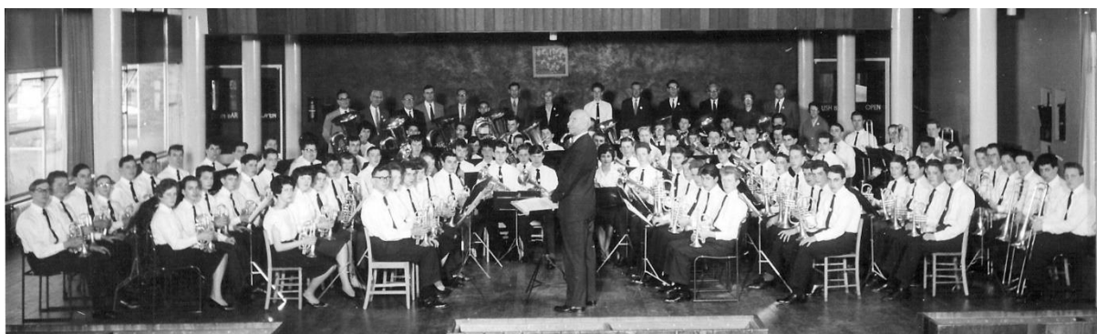
NYBB Easter course 1962, conductor Sir Adrian Boult