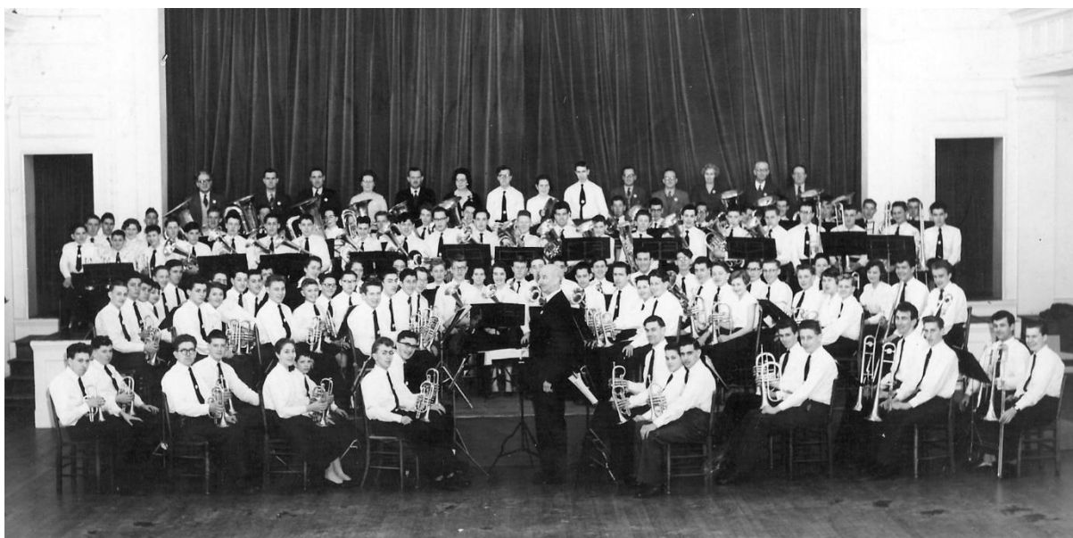
NYBB Easter course 1958, Cranleigh, conductor Sir Adrian Boult