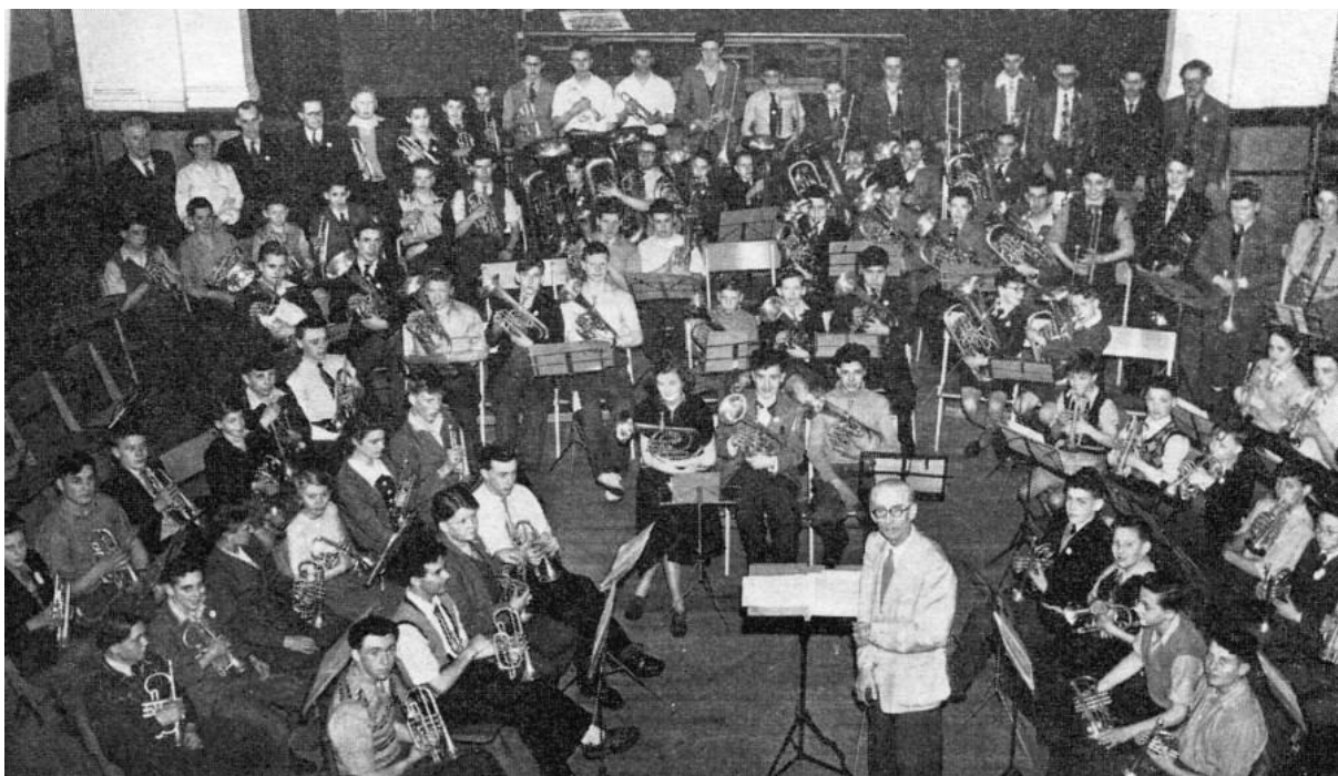
NYBB inaugural course, Easter 1952, Bradford, conductor Denis Wright

The following photographs are some early examples of those taken at each course as a record of the band and its members.