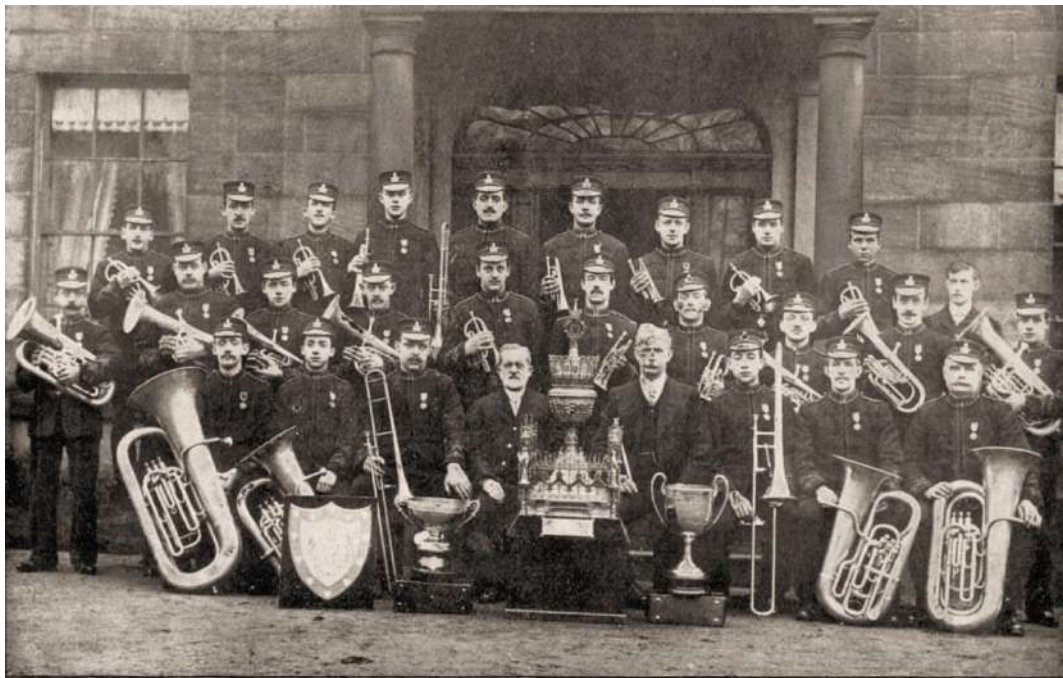
IRWELL SPRINGS BAND, Crystal Palace & Belle Vue Winners, 1905