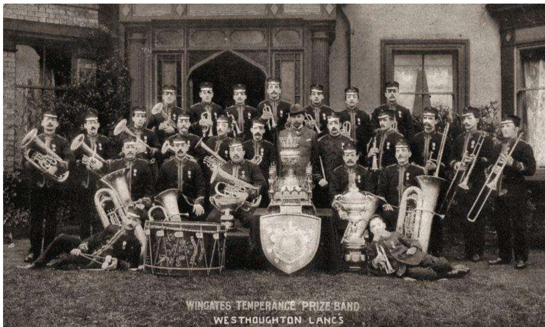
Wingates Band, 1906