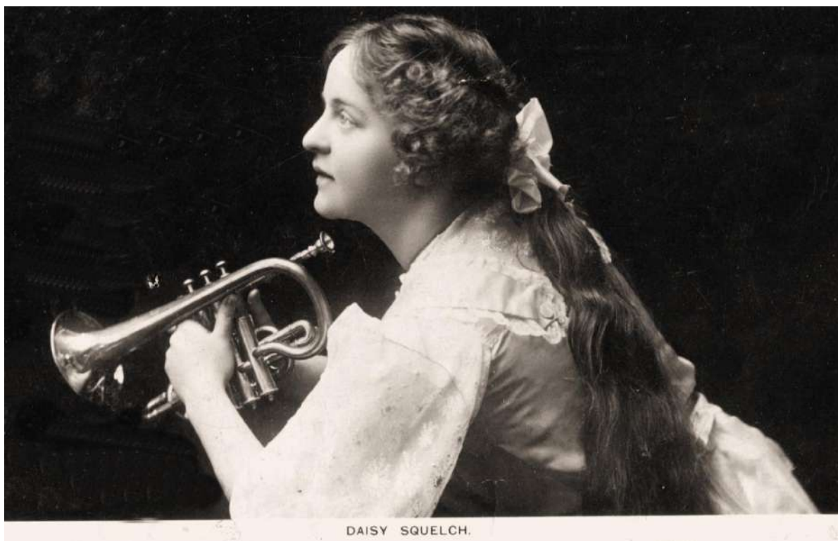
A promotional postcard, c. 1914

' Tannhauser ' overture, ' The Carnival of Venice ', ' The Lost Chord ' and ' The Rosary ', and the ensemble's rendition of ' Musical Memories '. The troupe then moved on to the Sheffield Hippodrome and the Newcastle-upon-Tyne Hippodrome later in the month, and at the Alhambra Theatre, Glasgow from 26 January 1914.