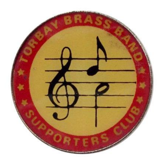
Torbay Brass Band