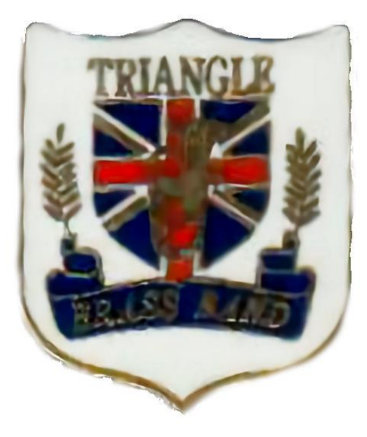
Triangle Brass Band, Cary, North Carolina, USA