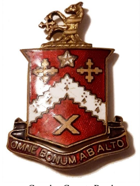
Crossley Carpets Band