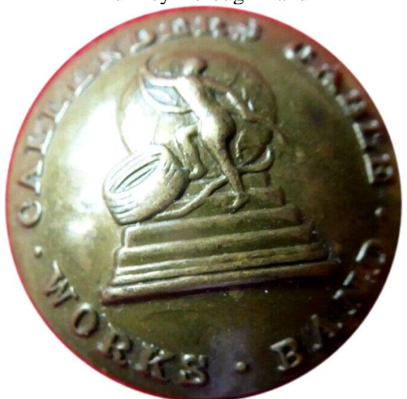
Callenders Cable Works Bamd