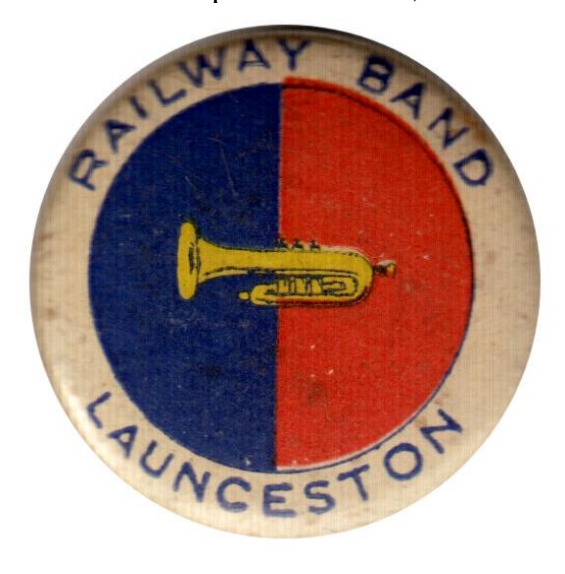
Launceston Railway Band, Australia