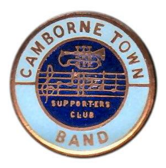
Camborne Town Band