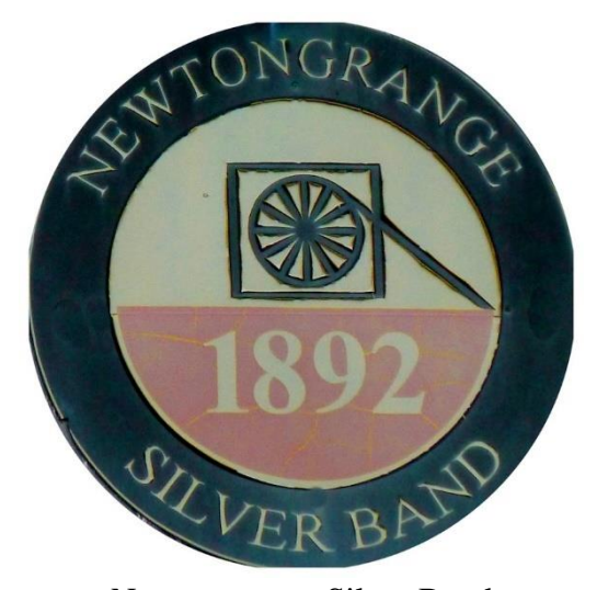
Newtongrange Silver Band