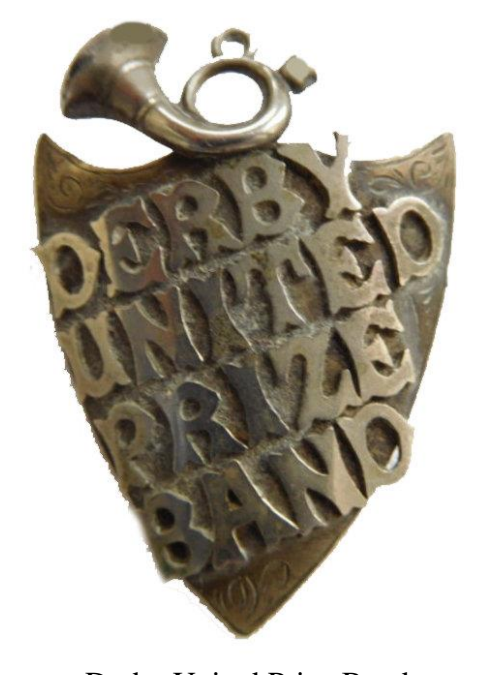
Derby United Prize Band