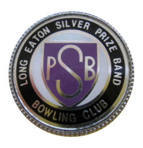
Long Eaton Silver Prize Band