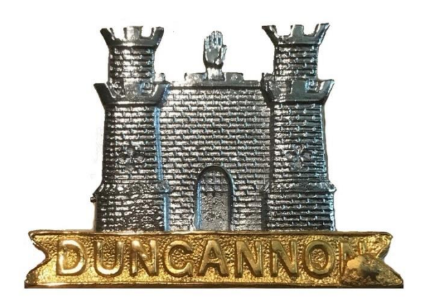
Dungannon Silver Band, Northern Ireland