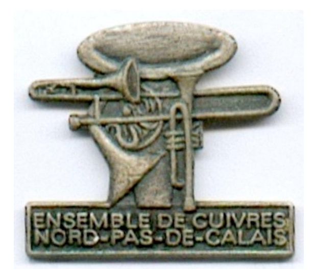
Ensemble de Cuivres, Nord-pas-de-Calais, France