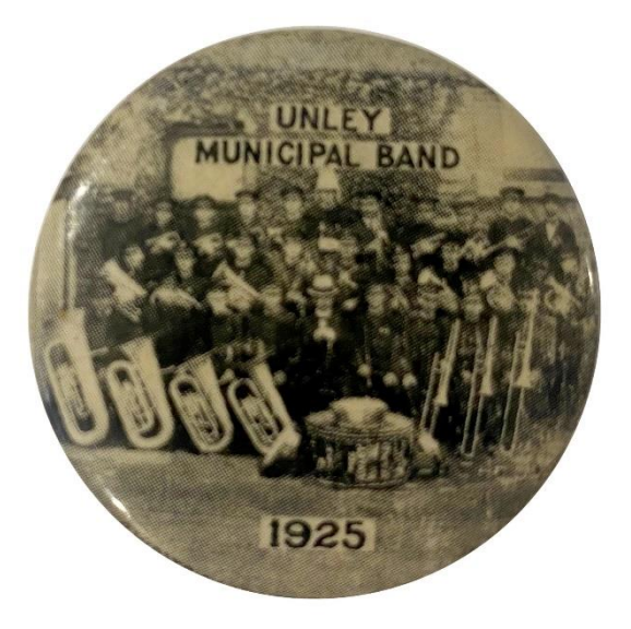
Unley Municipal Band, Australia