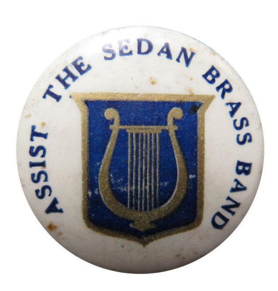
Sedan Brass Band, Australia