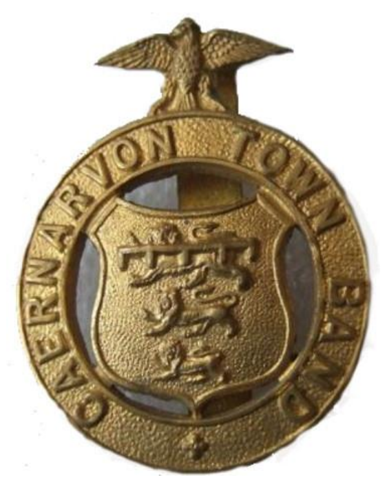
Caernarvon Town Band