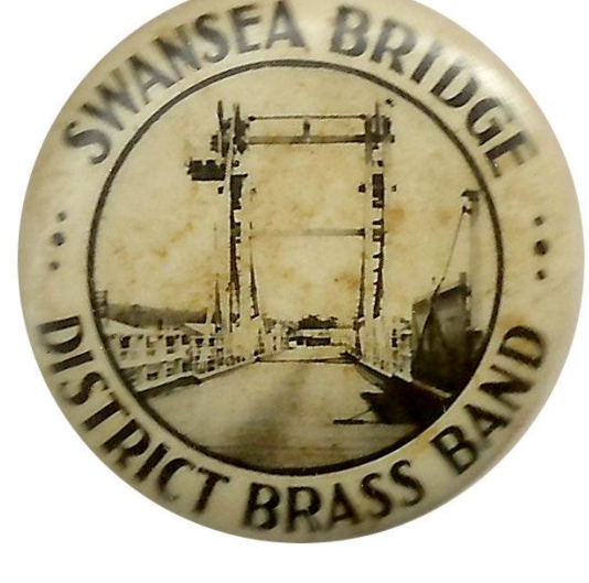
Swansea Bridge District Brass Band, Australia