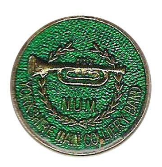
Yorkshire Main Colliery Band