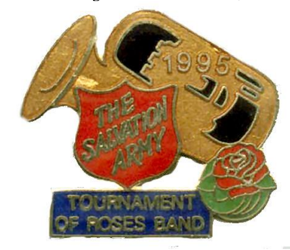
Tournament of Roses Band (Salvation Army), USA