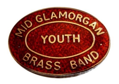
Mid Glamorgan Youth Brass Band