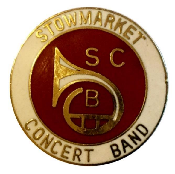
Stowmarket Concert Band