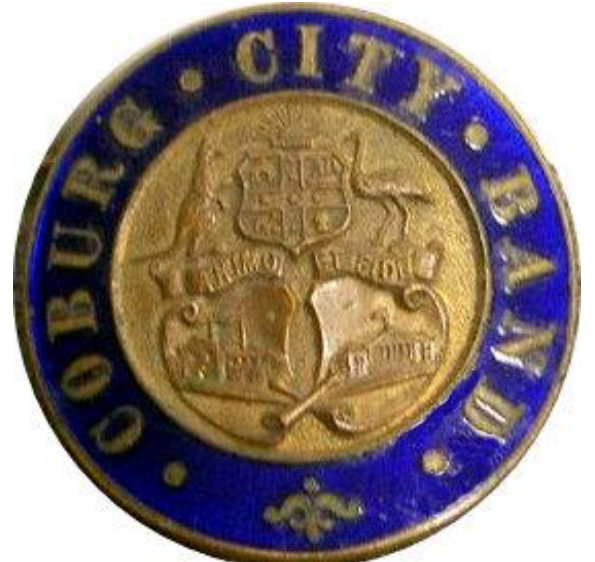
Coburg City Band, Australia