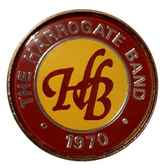
Harrogate Band (1990's)