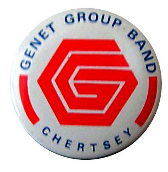
Genet Group Band, Chertsey