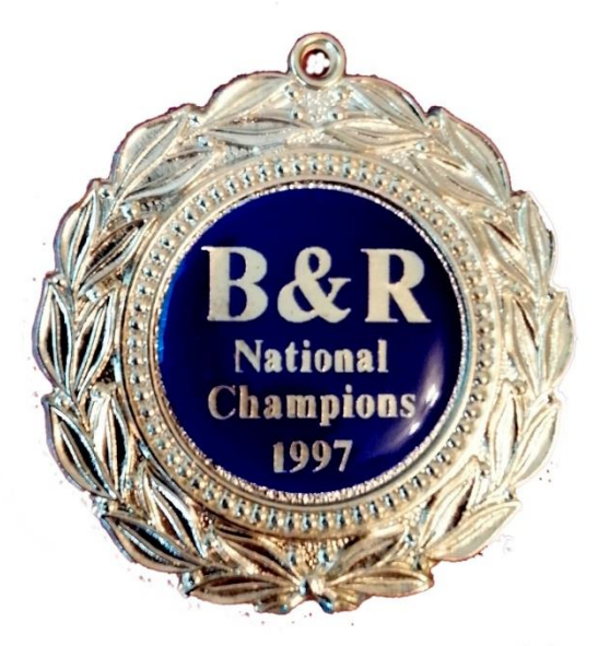
Brighouse & Rastrick Band