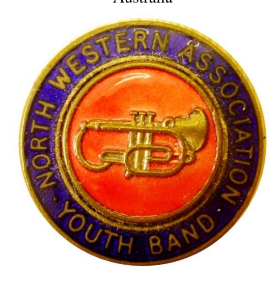
North Western Association Youth Band