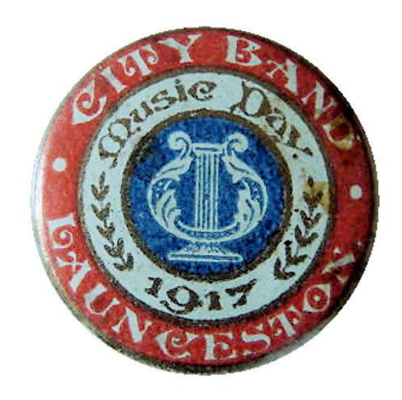
Launceston City Band, Australia