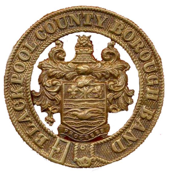
Blackpool County Borough Band