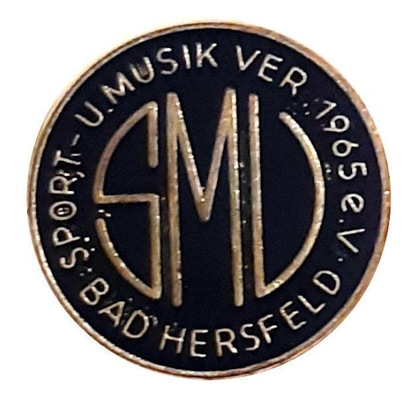
Sport-und-Muskverein, Bad Hersfeld, Germany