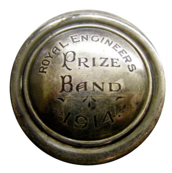
Royal Engineers Prize Band