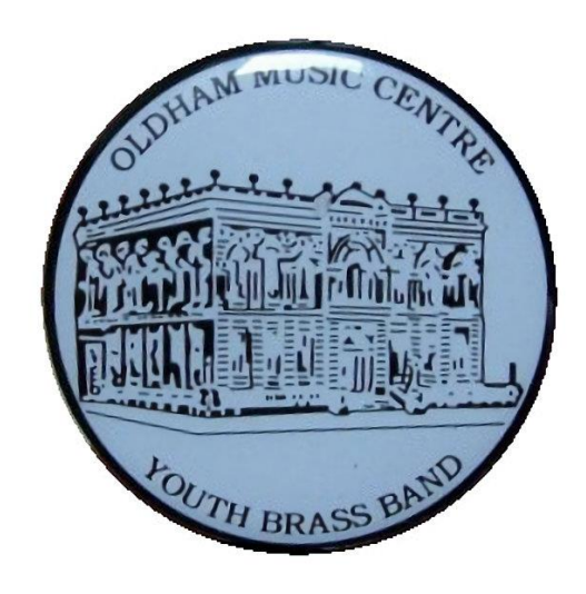
Oldham Music Centre Youth Band