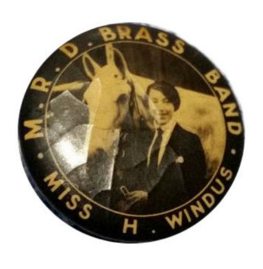
Manning River District Band, Australia