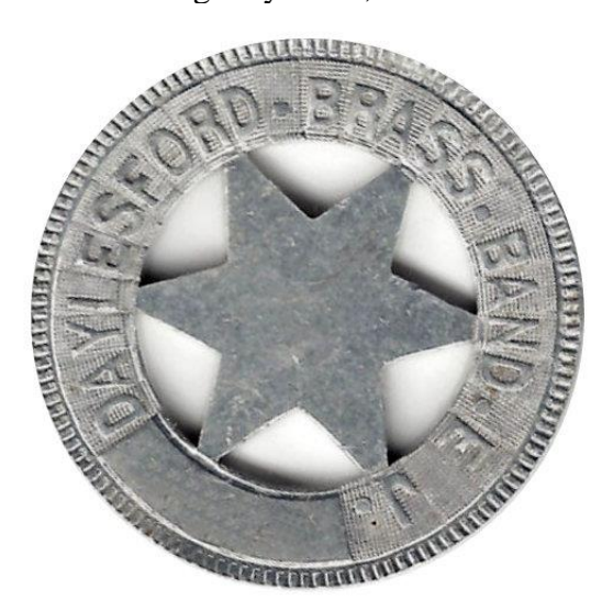
Daylesford Brass Band, Australia