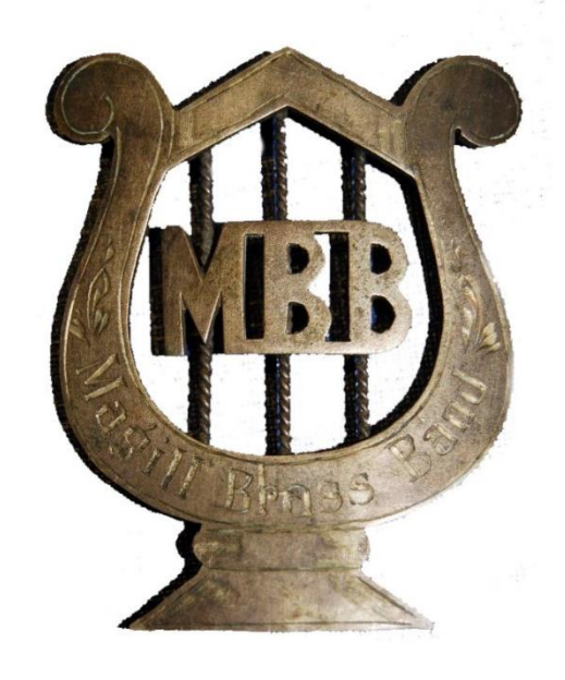
Magill Brass Band, Australia