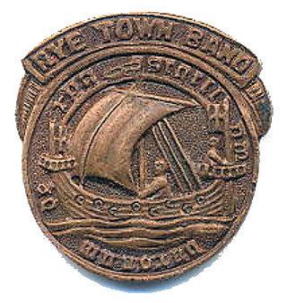
Rye Town Band