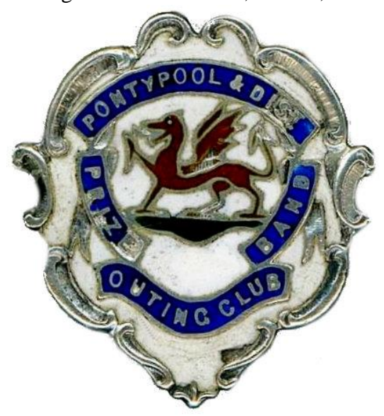
Pontypool & District Prize Band