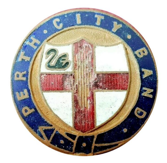
Perth City Band, Australia