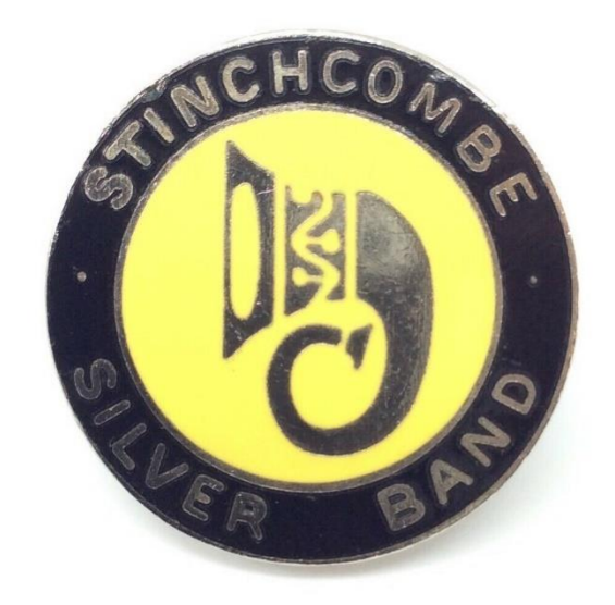
Stinchcome Silver Band