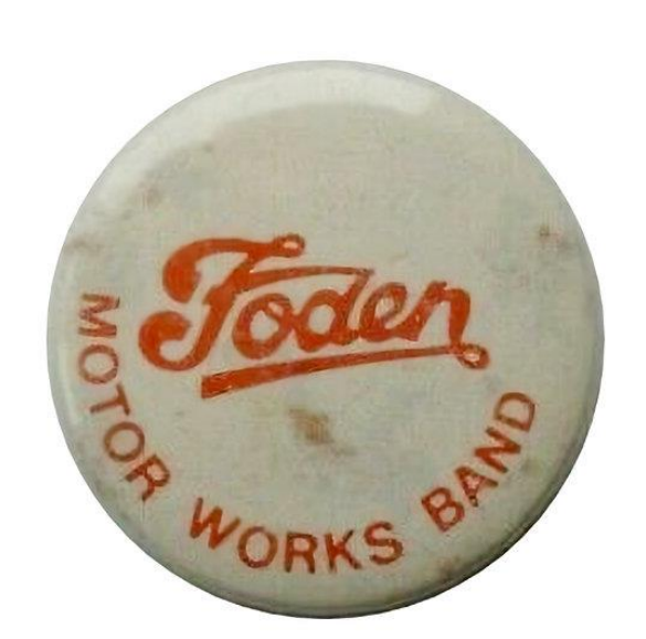
Foden Motor Works Band