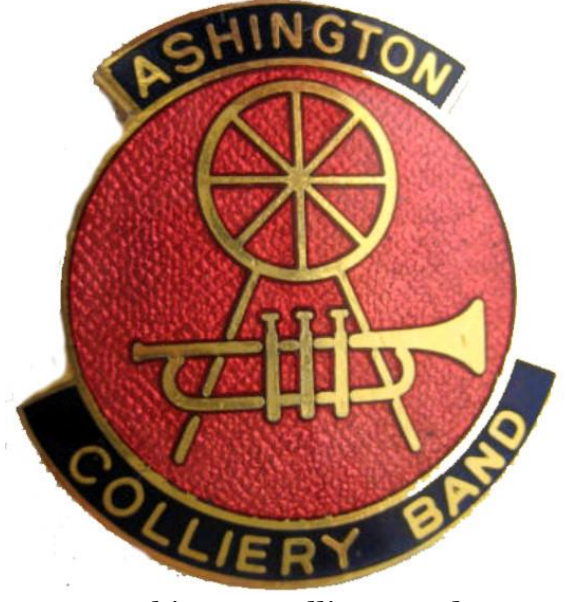
Ashington Colliery Band