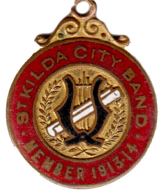
St Kilda City Band, Australia