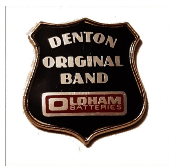
Denton Original Band