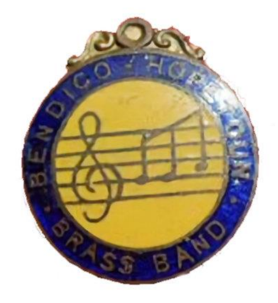
Bendigo Hopetoun Brass Band, Australia