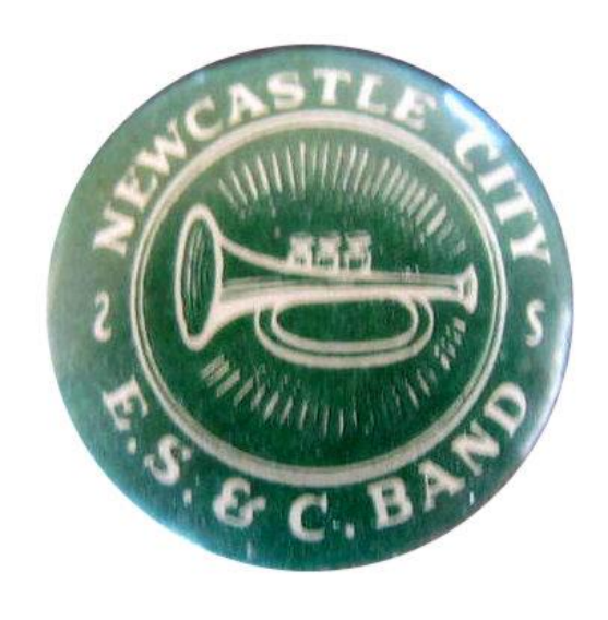
Newcastle City Ex-Servicemen & Comrades Band, Australia