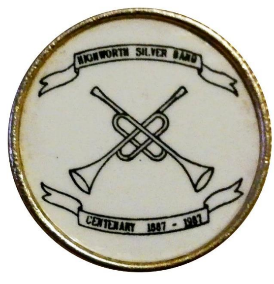
Highworth Silver Band