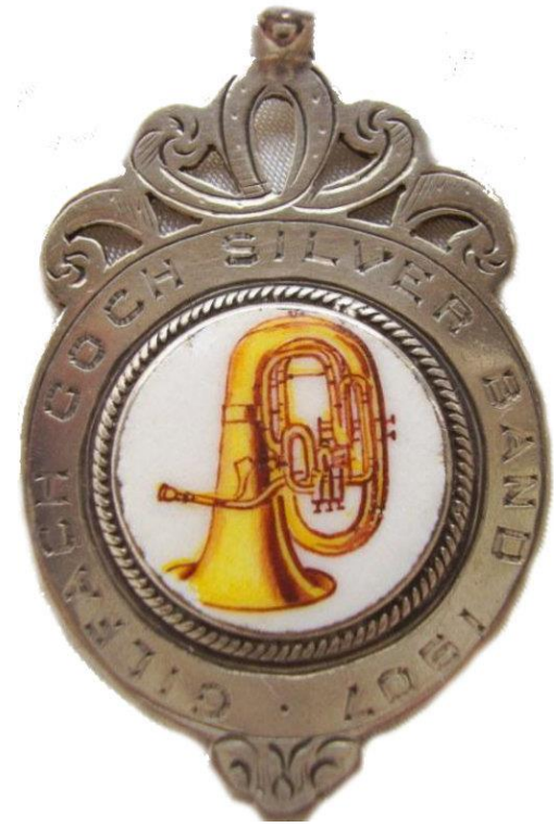
Gilfach Goch Silver Band