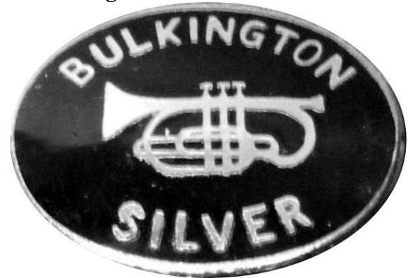
Bulkington Silver Band