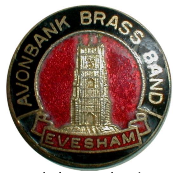
Avonbank Brass Band, Evesham