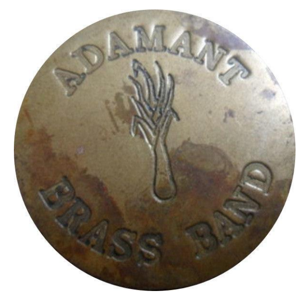
Adamant Brass Band

Badges, made of metal or more recently, plastic, have been worn by the players in bands and their supporters since the late 19<sup>th</sup> century. Most would have been pinned to jackets or band uniforms, and some would have been sold to people as souvenirs. All the items below are British in origin unless otherwise specified.