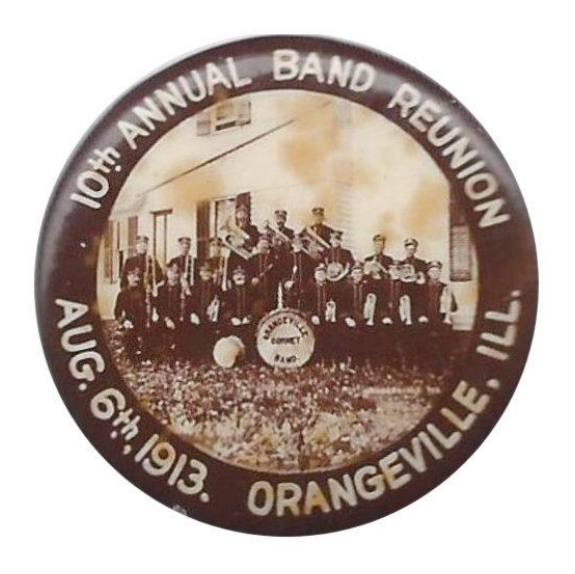
Orangeville Cornet Band, Illinois, USA