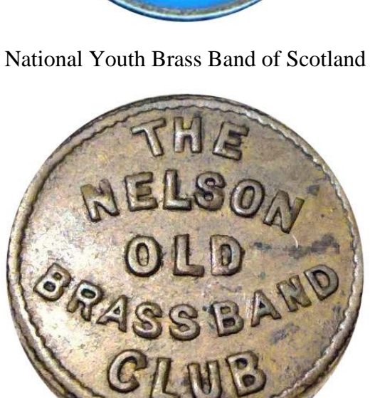
Nelson Old Brass Band