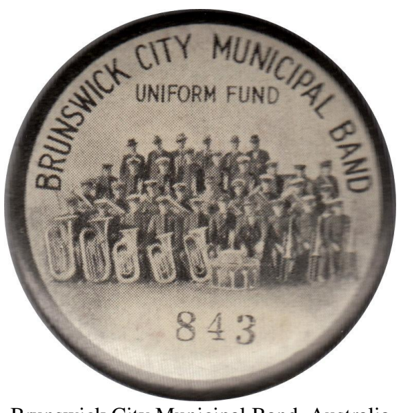
Brunswick City Municipal Band, Australia