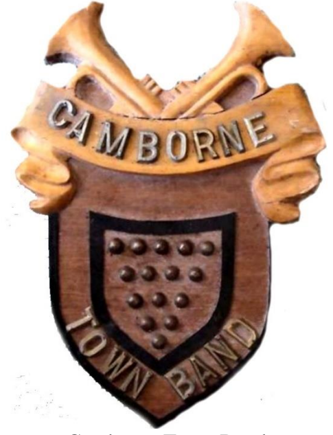
Camborne Town Band