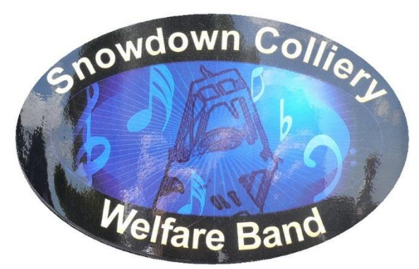
Snowdown Colliery Welfare Band