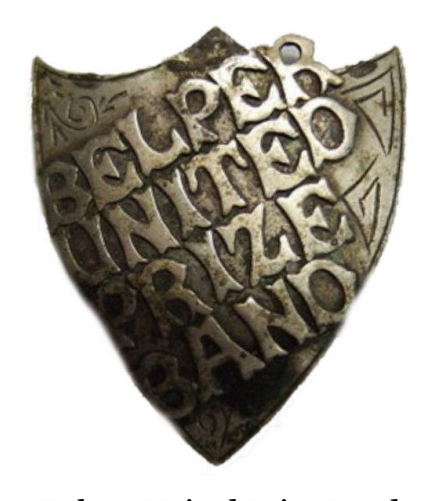
Belper United Prize Band