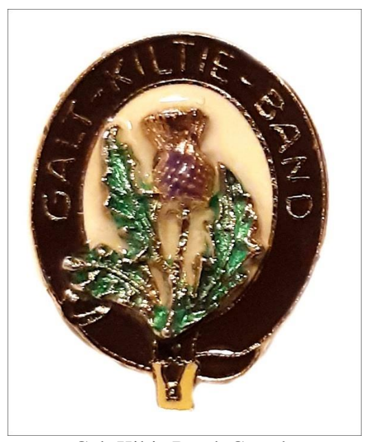
Galt Kiltie Band, Canada