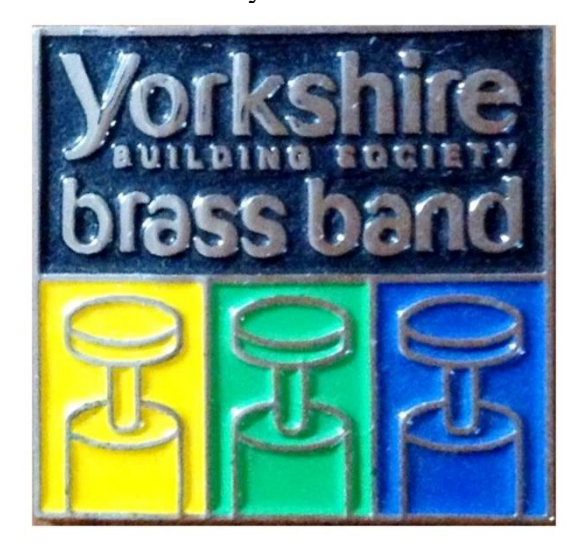
Yorkshire Building Society Brass Band