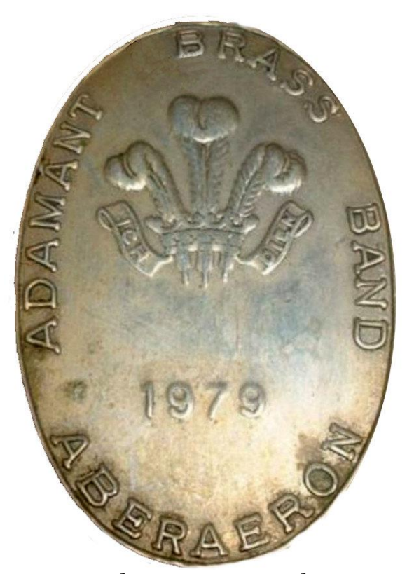
Adamant Brass Band