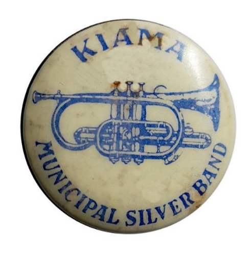
Kiama Municipal Silver Band, Australia