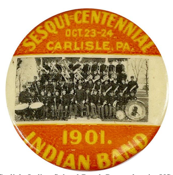
Carlisle Indian School Band, Pennsylvania, USA