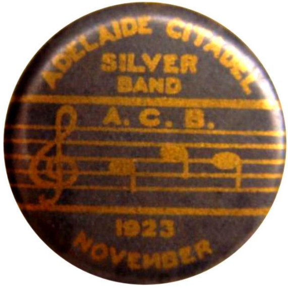
Adelaide Citadel Silver Band, Australia