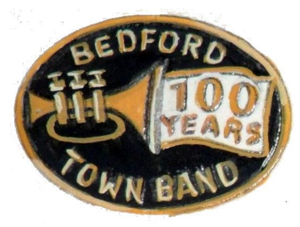
Bedford Town Band