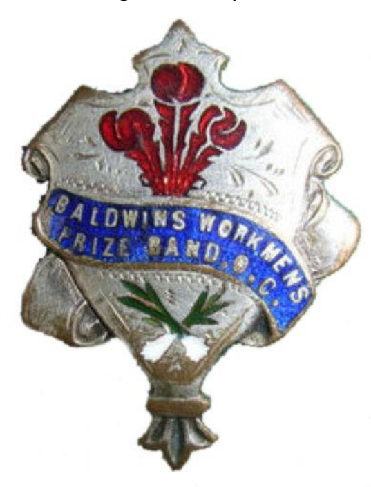
Baldwins Workmens Prize Band, Kenfig