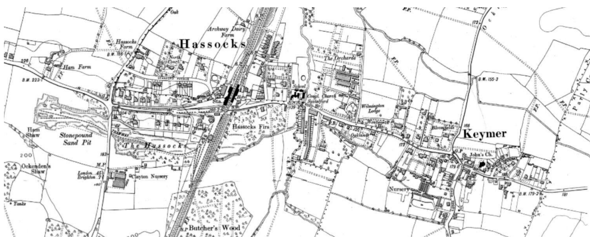
Hassocks & Keymer villages, c. 1910