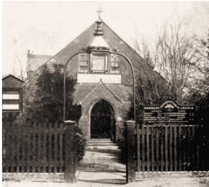
Hassocks Congregational Church