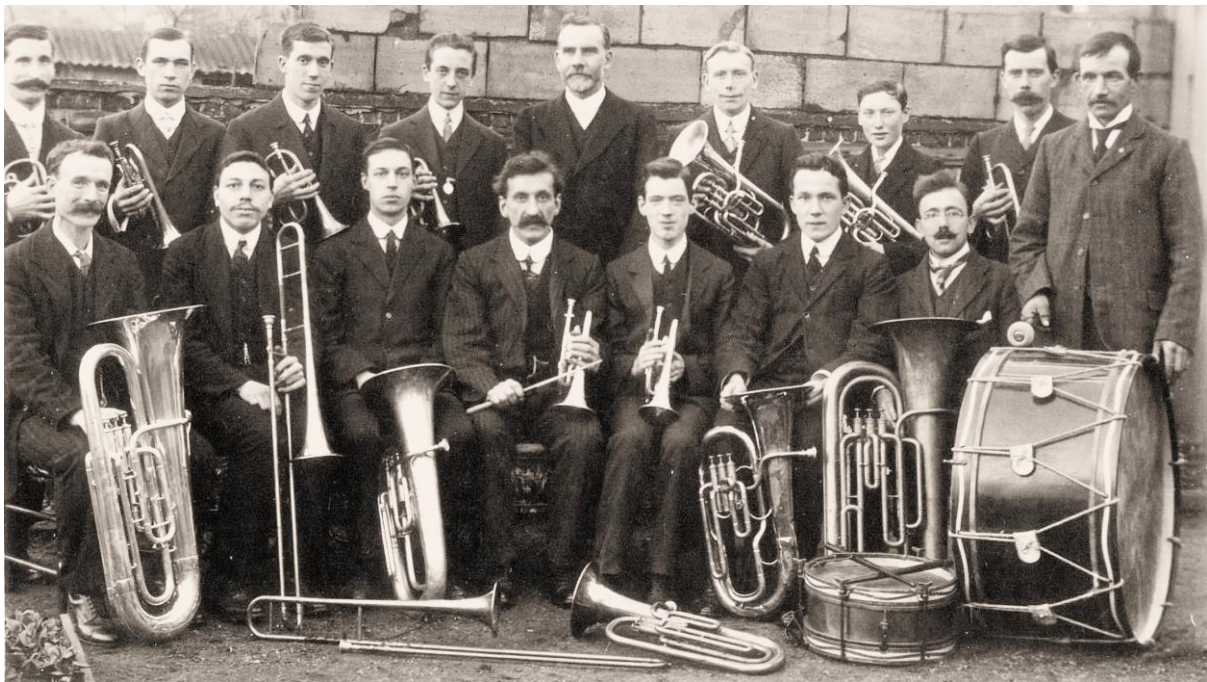
Hassocks Congregational Church Brass Band, c. 1911