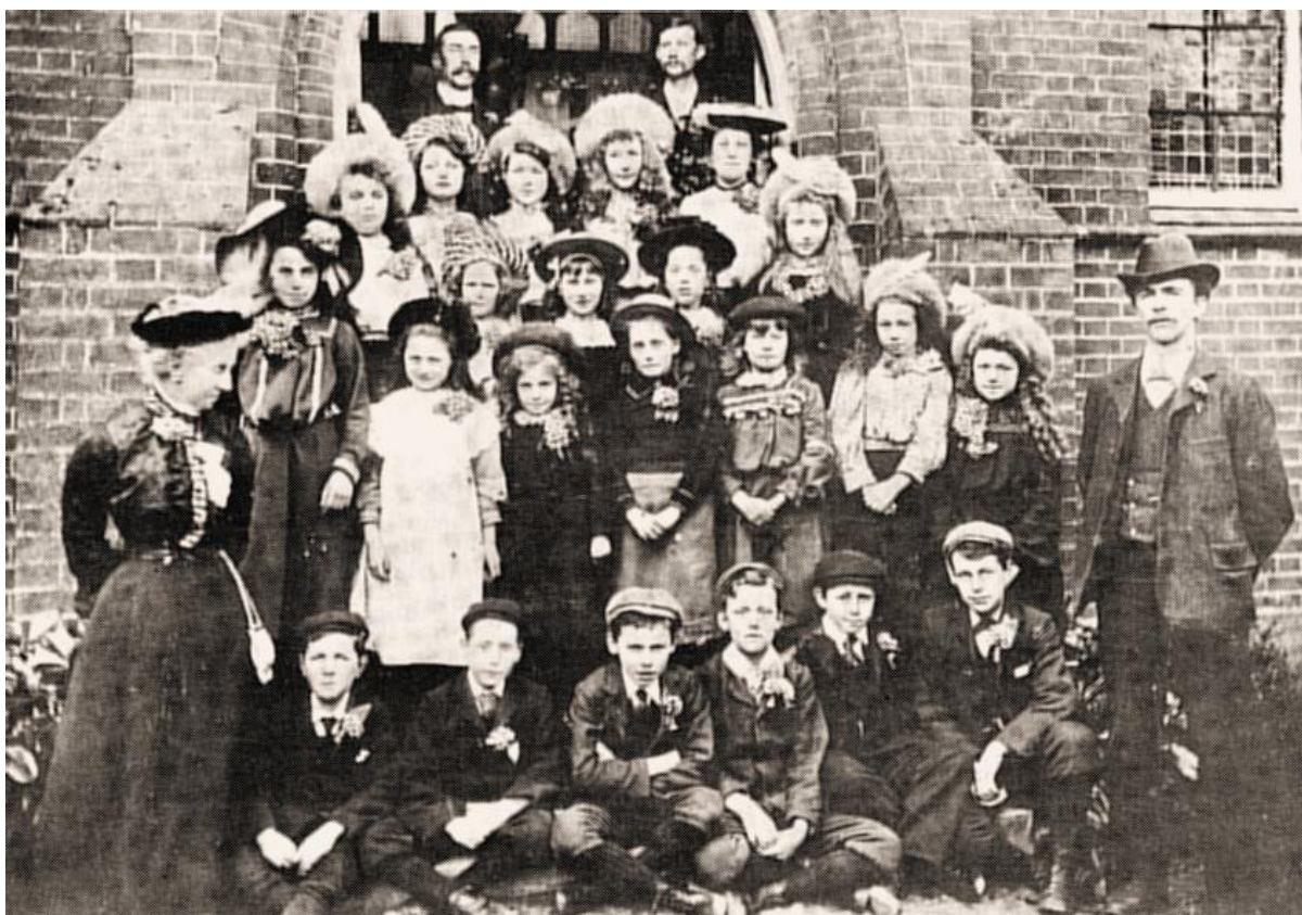
Members of Hassocks Congregational Church

The band does not reappear until the late 1920's. Further research is required to determine the fate of the band after 1911. It is most probable that it did not survive WW1, but was re-established some 15 years later.