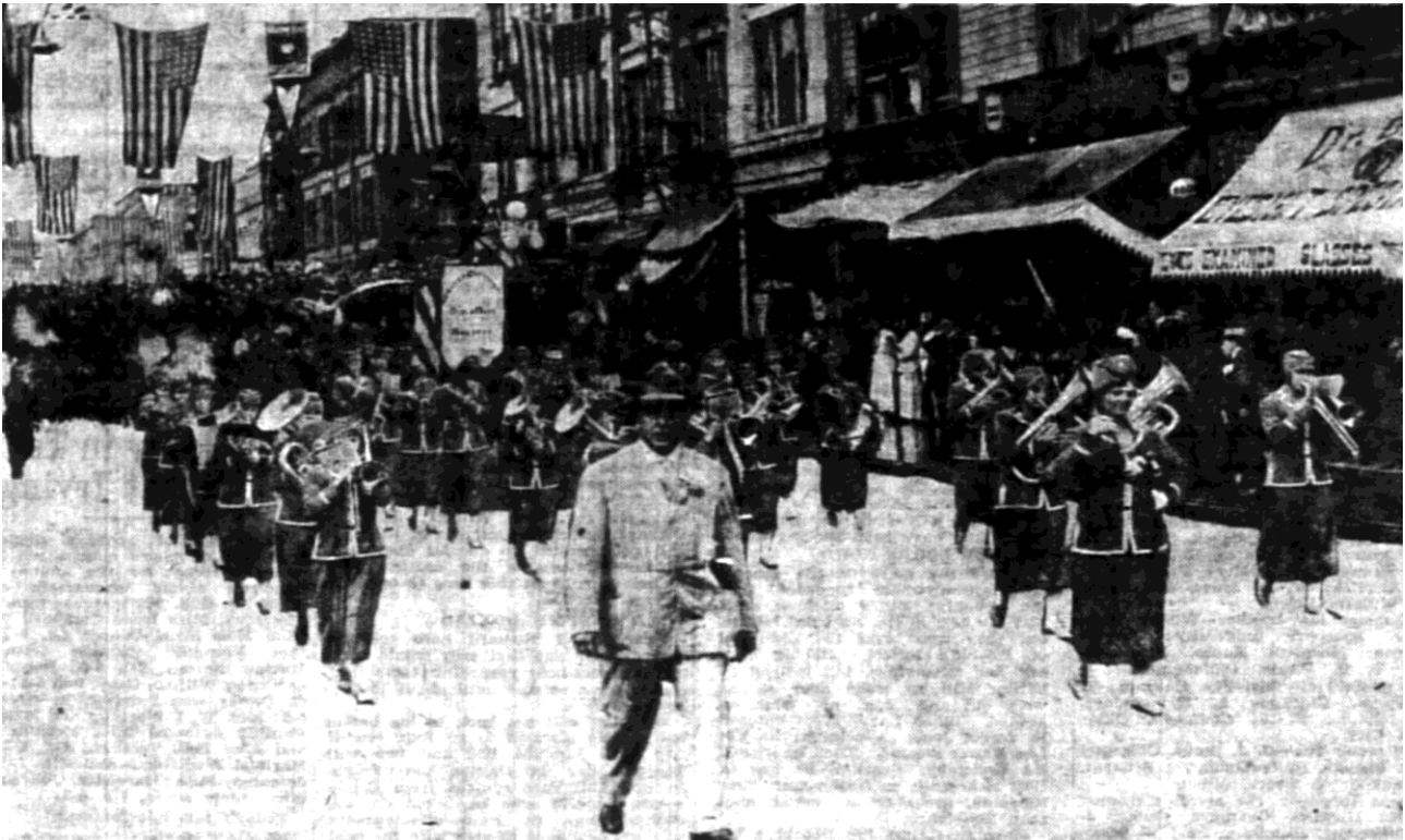
The girls' band marching in the Portland Victory Rose Festival Parade

they ended their day in Portland by serenading the staff at the offices of the Oregon Daily Journal. 7