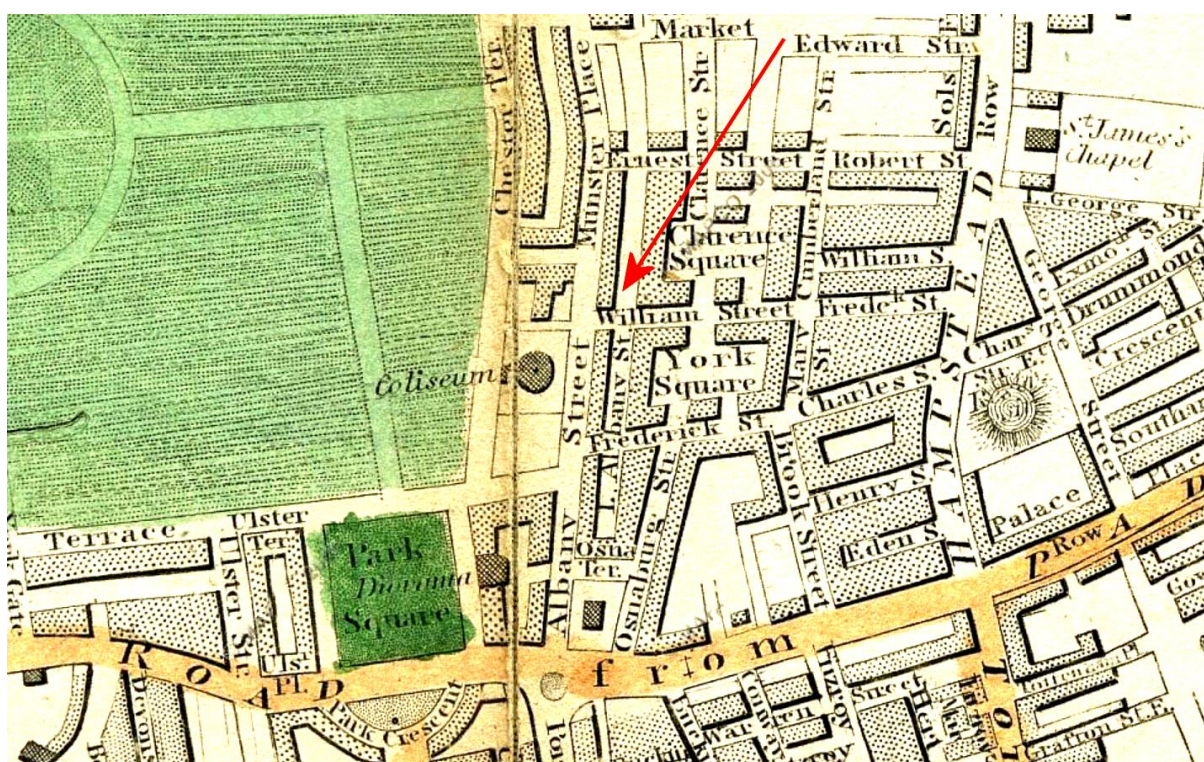
Little Albany Street, just to the east of Regent's Park, London, c. 1830