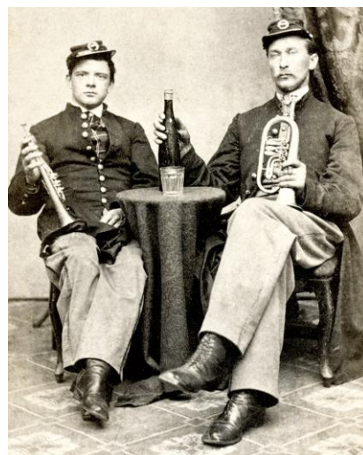
Two unknown Civil War musicians