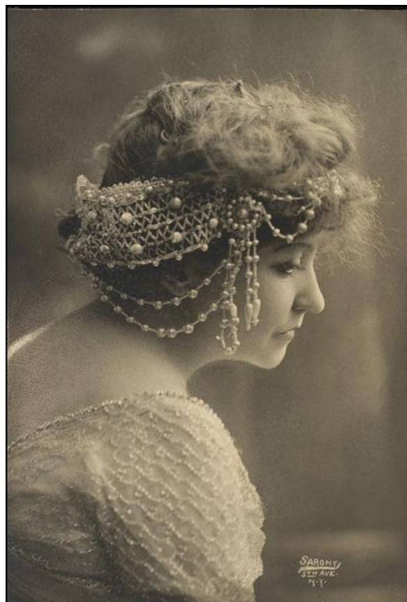
Minnie Maddern – the famous actress