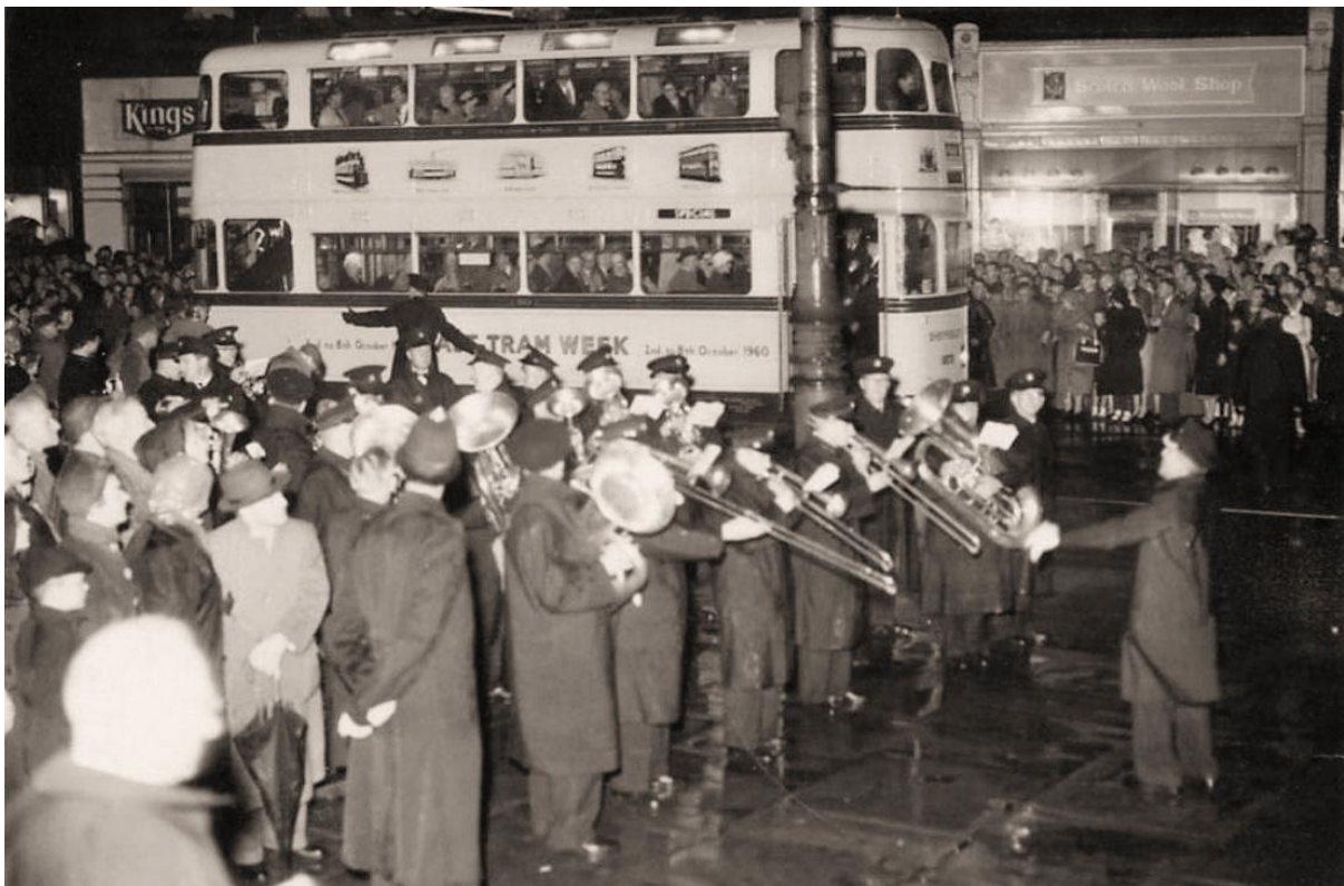
Sheffield Transport Band, playing for the last trams in Sheffield, 1960