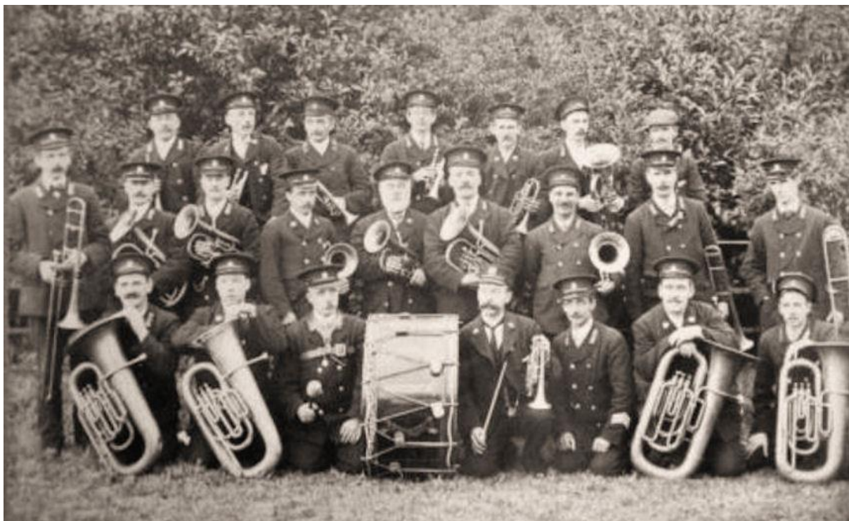
Sheffield Corporation Tramway Employees' Brass Band, c. 1910