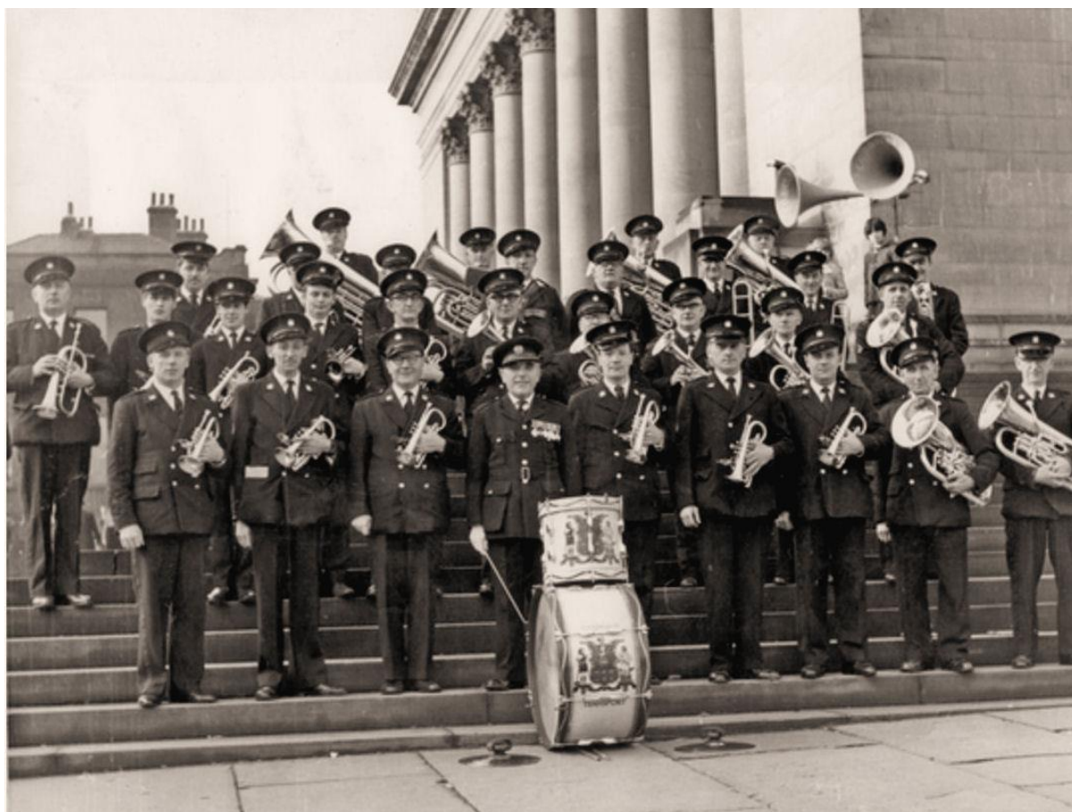
Sheffield Transport Band, 1967