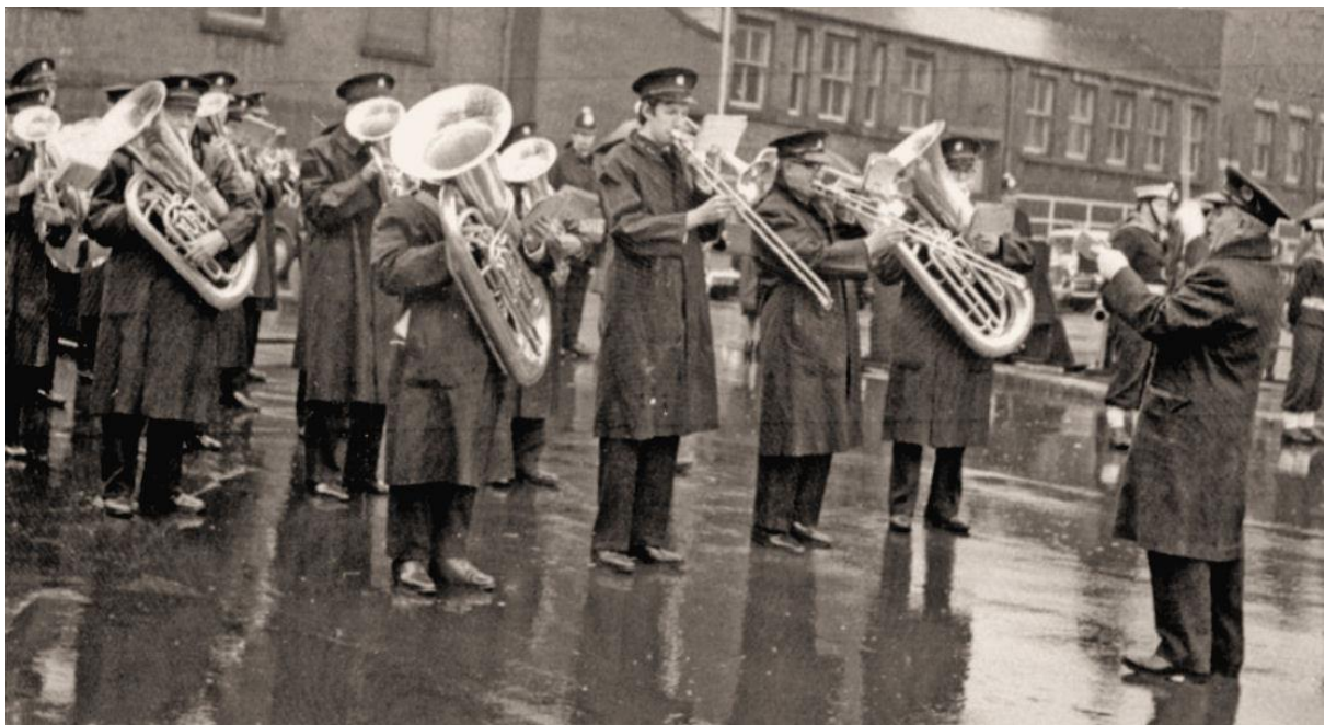
Sheffield Transport Band, 1954