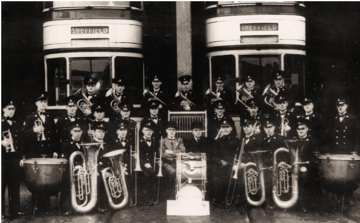
Sheffield Transport Band, c. 1957