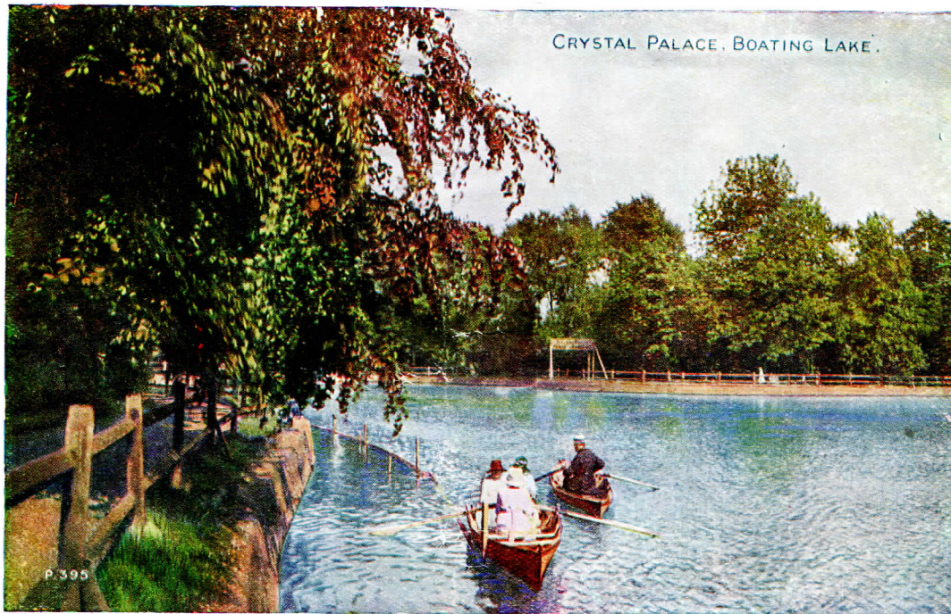
CRYSTAL PALACE BOATING LAKE.