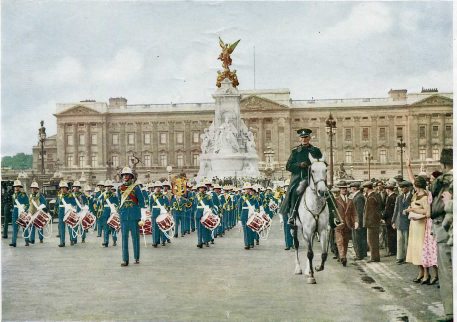
BAND OF THE ROYAL MARINES AT BUCKINGHAM PALACE, AUGUST, 1935

Being the 35th Anniversary of the GREAT NATIONAL BAND FESTIVAL